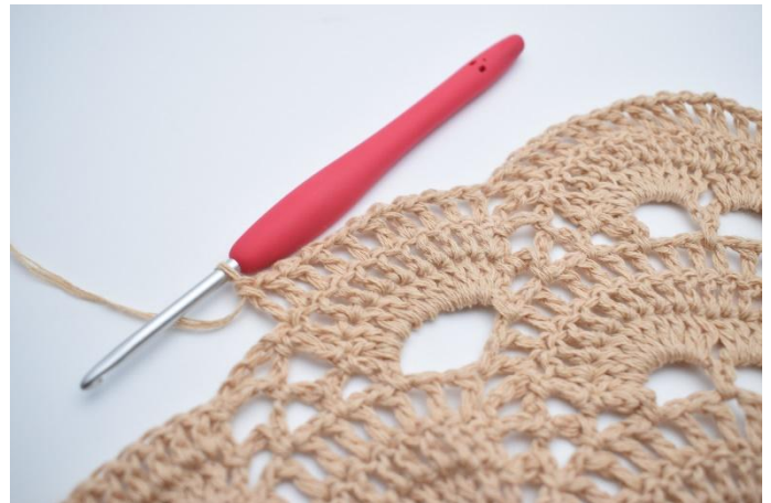
55. "Ch 1, dc 1" in all dc of the large ch-gap (10 dc).