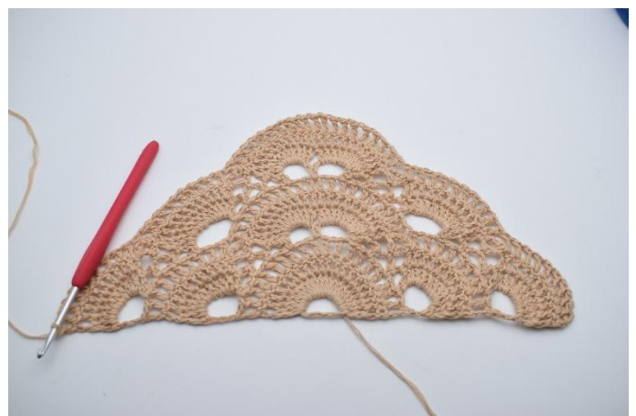
57. "Ch 1, dc 1" in all the remaining dc of the last large ch-gap (10 dc).