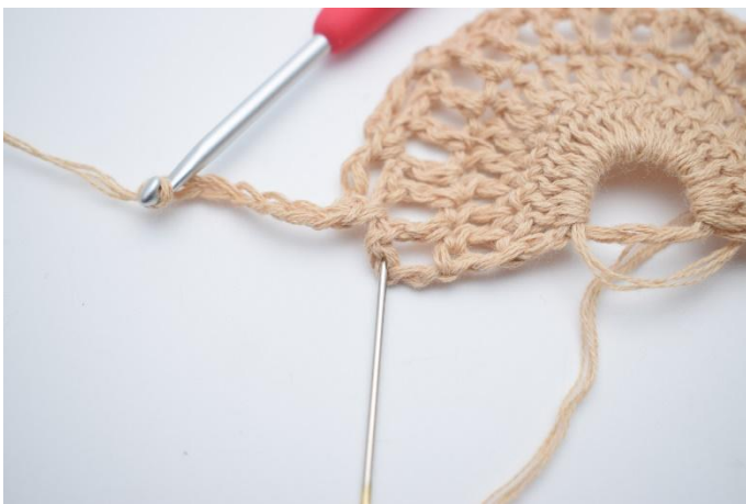
15. Dc 1 in 3rd ch st. The needle marks where your dc 1 goes.