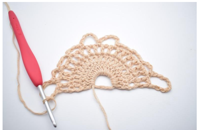
16. Like this.