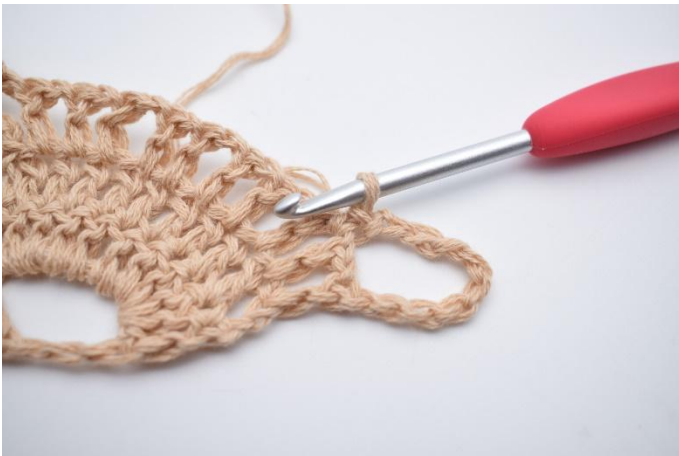
18. Like this.