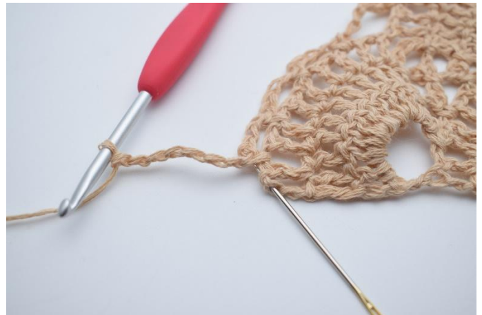
31. Ch 7 and dc 1 in last st. The needle marks where to dc 1.