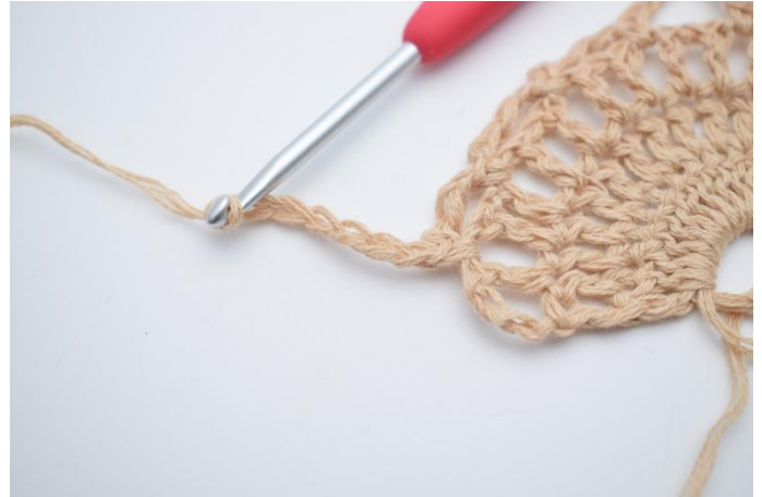
14. Ch 7.