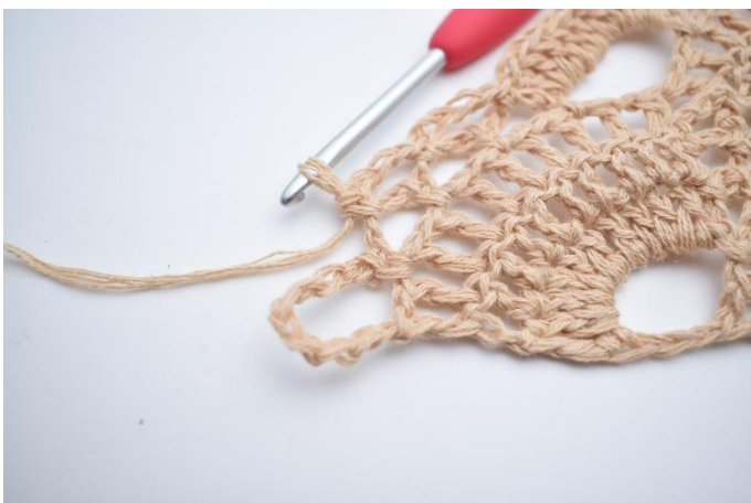
43. Ch 4, sc 1 in the next ch-gap. Repeat once more so you have 2 small ch-gaps.