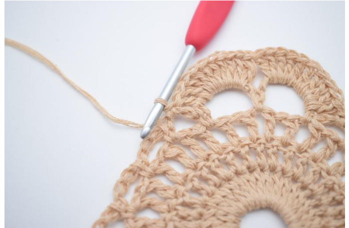
10. Like this.