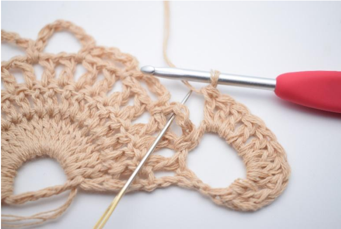
3. Sc 1 in next ch-gap. The needle marks where to sc 1.