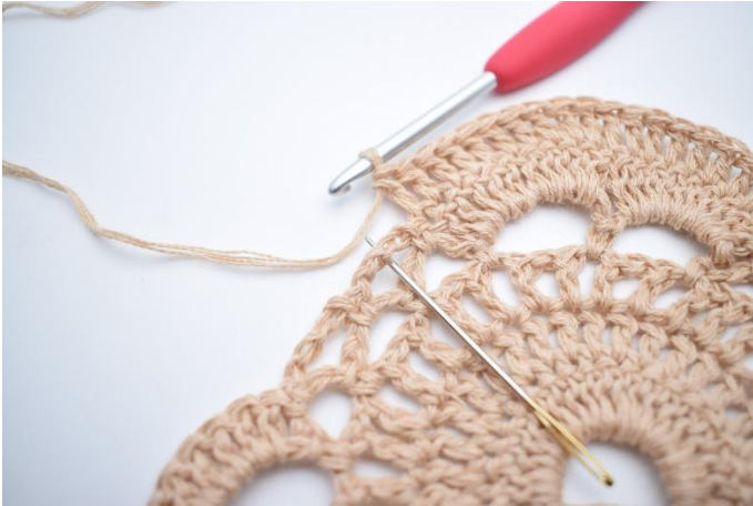
7. Sc 1 in next ch-gap. The needle marks where to sc 1.