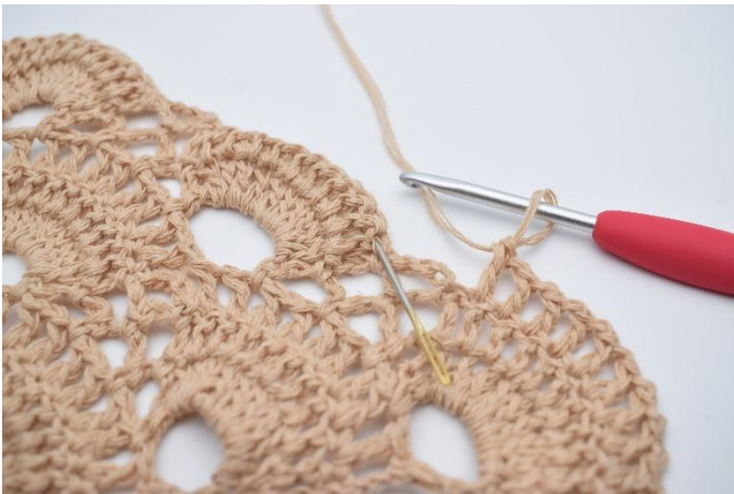
48. Skip the small ch-gap and dc 1 into the first dc of the next large ch-gap. The needle marks where to put your next dc.