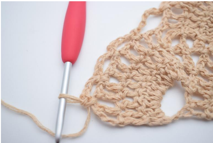
30. "Ch 4, skip 1 ch space, sc 1 in next ch space". Repeat from " to " a total of 3 times so you have 3 small ch-gaps.