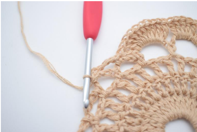
11. Ch 4 and sc 1 in next ch-gap.