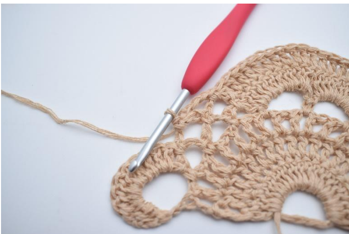
9. Ch 4 and sc 1 in next ch-gap. The needle marks where to sc 1.