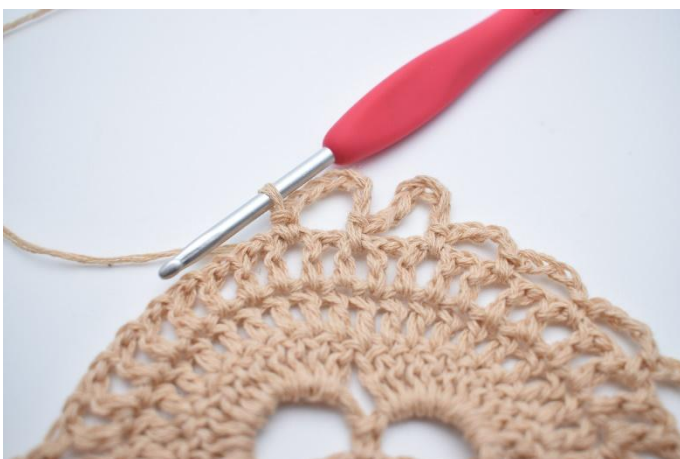
26. Ch 7, skip 1 ch space and sc 1 in next ch space.