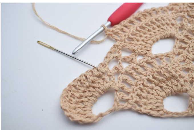
56. Skip the small ch-gap and dc 1 into the first dc of the last large ch-gap. The needle marks where to put your next dc.