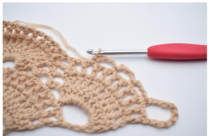
21. Repeat once more so you have 3 small ch-gaps.