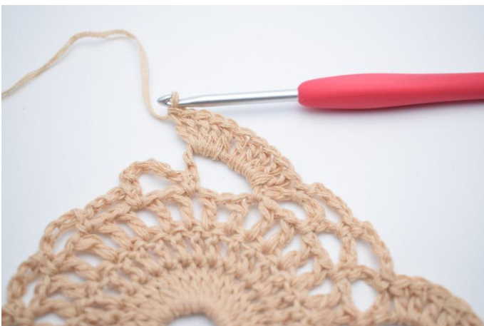
7. Dc 10 into the next large ch-gap.