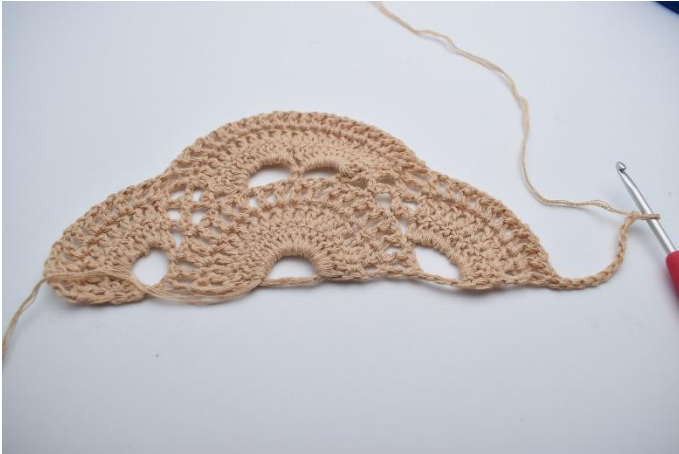
16. Ch 10 and turn (counts as dc 1 and ch 7).