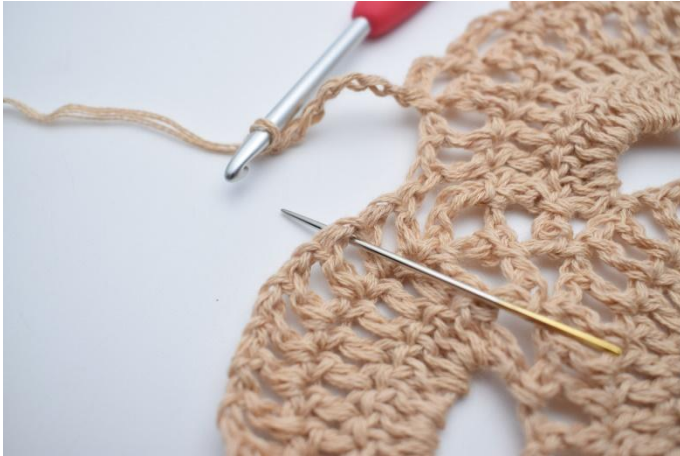
28. Chain 7 and skip 2 ch spaces. Sc 1 in next ch space. The needle marks where to sc 1.