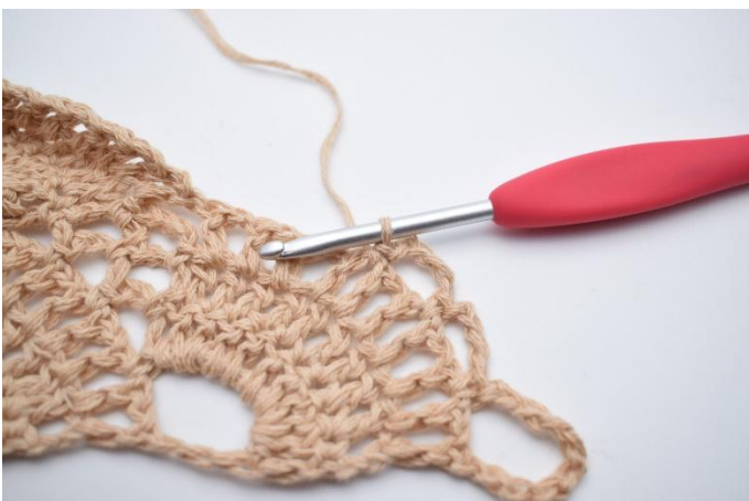
20. Ch 4, skip 1 ch space, sc 1 in next ch space.