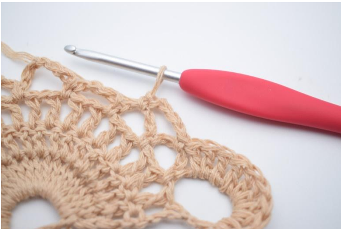
5. Ch 4, sc 1 in next ch-gap.