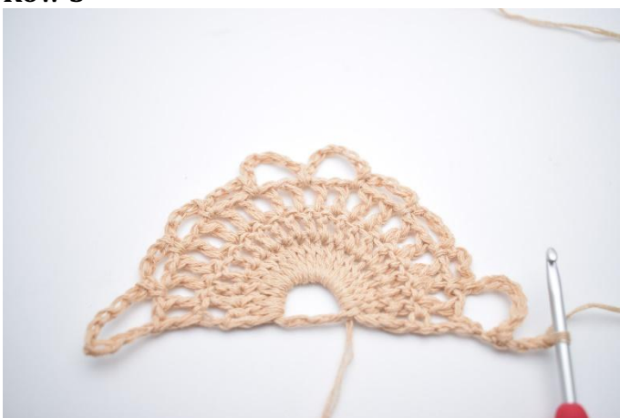
1. Ch 3 and turn (counts as dc 1).