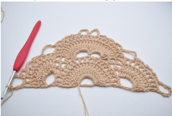
32. Like this.