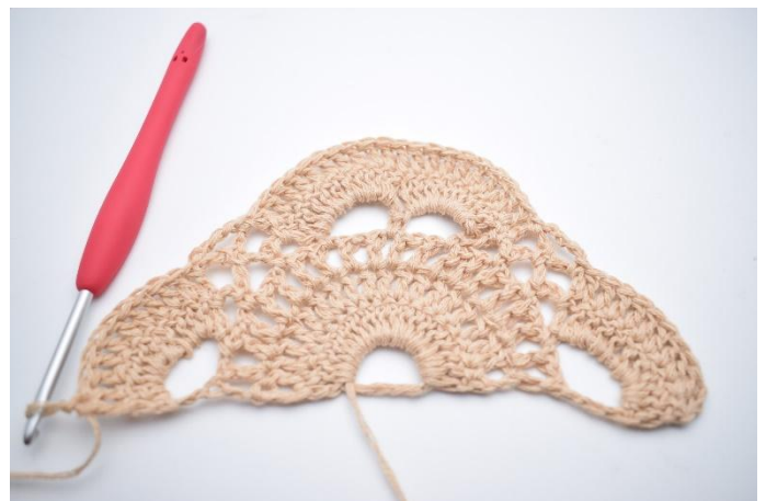
10. Dc 1 in each of the st of the last large ch-gap. (10 dc)