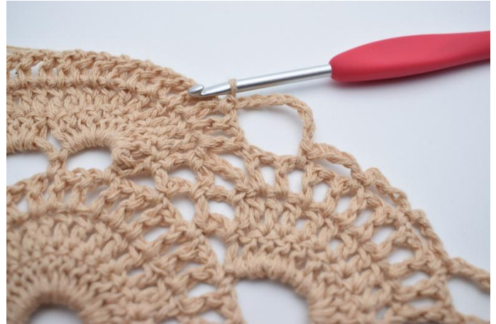
23. Like this.