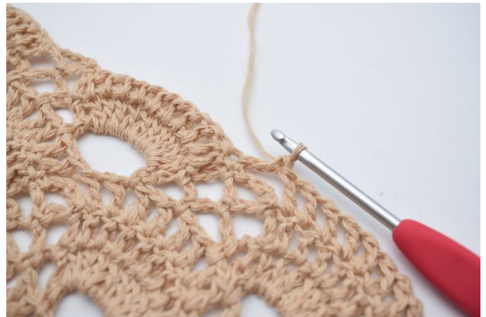
49. Like this.