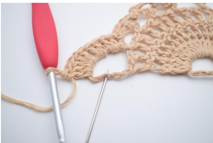
13. Dc 10 into the last large ch-gap. The last dc is crocheted into the 3rd ch marked here by the needle.