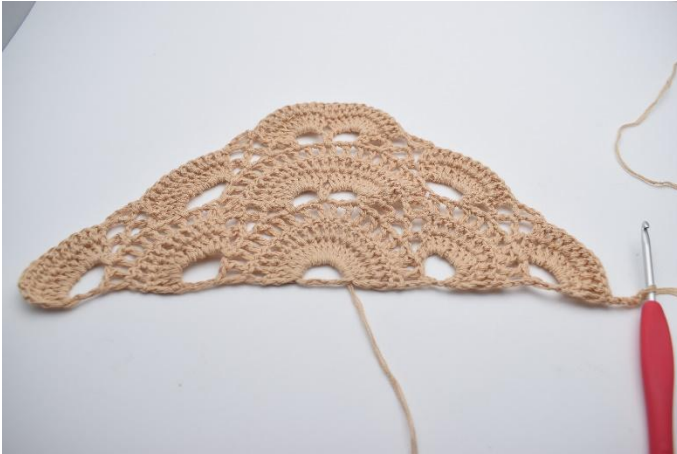
46. Ch 4 and turn (counts as dc 1 and ch 1).