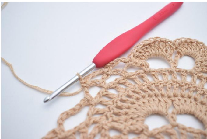
41. Ch 4, sc 1 in the next ch-gap. Repeat once more so you have 2 small ch-gaps.