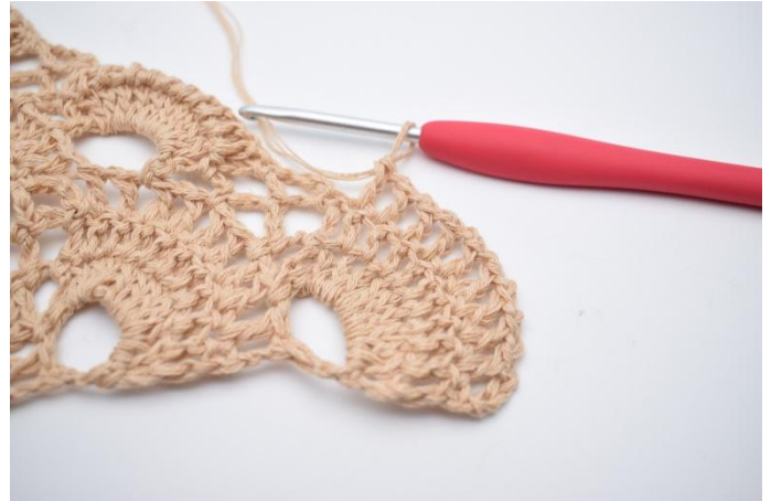
47. Dc 1 in next st. "Ch 1, dc 1" in all dc of the large ch-gap (10 dc).