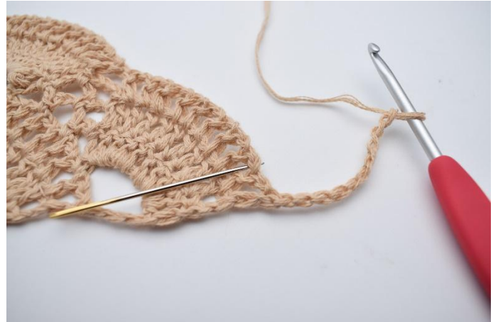
17. Skip 1 ch space and sc 1 in next ch space. The needle marks the ch space in which to sc 1.