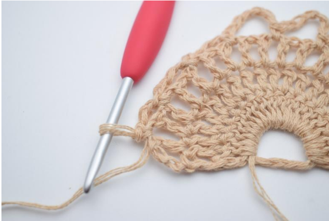
13. Repeat once more so you have 3 small ch-gaps.