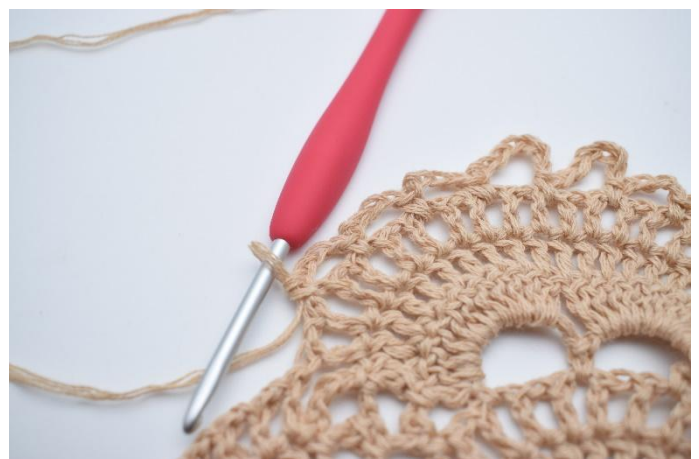
27. "Ch 4, skip 1 ch space, sc 1 in next ch space". Repeat from " to " a total of 3 times so you have 3 small ch-gaps.