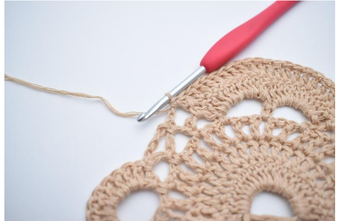
8. Like this.