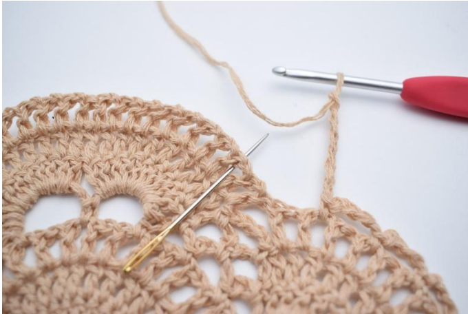
22. Chain 7 and skip 2 ch spaces. Sc 1 in next ch space. The needle marks where to sc 1.