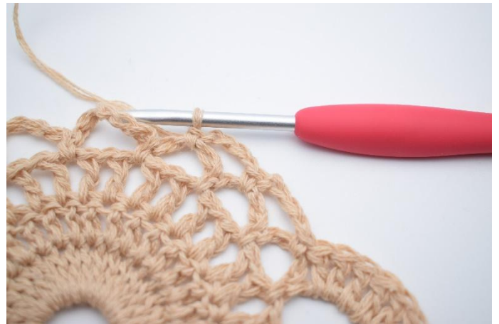
6. Ch 4, sc 1 in next ch-gap.