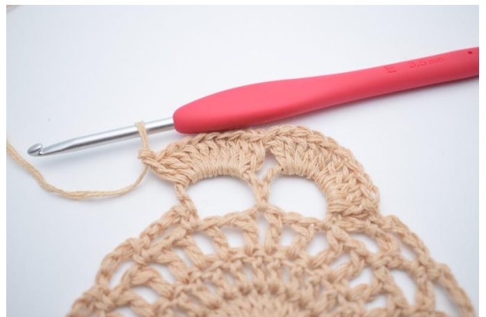
8. Dc 10 into the large ch-gap next to it.