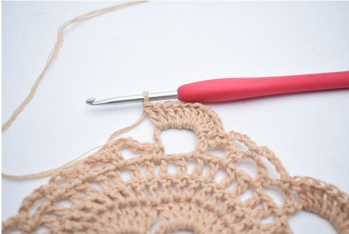
39. Dc 10 into the next large ch-gap.