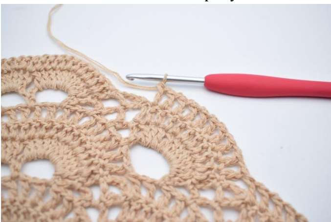
50. "Ch 1, dc 1" in all dc of the large ch-gap (10 dc).