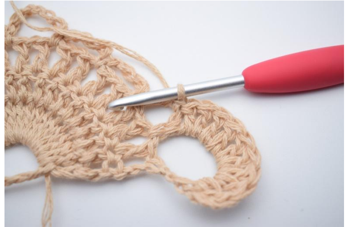
4. Like this.