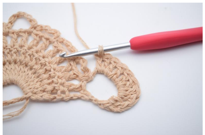
2. Dc 9 into the large ch-gap.