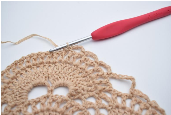
24. "Ch 4, skip 1 ch space, sc 1 in next ch space". Repeat from " to " a total of 3 times so you have 3 small ch-gaps.