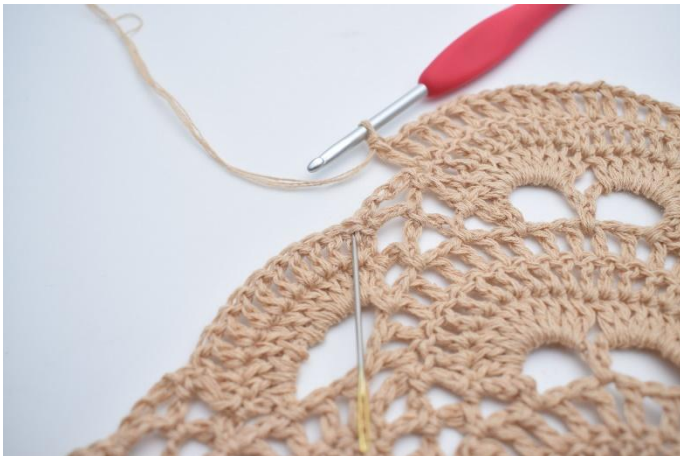
54. Skip the small ch-gap and dc 1 into the first dc of the next large ch-gap. The needle marks where to put your next dc.