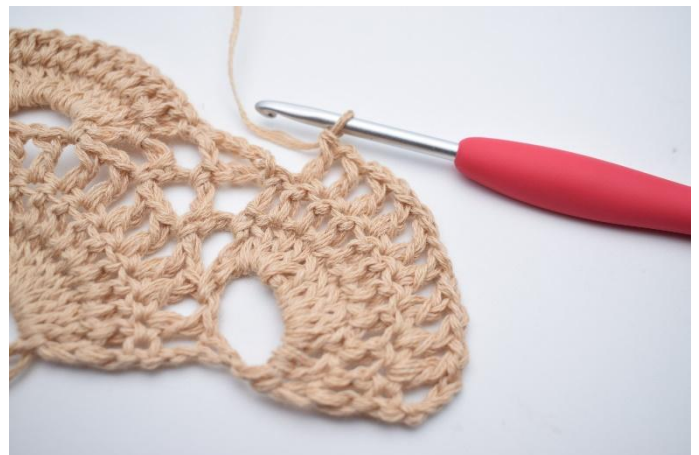
2. Dc 1 in next st. "Ch 1, dc 1" in all dc of the large ch-gap (10 dc).