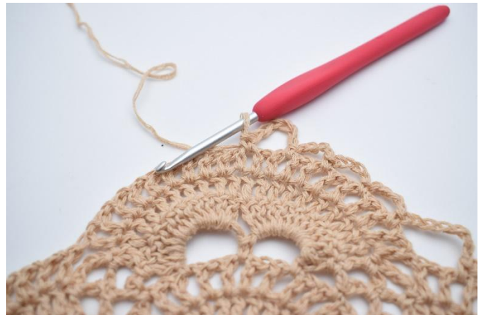
25. Ch 7, skip 1 ch space and sc 1 in next ch space.