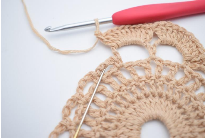
9. Sc 1 in next ch-gap. The needle marks where to sc 1.