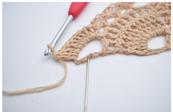
44. Dc 10 into the last large ch-gap. The needle marks where to put your last dc.