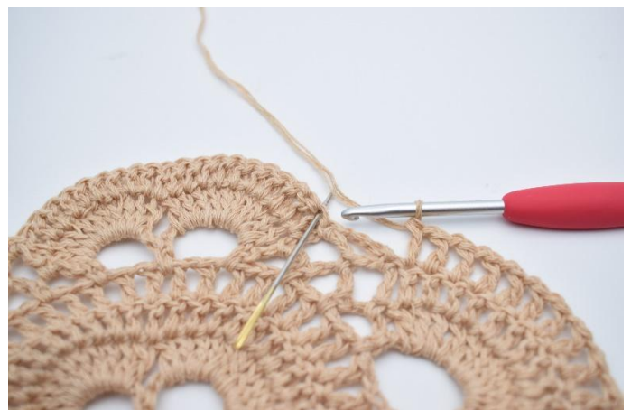
51. Skip the small ch-gap and dc 1 into the first dc of the next large ch-gap. The needle marks where to put your next dc.