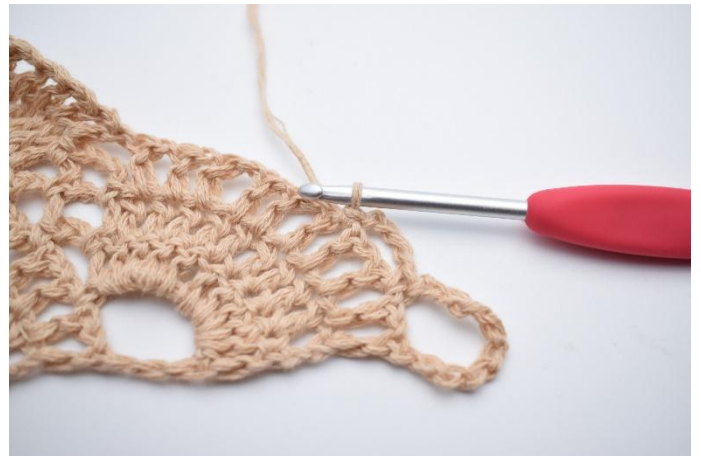
19. Ch 4, skip 1 ch space, sc 1 in next ch space.