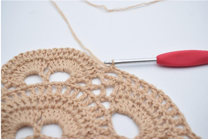
52. Like this.