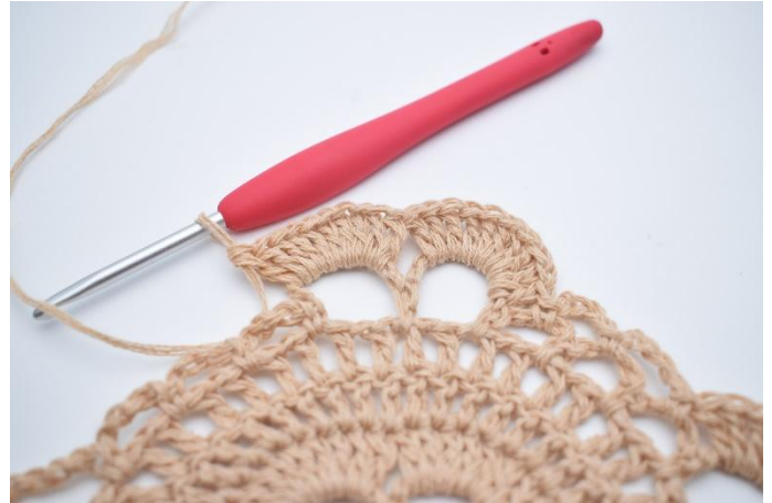
40. Dc 10 into the large ch-gap next to it. Sc 1 in next ch-gap.