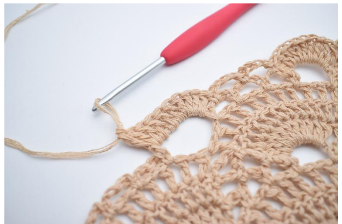
42. Dc 10 into the large ch-gap. Sc 1 in next ch-gap.