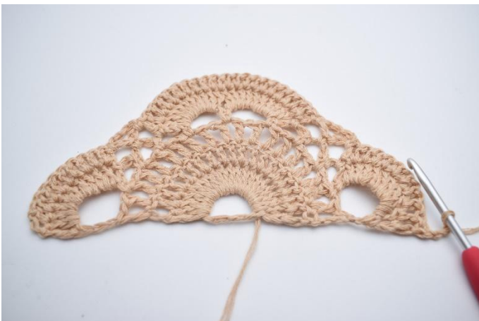
1. Ch 4 and turn (counts as dc 1 and ch 1).