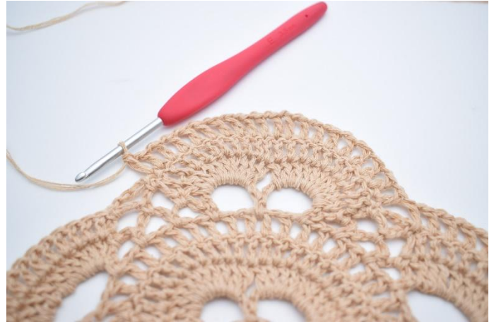
53. "Ch 1, dc 1" in all dc of the 2 large ch-gaps (20 dc).