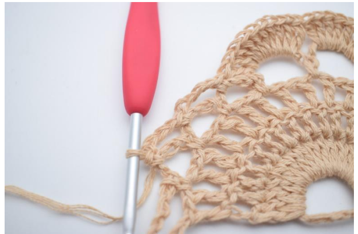
12. Ch 4 and sc 1 in next ch-gap.