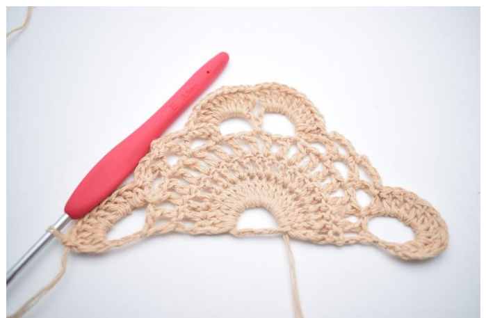
14. Like this.