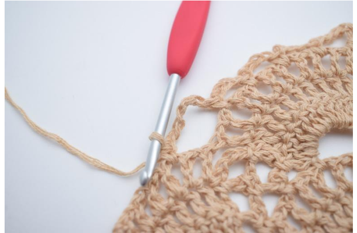
29. Like this.