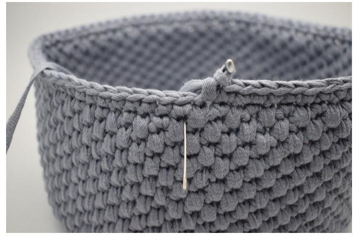
23. Work 1 round of lsc. The needle marks where your lsc should be working