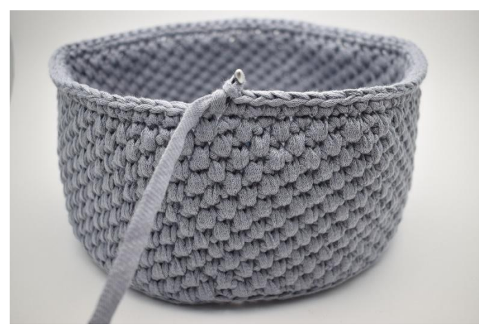
22. Work 1 round of sc