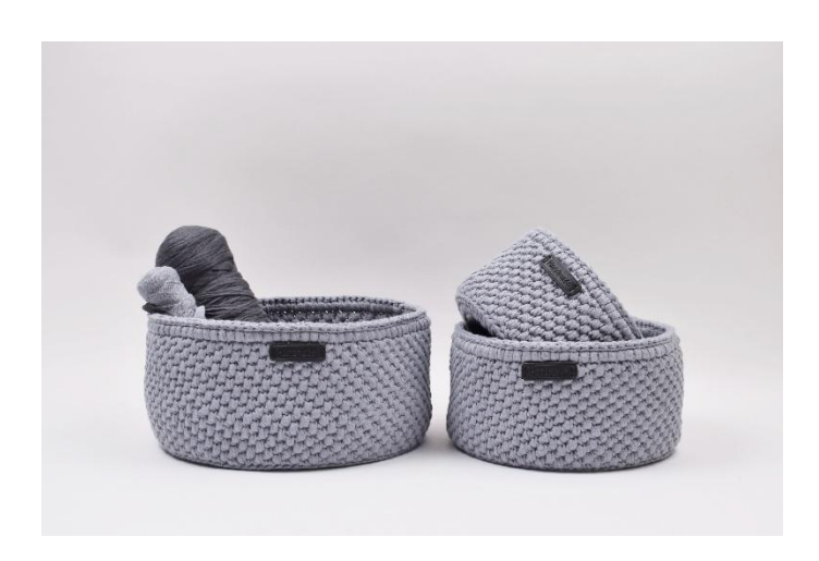
Happy crocheting :-) Love Hobbii.com