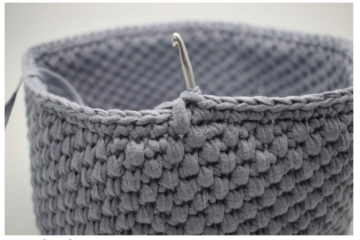
24. Like this.