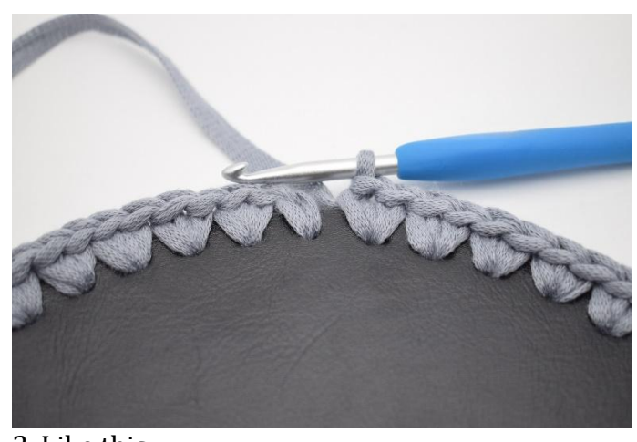
2. Like this.