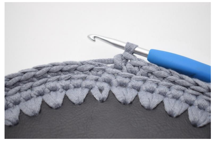
6. Repeat the round with sc in blo.