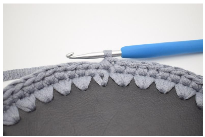
3. Work 1 round of sc in each st all the way around.