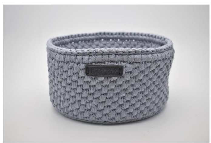
27. Sew the "Handmade" label onto the basket with needle and sewing thread.