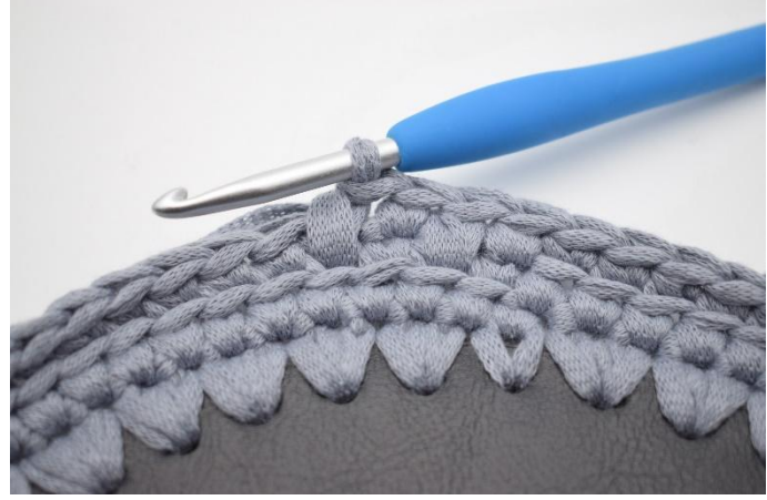
12. Like this.