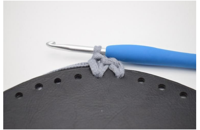
1. Work sc all the way around the leather base as described in the pattern.