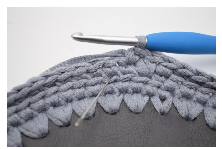
11. Work 1 sc in the next st. The needle marks where your lsc should be worked.