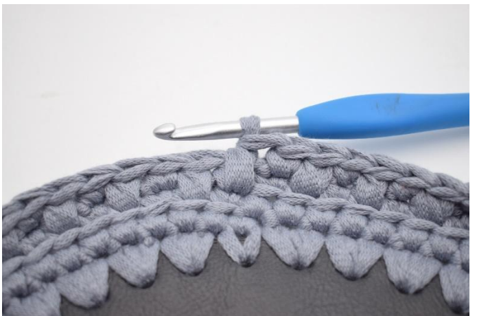
15. Like this.