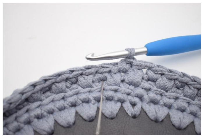
17. Work 1 lsc in the next stitch. The needle marks where your lsc should be worked.