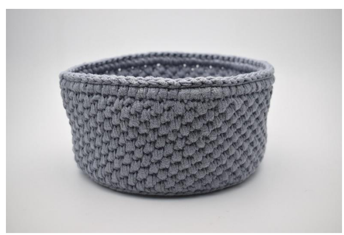
26. Work 1 round of ss. Cut the yarn and weave in ends.