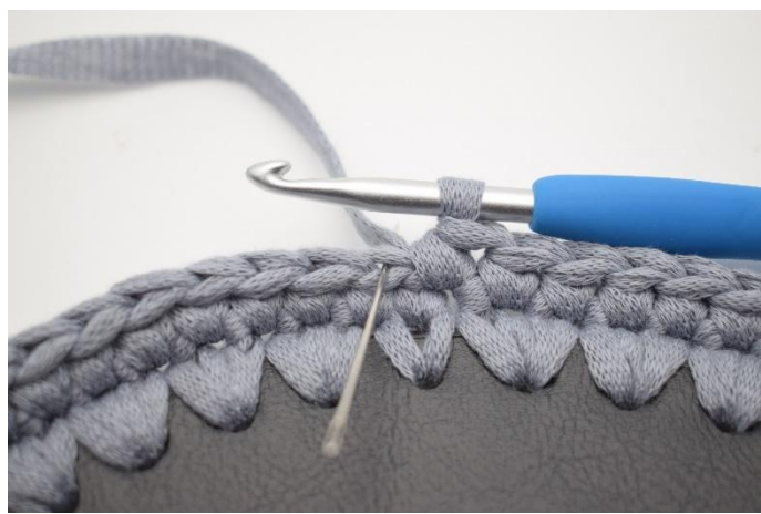
4. Now, work sc in blo. The needle marks where your sc should be worked.