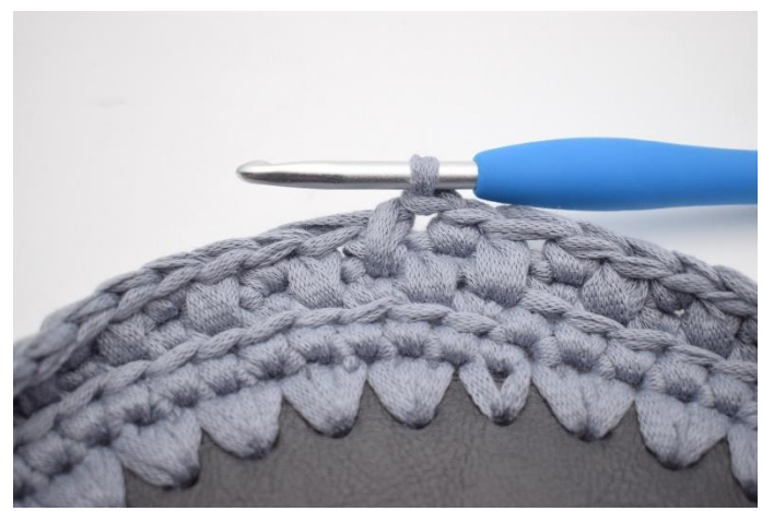
18. Like this.