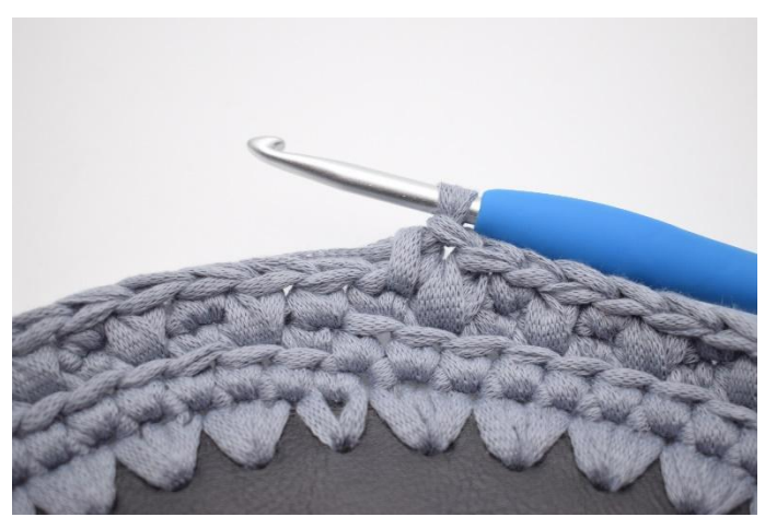
13. Repeat the round of sc and lsc . Finish the round with 1 sc.