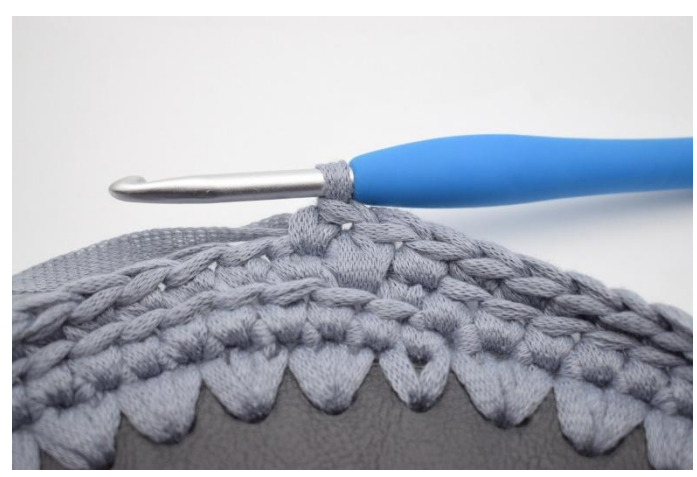
10. Work 1 sc in the next st.