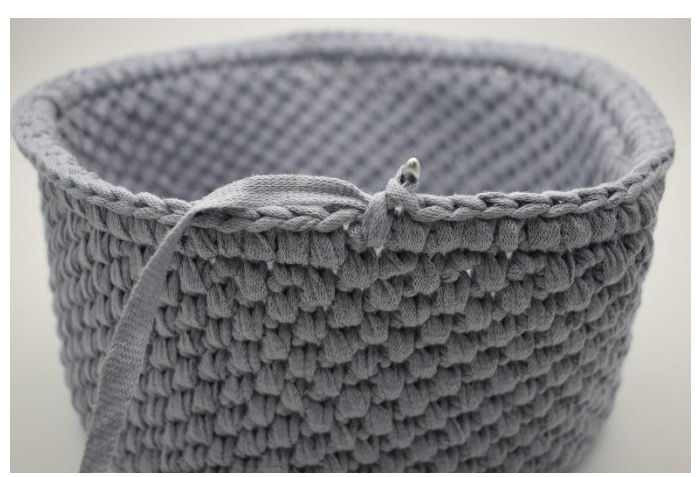
25. Repeat the entire round.