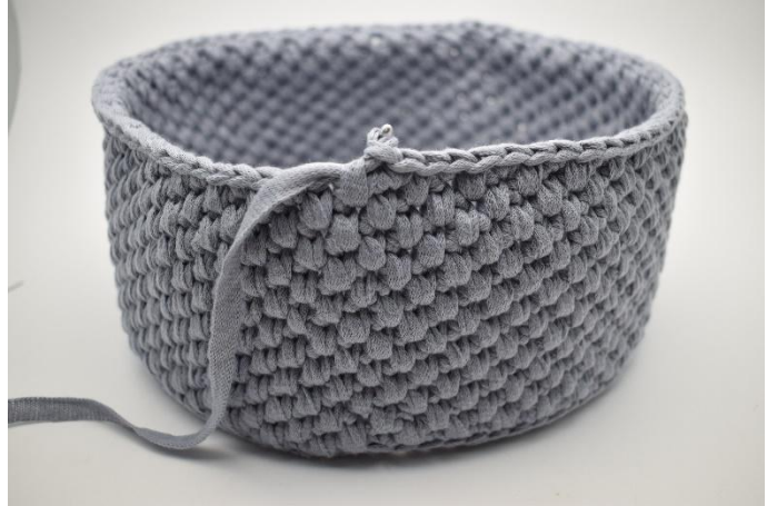
21. Repeat these instructions as described in the pattern