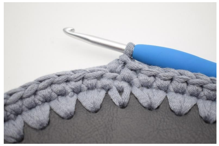
5 Like this.