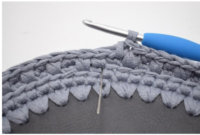
14. Now, alternate between lsc and sc. Work lsc in the next st. The needle marks where your lsc should be worked.