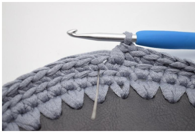
8. Work 1 lsc in the next st. The needle marks where your lsc should be worked.