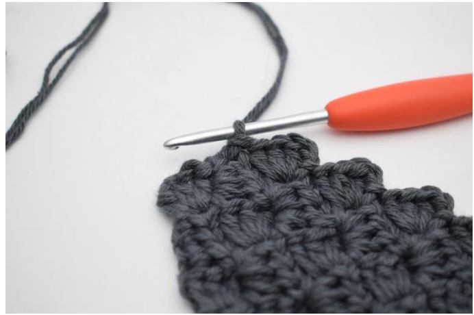
Repeat the dec on each row until you have 1 "square" left on your row. Turn and work sl st along the side of this "square". Cut the yarn and weave in ends.