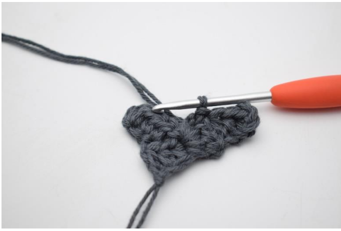
Ch 2 (= replaces 1 hdc) and 3 hdc in the same "hole" which was made with sl st and ch 2. Work 1 sl st in left hook on 2^{nd} "square" from previous row. You have now worked one more "square" and you have 2 "squares" on your row.