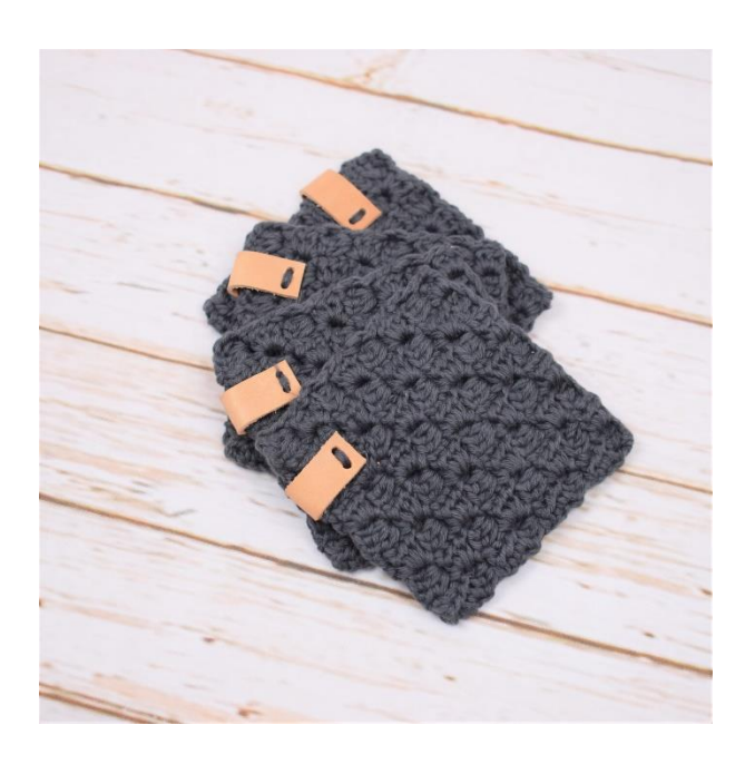
Enjoy © Love from Hobbii.com