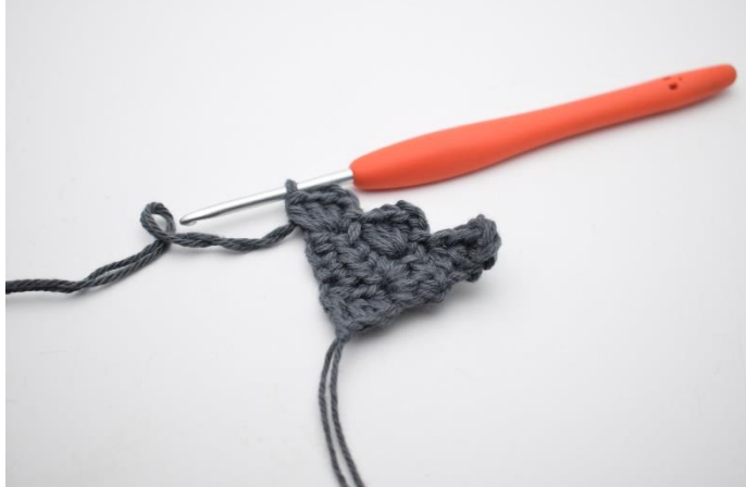
Repeat the rows and inc in each row until you have 8 squares.