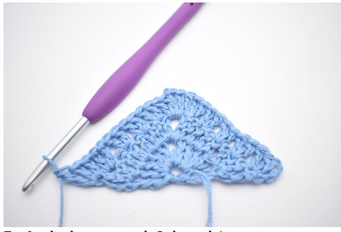
7. In the last st, work 2 dc and 1 tr.