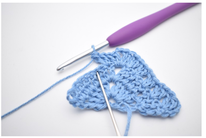
5. *2 dc in the next st, skip 1 st*