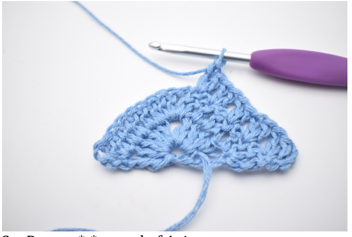
3. Repeat *-* a total of 4 times.