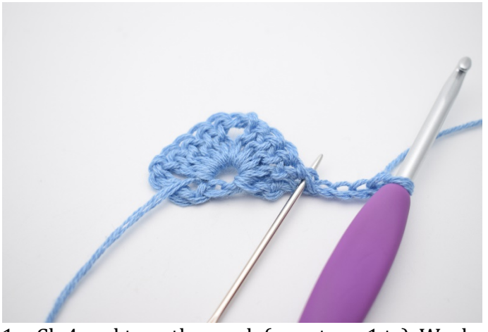
1. Ch 4 and turn the work (counts as 1 tr). Work 2. Like this. 2 dc in the first st where the needle is pointing.