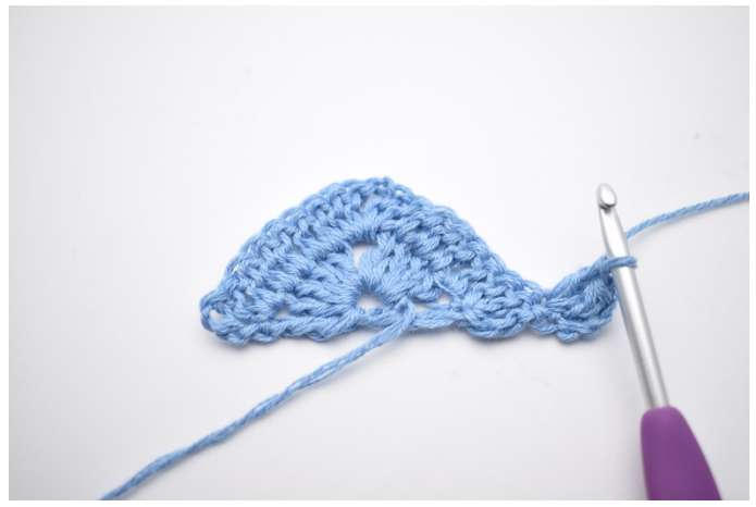
1. Ch 4 and turn the work (counts as 1 tr). Work 2. *skip 1 st, 2 dc in the next st* 2 dc in the first st.