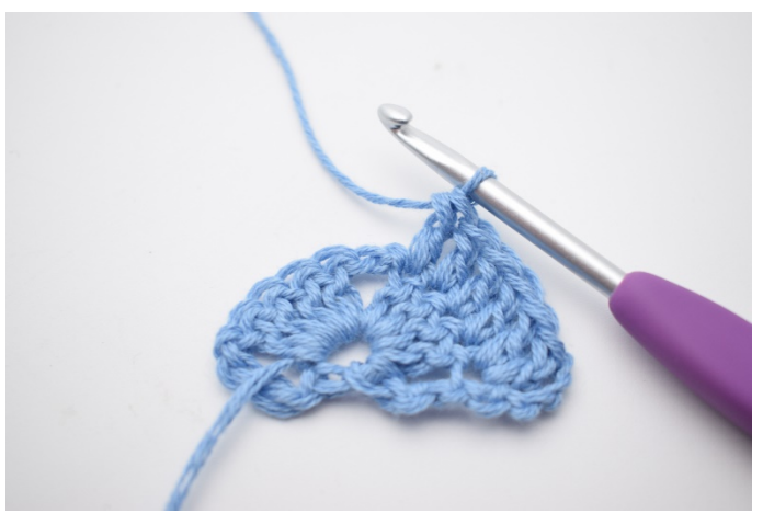
3. Work 1 dc in the next 4 sts.