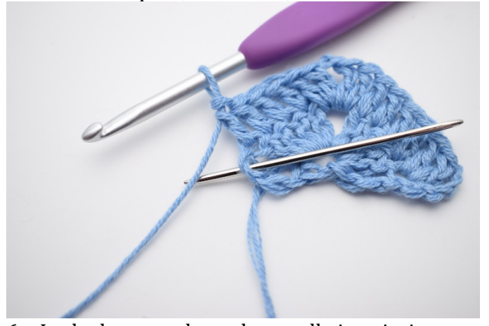
6. In the last st- where the needle is pointing,