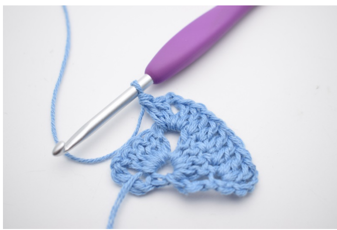
4. In the ch-space, work 2 dc, ch 2, 2 dc.