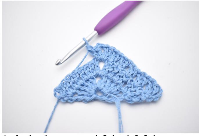
4. In the ch-space, work 2 dc, ch 2, 2 dc.