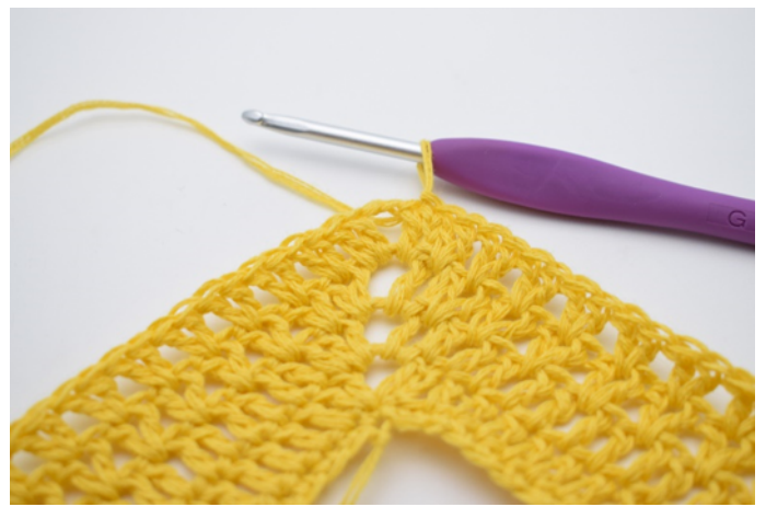
10. Like this.