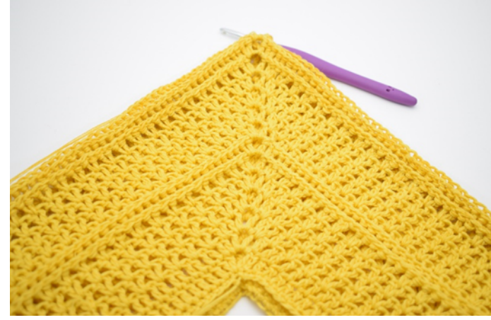
Repeat rounds 4 – 9. Repeat as described in the pattern.