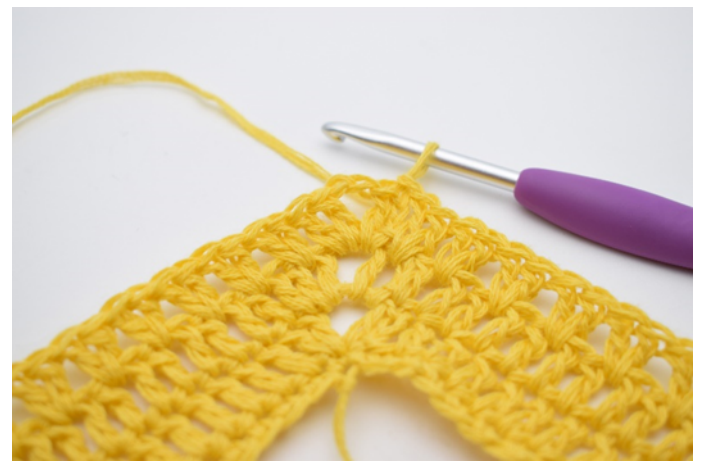
12. Like this.

11. Repeat from " to " a total of 27 (28) 30 (31) times. Finish with 1 sl st into the top of the 3 ch you started the round with.