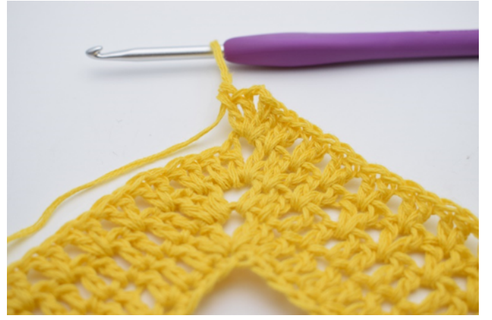
6. Dc 2, ch 2, dc 2 in the ch sp.

5. Repeat from " to " 29 (30) 32 (33) times.