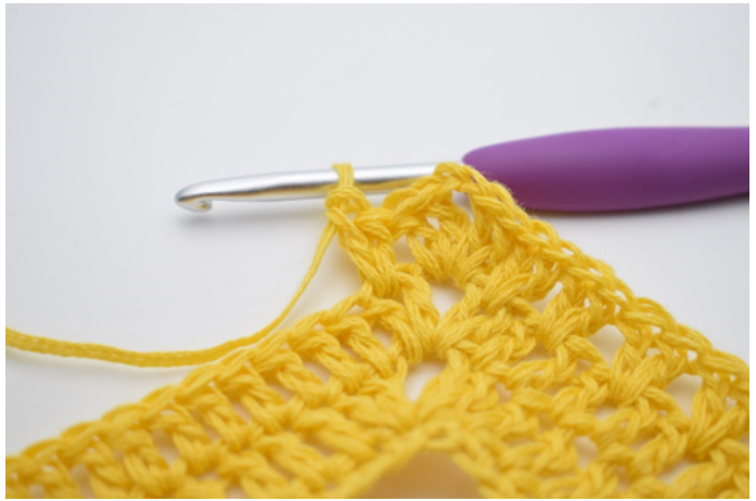
10. Like this.

9. "Dc 2 between the next 2 dc's, miss 1 st".