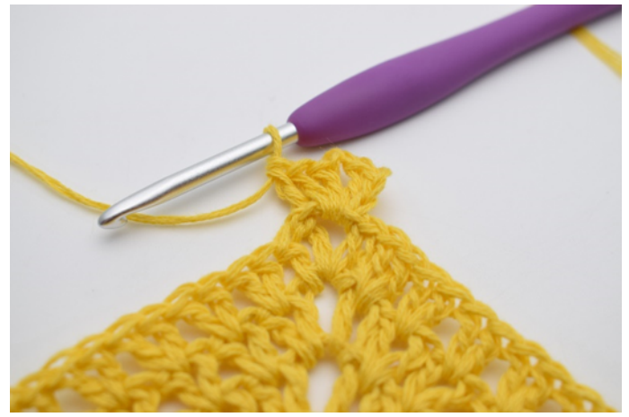
4. Like this.