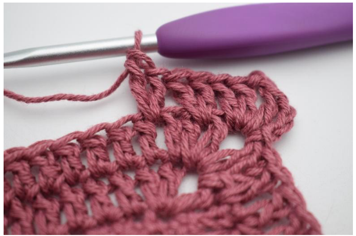
6. Like this.

5. Miss 1 st (2 posts), "Dc 2 between the next 2 dc's, miss 1 st".