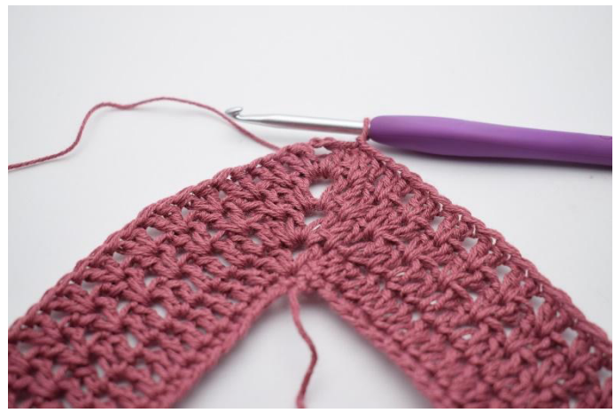
10. Like this.

9. Repeat from " to " 29 (30) 32 (33) times. Finish with 1 sl st into the top of the 3 ch you started the round with.