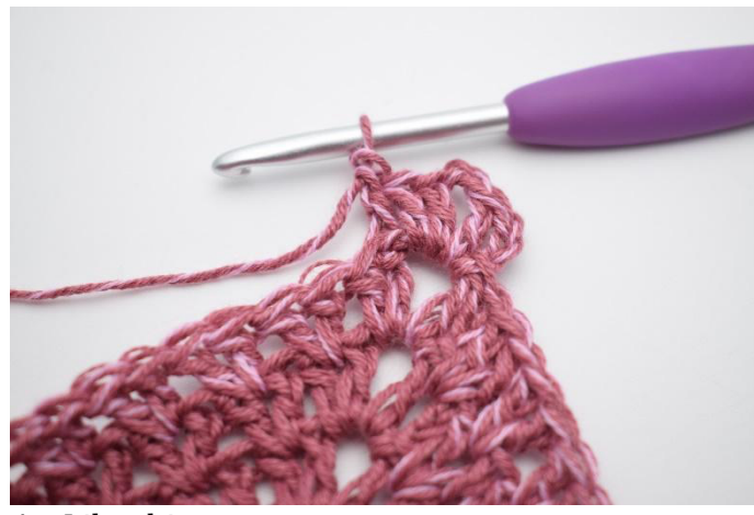
4. Like this.