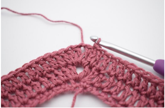
6. Like this.