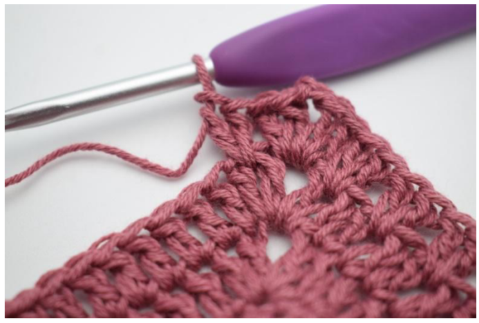
10. Like this.

9. "Dc 2 between the next 2 dc's, miss 1 st".