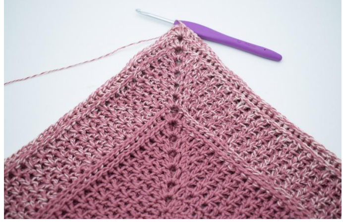
Repeat rounds 4 – 9. Repeat as described in the pattern.