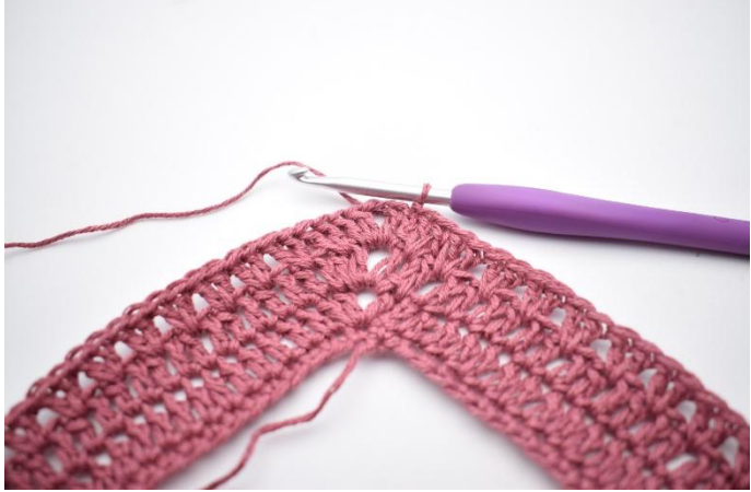
12. Like this.