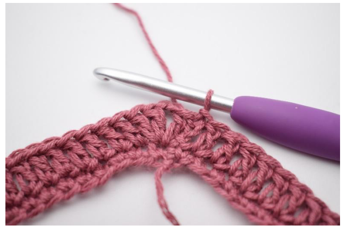
8. Like this.

7. Dc 1 in the last 46 (48) 52 (54) st. Finish with 1 sl st into the top of the 3 ch you started the round with.