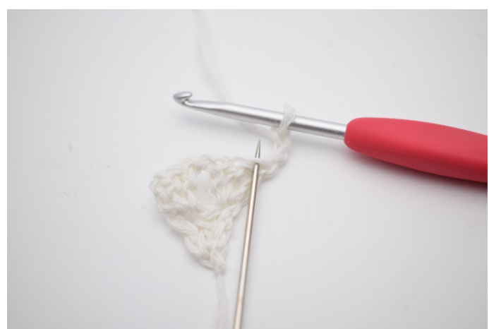
2. In the first st, (where the needle is indicating),