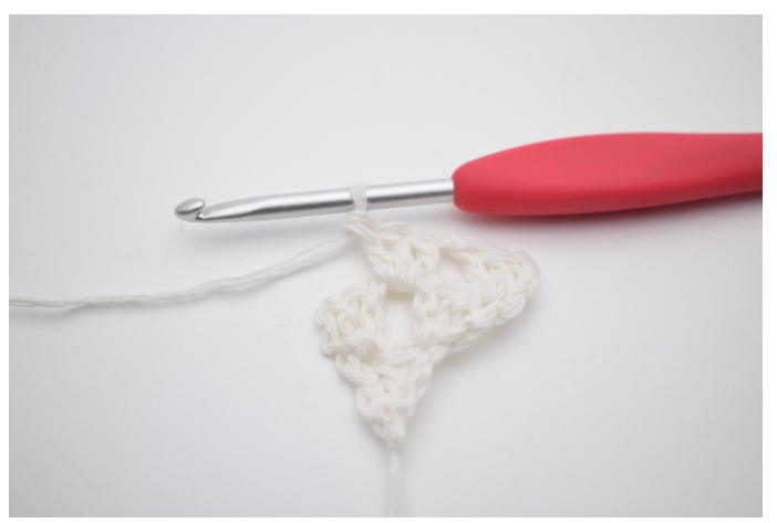
5. Work 1 dc group in the ch-space.