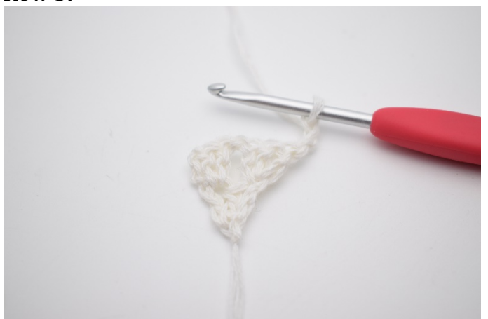
1. Turn work and ch 3 (counts as a dc)