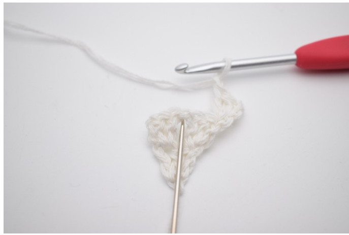
4. Ch 1. Working into the ch-space of the previous row, (where the needle is indicating)