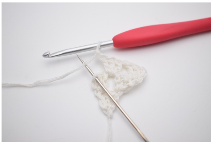
6. Ch 1. In the last st, (where the needle is indicating)