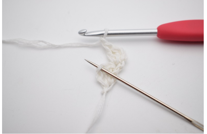
4. Ch 1. In the last st, (where the needle is indicating)

3. work 2 dc. There is now a dc group that consists of 3 dc (the 1st being the ch 3)