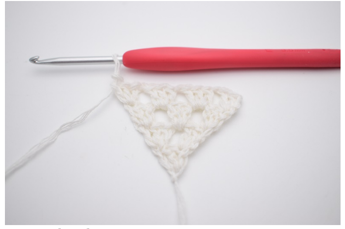
7. Work 1 dc group.