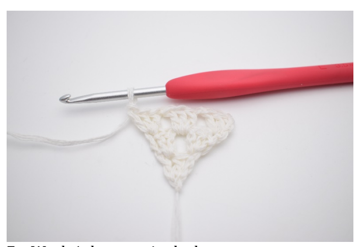
7. Work 1 dc group in the last st.