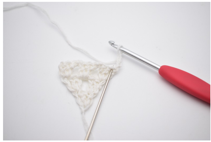
2. In the first st, (where the needle is indicating),