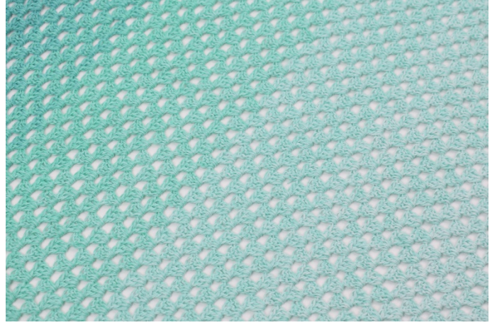
8. Continue in this manner until almost all of the yarn has been used.