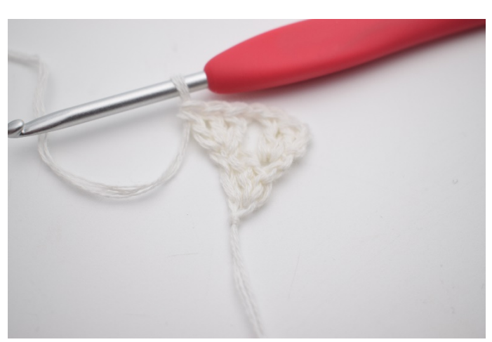
5. work 3 dc (1 dc group)