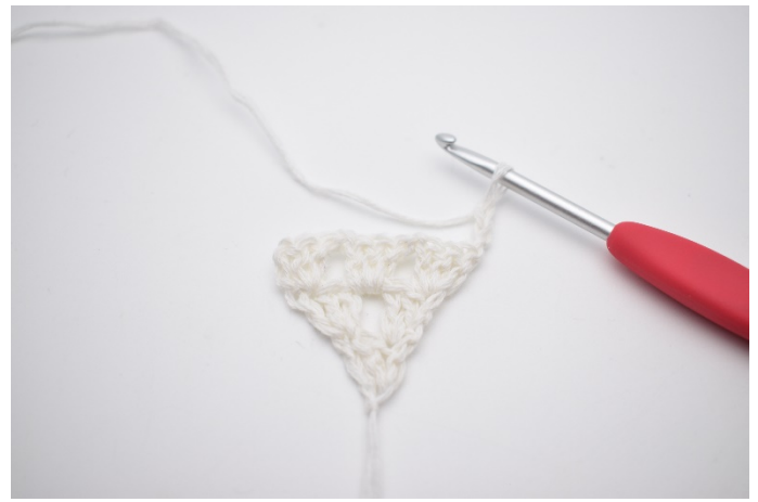
1. Turn work and ch 3 (counts as a dc)