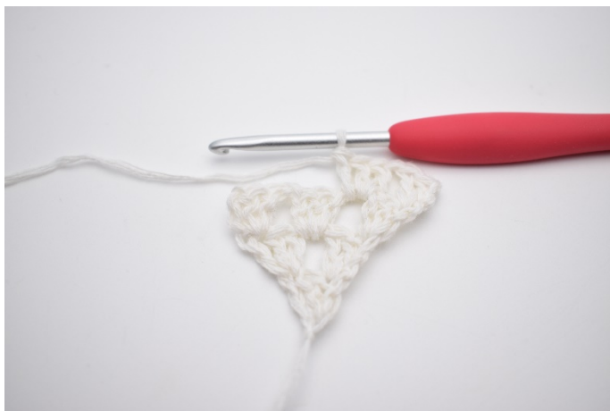
4. Ch 1, in the ch-space from the previous row, work 1 dc group.