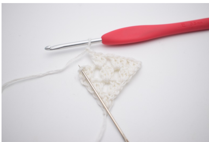
6. Ch 1. Ch 1. In the last st, (where the needle is indicating).