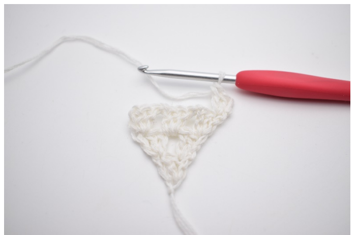
3. work 2 dc. There is now a dc group that consists of 3 dc (the 1st being the ch 3).