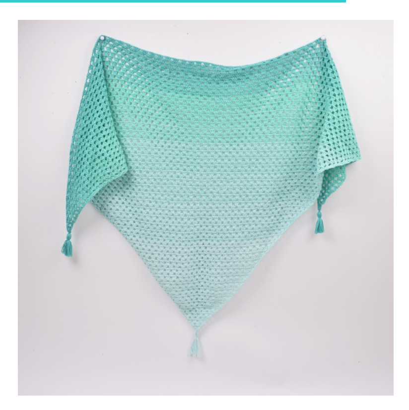
Enjoy! © Best Wishes, Hobbii.com