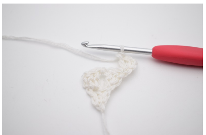
3. work 2 dc. There is now a dc group that consists of 3 dc (the 1st being the ch 3).