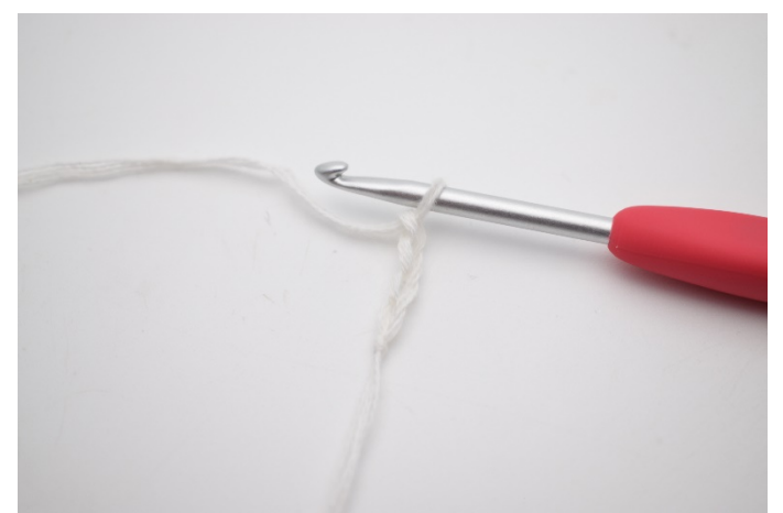
1. Start with a Ch 4.