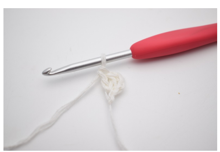
3. work 2 dc. There is now a dc group that consists of 3 dc (the 1st being the ch 3)