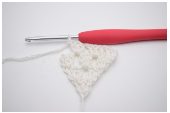
5. Ch 1, and in the next ch-space, work 1 dc group.