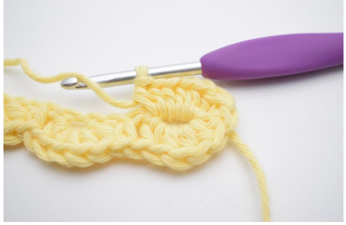
15. Like so.