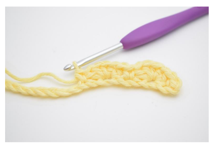
11. Make 1 sc in the next st."