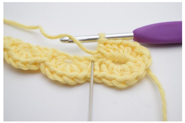
16. Skip 1 st and make 1 sc in the next st (same st that has 1 sc on the other side). *