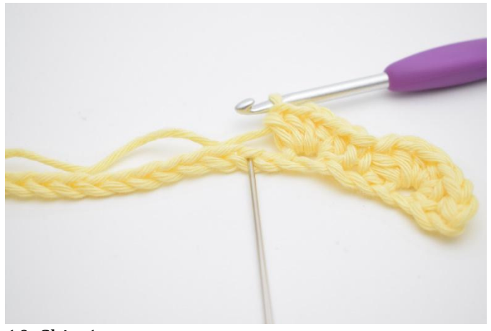
10. Skip 1 st