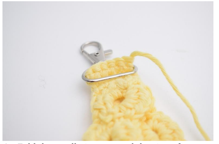
4. Fold the small piece around the ring of your carabiner and sew it closed.