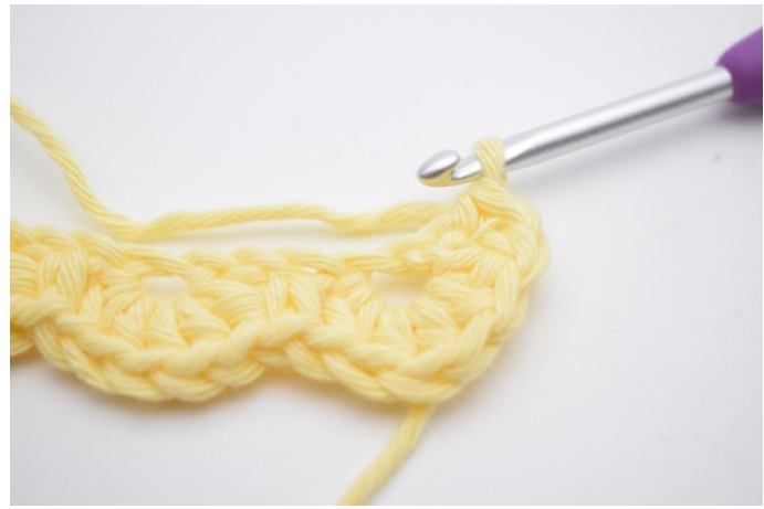
13. Now, work on the other side of the starting chain. Make 1 sc in the same st as the last of the other side.