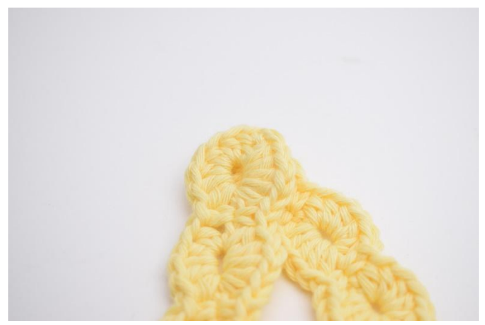
1. Place the ends on top of each other like shown 2. Crochet them together with 5 sc. in the picture