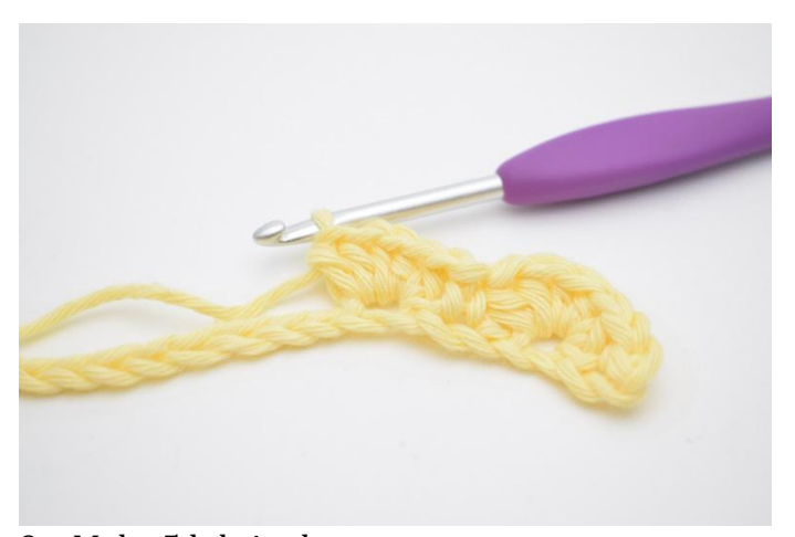
9. Make 5 hdc in the next st.