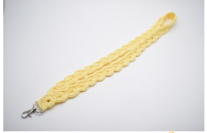
5. Cut the yarn and weave in ends.