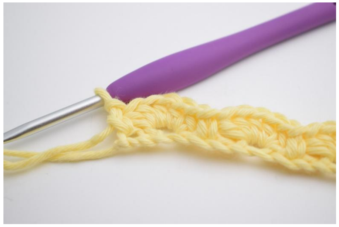
12. Repeat between ** until end of the row. You now have 37 scallops.