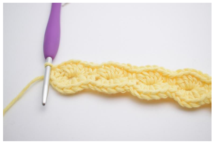
18. Repeat between ** until end of row. End with a sl st. Cut the yarn and weave in the ends