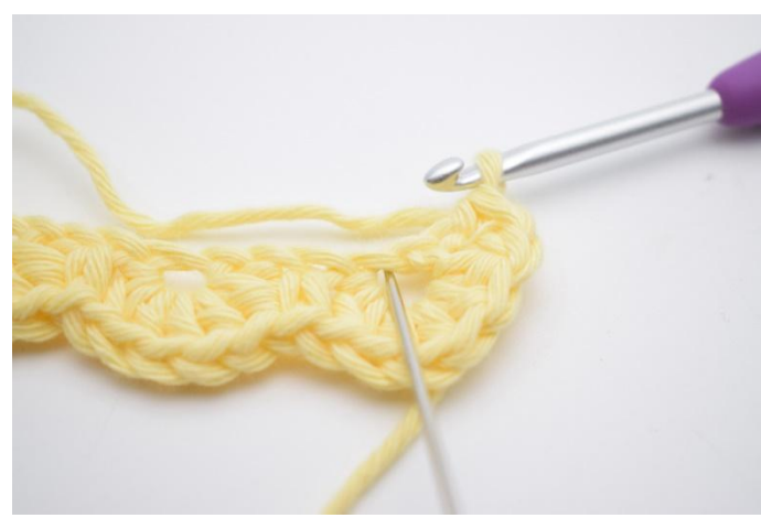
14. * Skip one st, then 5 hdc in the next st (same st that has 5 hdc on the other side)