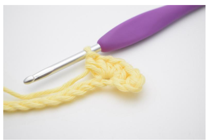
5. Make 5 hdc in the next st.