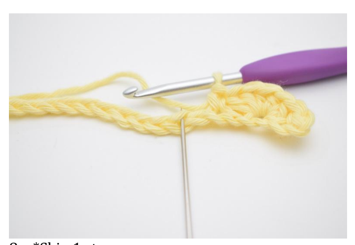
8. *Skip 1 st,