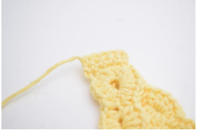
3. Turn and ch 1. Make 5 sc (5). Repeat this once more. Cut the yarn and leave a long tail end for finishing.