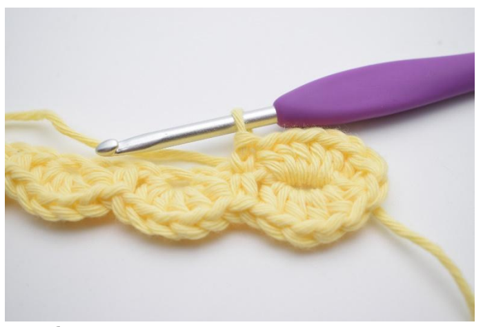
17. Like so.