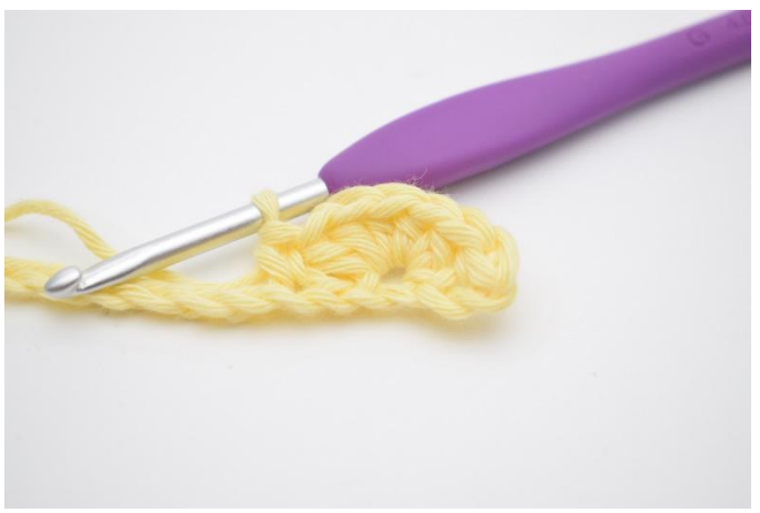
7. Make 1 sc.