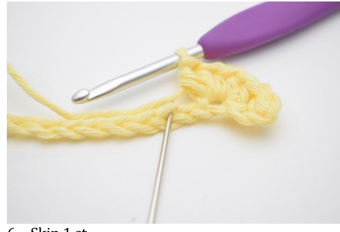
6. Skip 1 st,