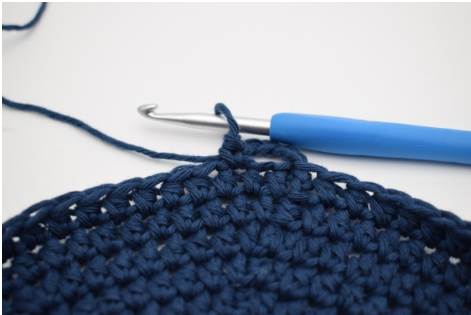
3. Skip 1 st and crochet 1 sc in the next st.