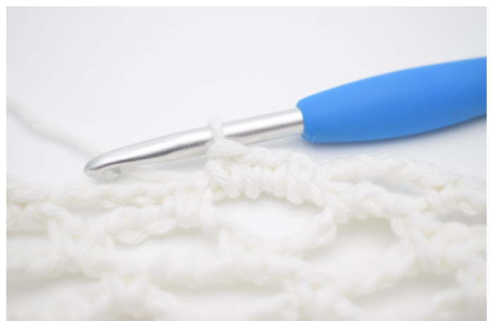
2. Like this.