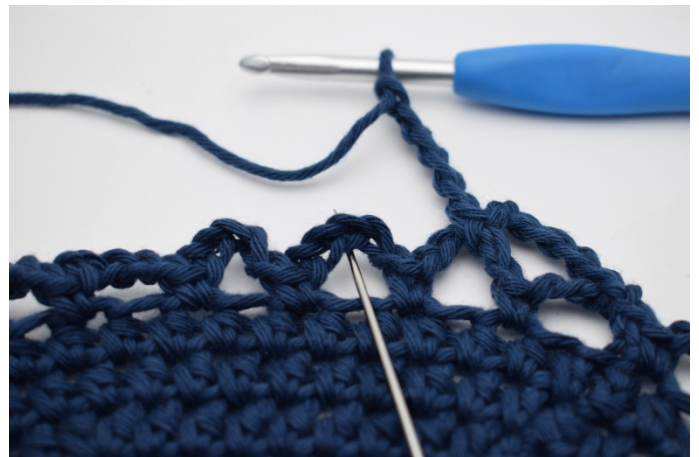
12. In the next ch- space. (The needle marks it here).