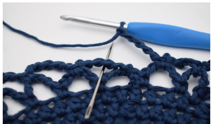
14. Repeat like this on the entire round. Finish the round with 1 sc in the first ch-space, which was made on this round.