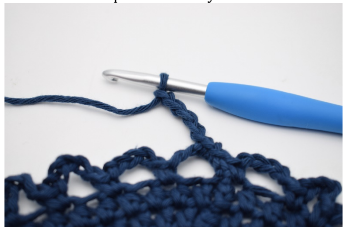
8. Ch 5.