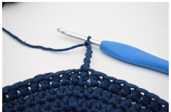
2. Ch 5.