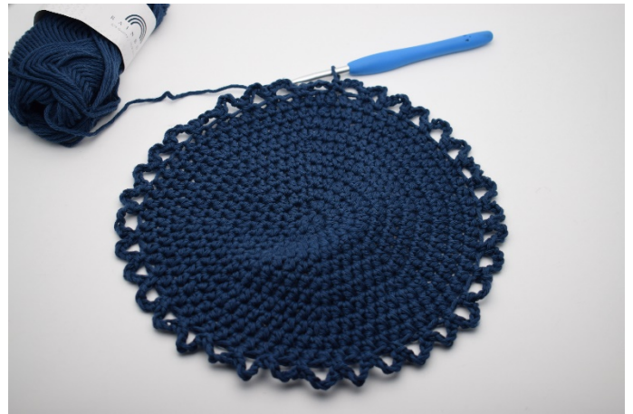
6. Repeat like this on the entire round, so you have 36 ch-spaces around your bottom.