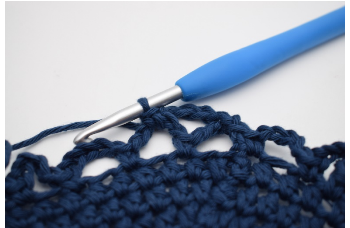
10. Crochet 1 sc.