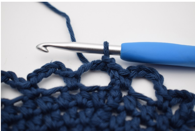
7. Crochet 3 sl st around the first ch-space, so you can begin in the middle of it.