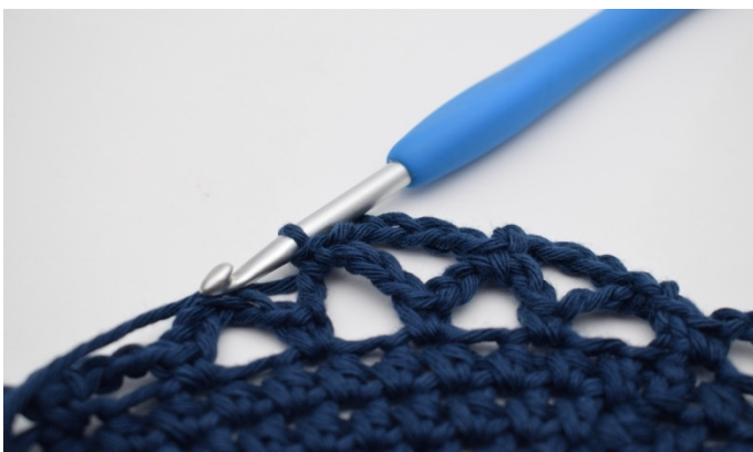
13. Crochet 1 sc.