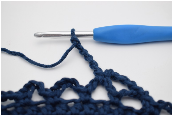
11. Ch 5.