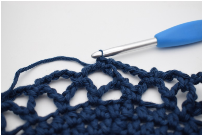
15. Now repeat the rounds and change color as described in the pattern.