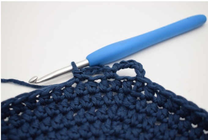
5. Skip 1 st and crochet 1 sc in the next st.