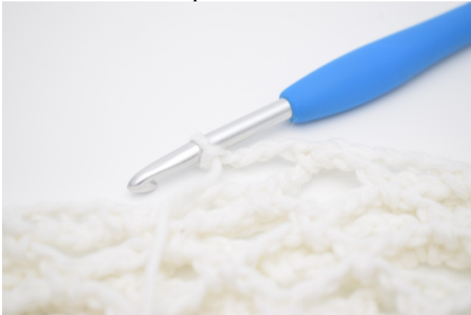
17. Crochet yet another round with color 4. Crochet this round as before, but now only with 4 ch instead of 5 ch.