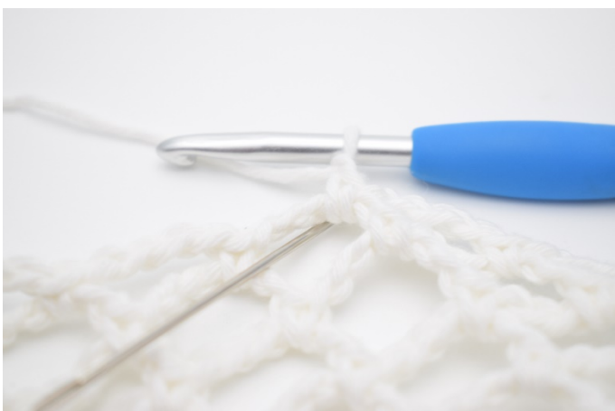
1. Ch 1 and crochet 4 sc in the ch-space.