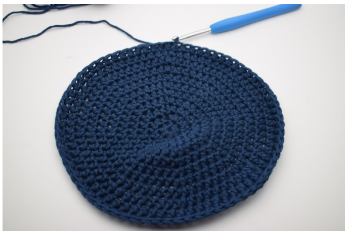
1. The bottom is just finished with 1 sl st.