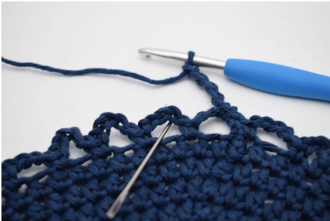
9. In the next ch- space. (The needle marks it here).