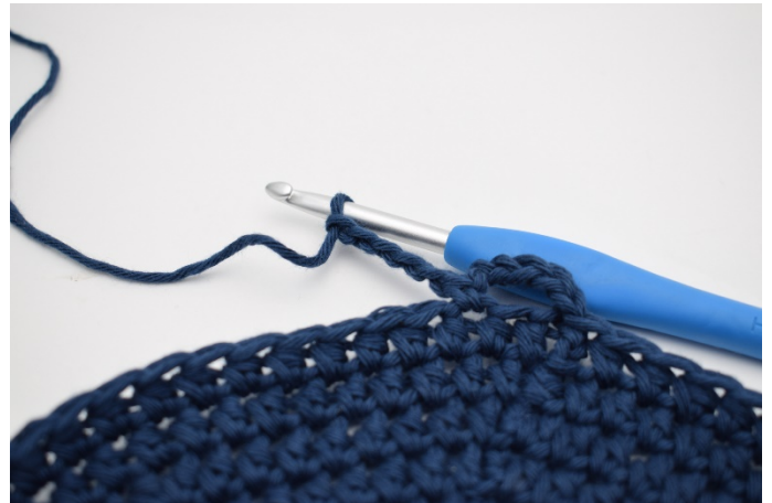
4. Ch 5.