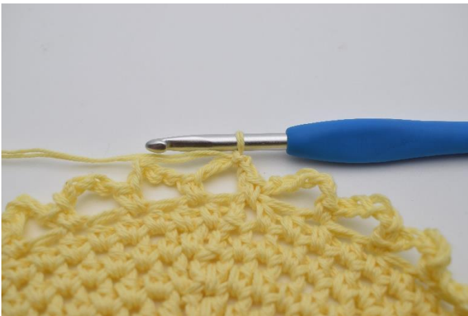
7. Work 3 sl st around first ch-space, so you can start next round in the middle of a ch-space.