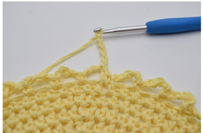
8. Ch 5.