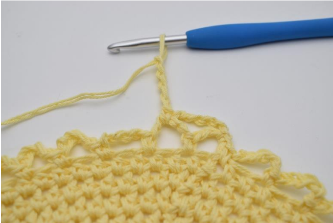
11. Ch 5.