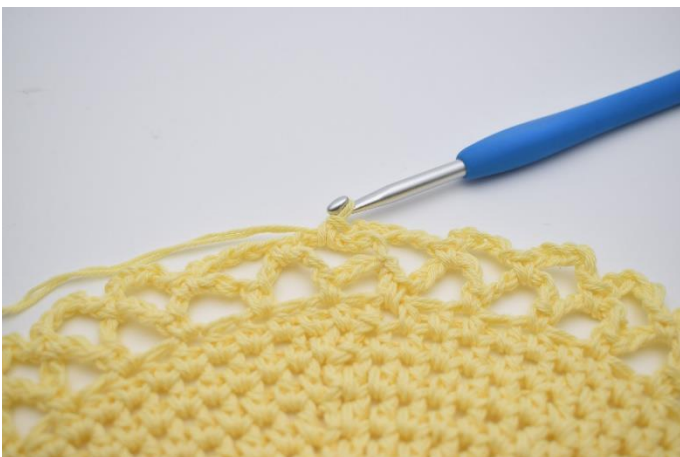
14. Work one more round in the same way. Repeat the rounds mesh pattern and change colors as described above.