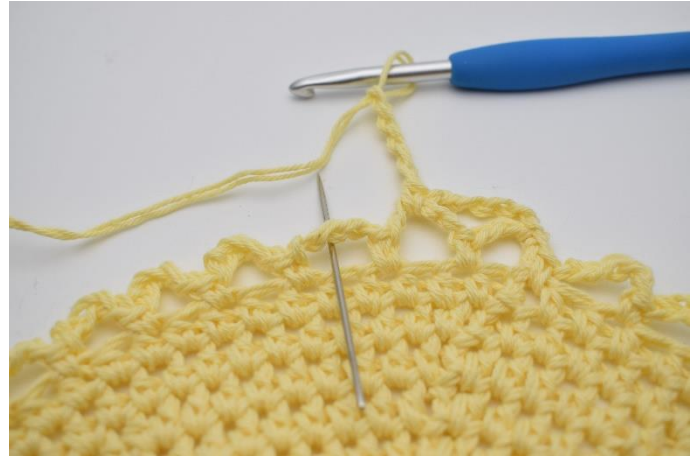
Around next ch-space (The needle on the photo marks it)