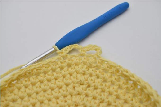
5. Skip 1 st, 1 sc in next st.