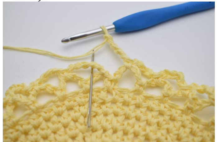
13. Repeat like this on entire round. Finish the round with 1 sc around the first ch-space on the round.