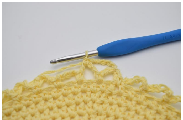
10. You work 1 sc.