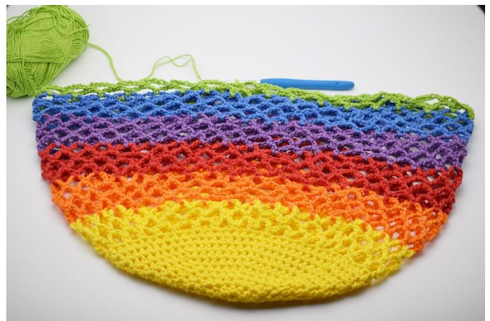
15. Here all 21 rounds are worked.