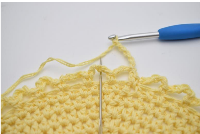
9. Around next ch-space (The needle on the photo marks it)