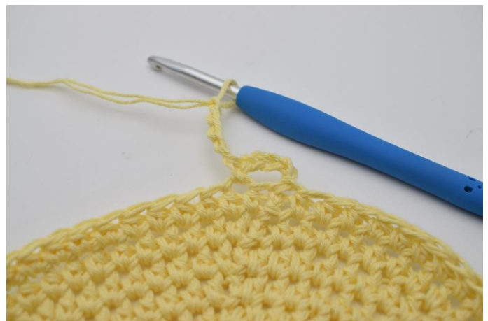
4. Ch 5.