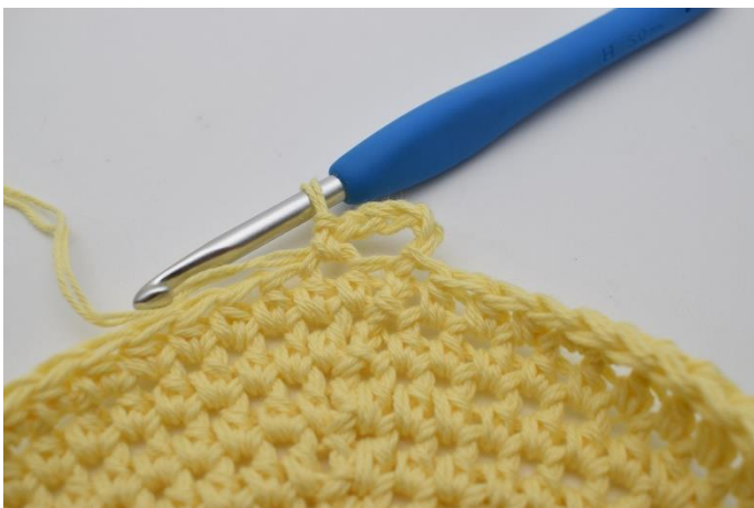
3. Skip 1 st, 1 sc in next st.