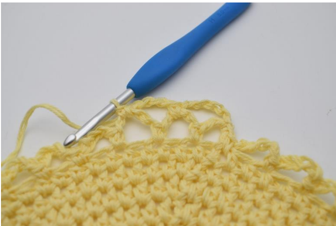
12. You work 1 sc.