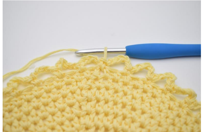
6. Repeat like this on entire round. You now have 36 ch-spaces around your bottom.