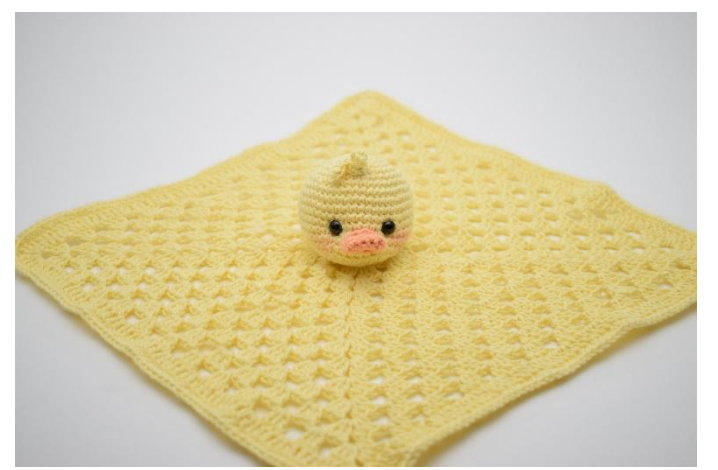
10. Sew the head on in the middle.