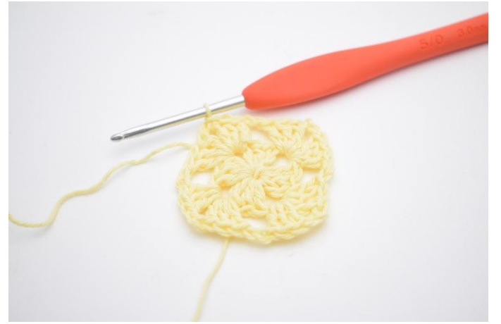
10. Sl st along until you reach the corner (ch gap).

9. Finish with a sl st into the 3rd ch from the beginning of the round.