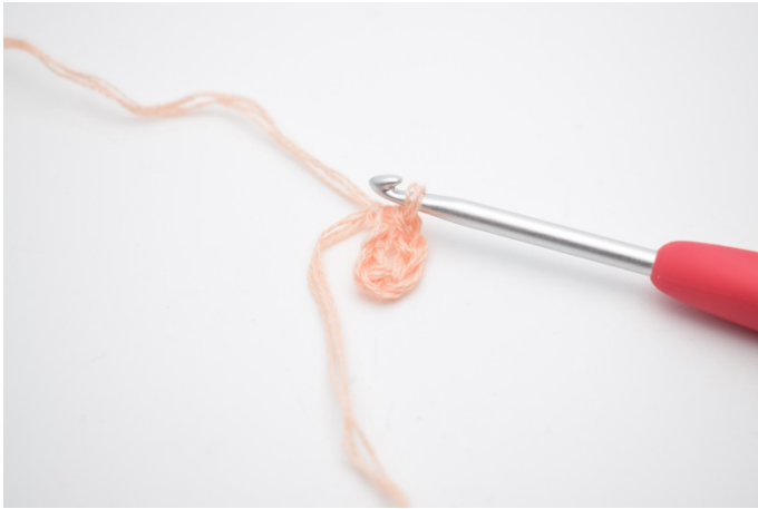
1. Ch 6 and join in a ring with a sl st.