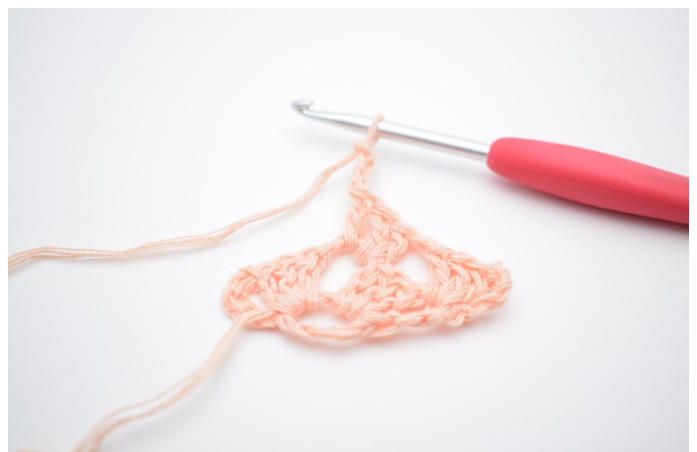
12. Ch 3. Work 1 dc-cluster in the same ch-space as before.