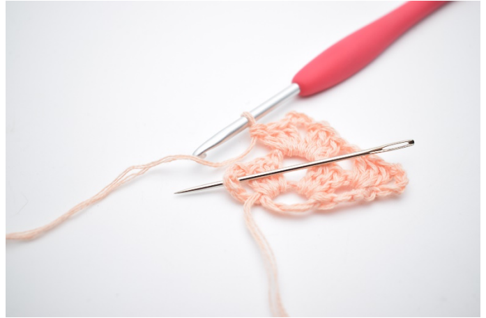
14. Ch 1. Work 1 dc-cluster in the space marked by the needle in the picture.