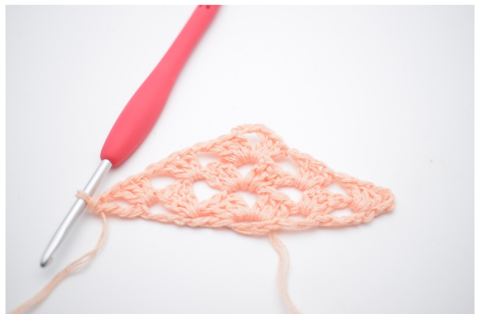
29. Ch 1. Work 1 dc in the 4th ch-st from the turning chain of the previous row.