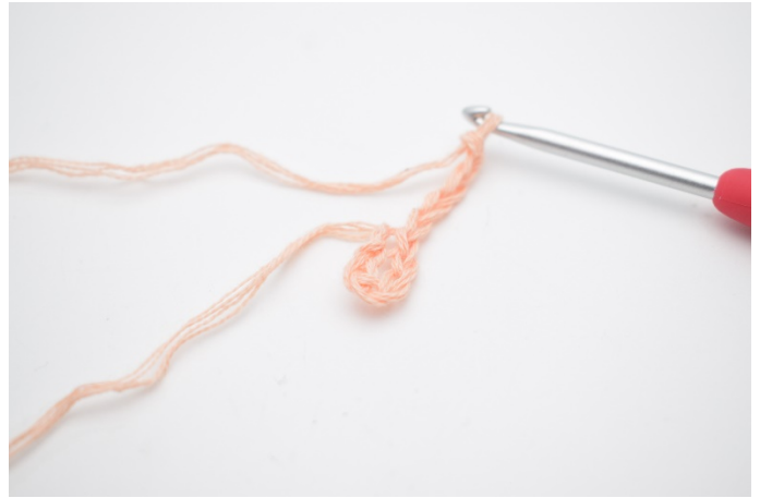
2. Ch 5.