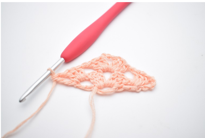
17. Like this.