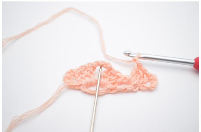
10. Ch 1. Now working in the ch-space from the previous row (this is the point of the shawl):