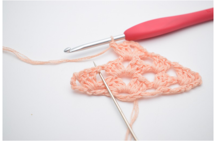
25. Ch 1. Work the next dc-cluster in the space marked by the needle.