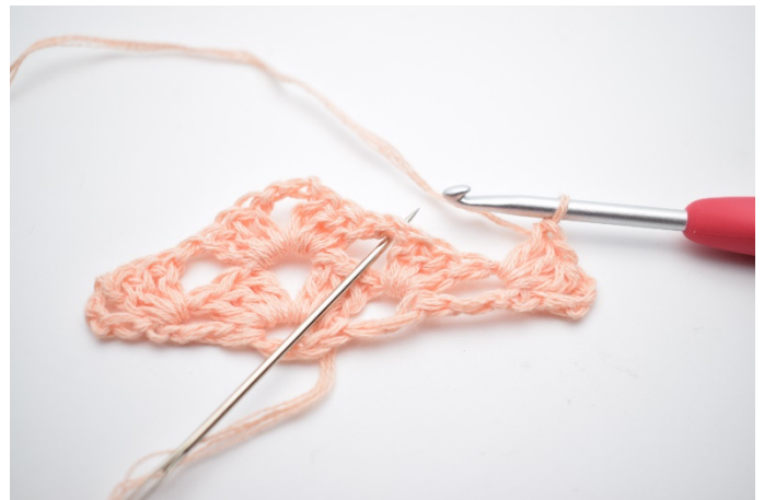
21. Ch 1. Work 1 dc-cluster in the ch-space marked by the needle.