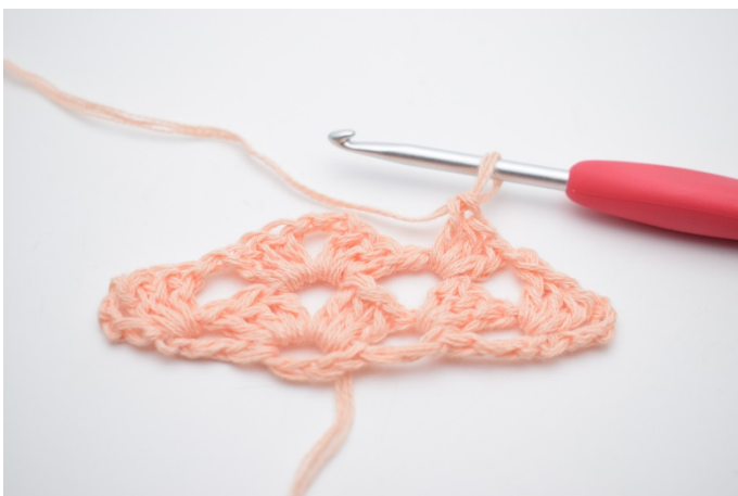
22. Ch 1.