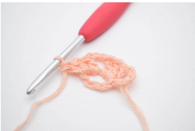
5. Work 3 dc in the ring.