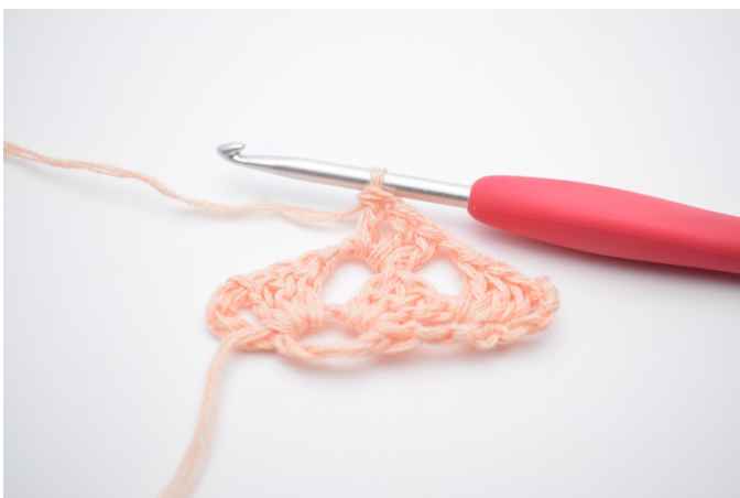
11. Work 1 dc-cluster.