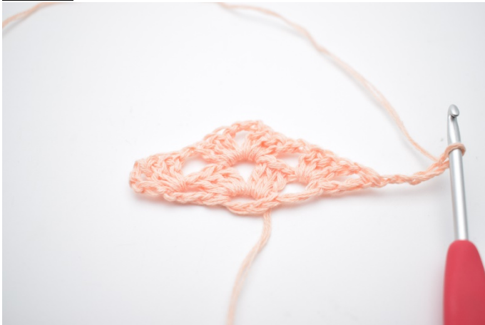
18. Ch 5 and turn