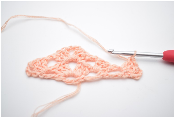
20. Work 1 dc-cluster