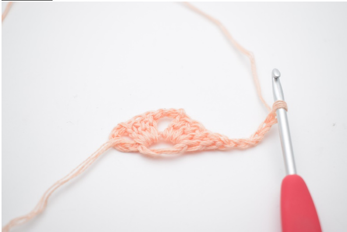
7. Ch 5 and turn the work