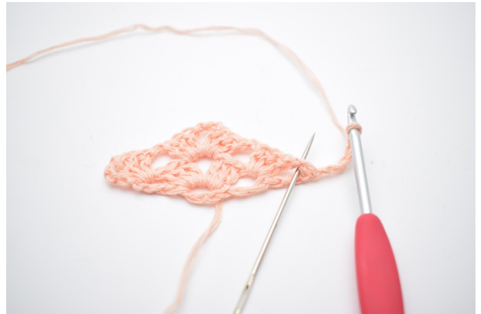
19. In the space marked by the needle in the picture: