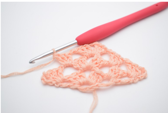
26. Like this.