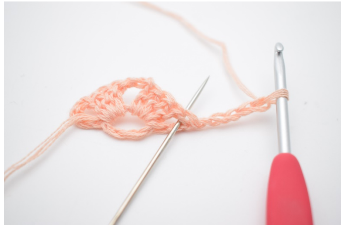
8. In the space marked by the needle in the picture: