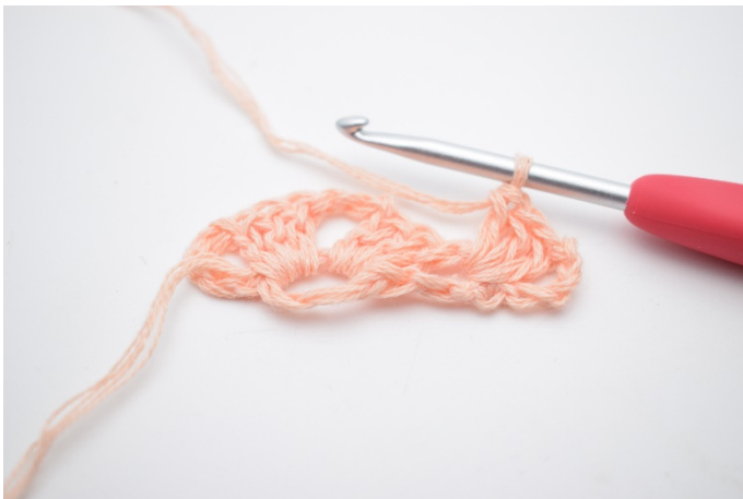
9. Work 1 dc-cluster (3 dc in the same st)