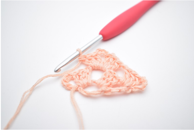
13. Like this.