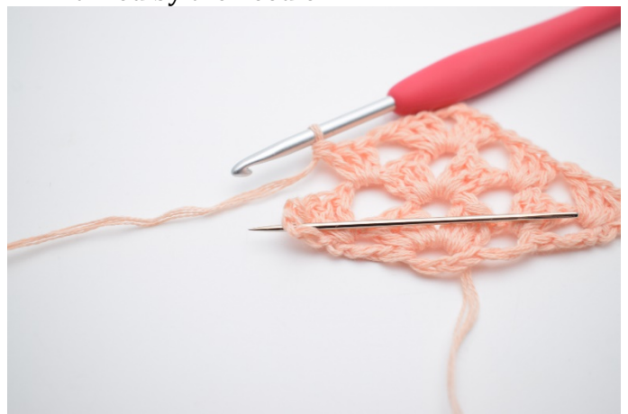
27. Ch 1. Work the next dc-cluster in the space marked by the needle.