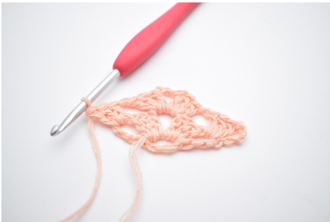
15. Like this.