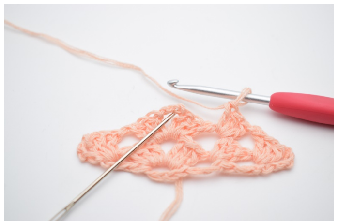
23. Now work in the ch-space that makes the point of the shawl as shown: