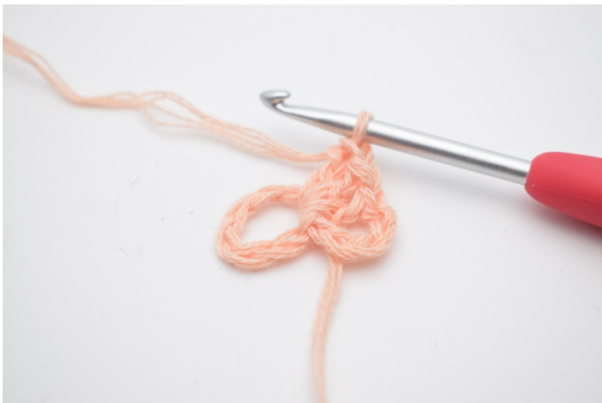
3. Work 3 dc in the ring.