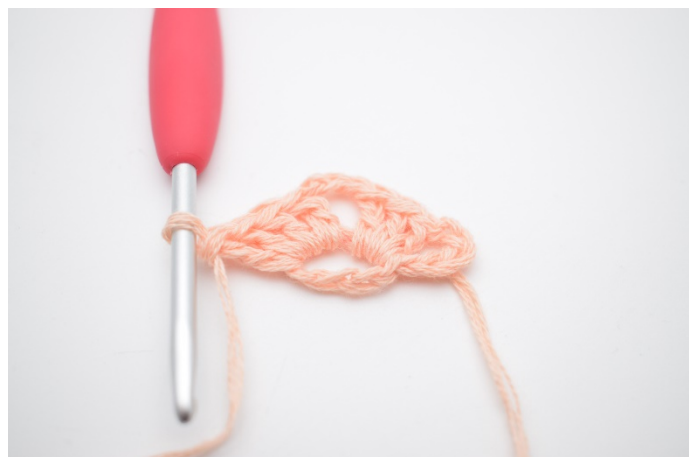
6. Ch 1 and work 1 dc in the ring.