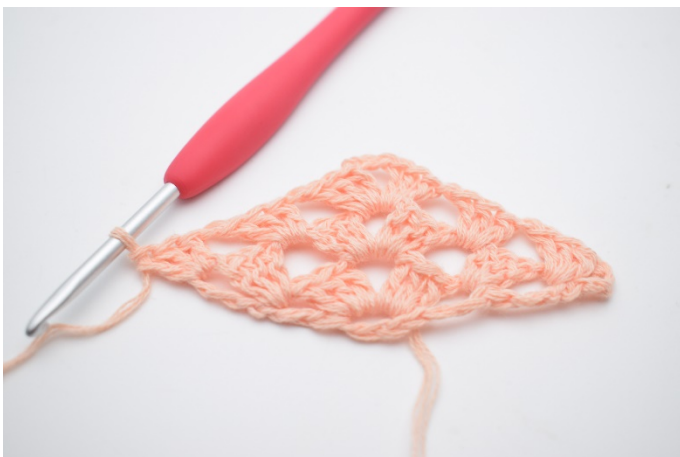
28. Like this.