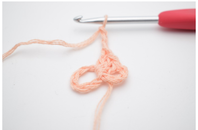
4. Ch 3.