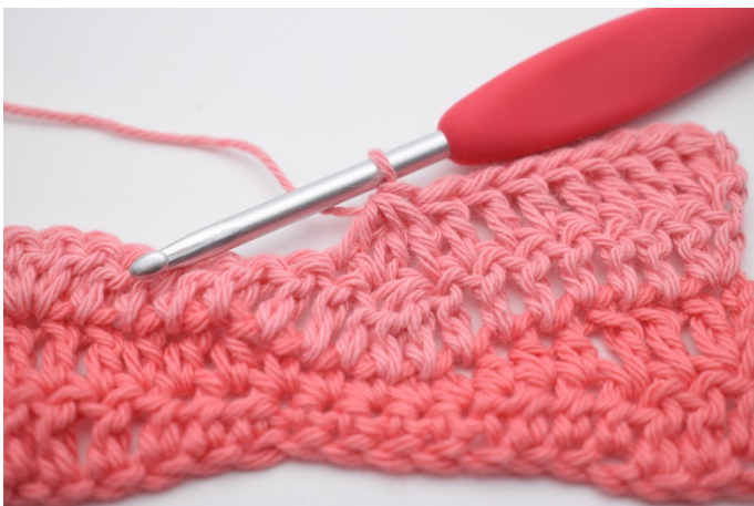
11. Work 3 dc tog.