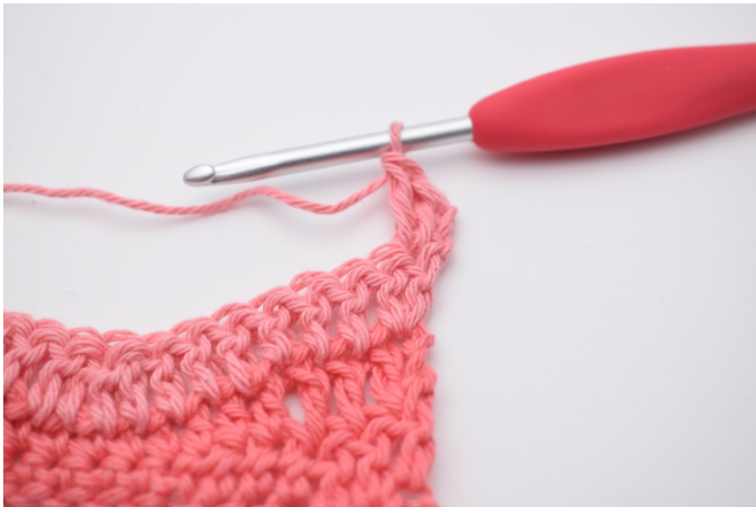
9. Work 2 dc in the first st.