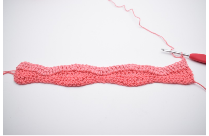
8. Turn with ch 2.