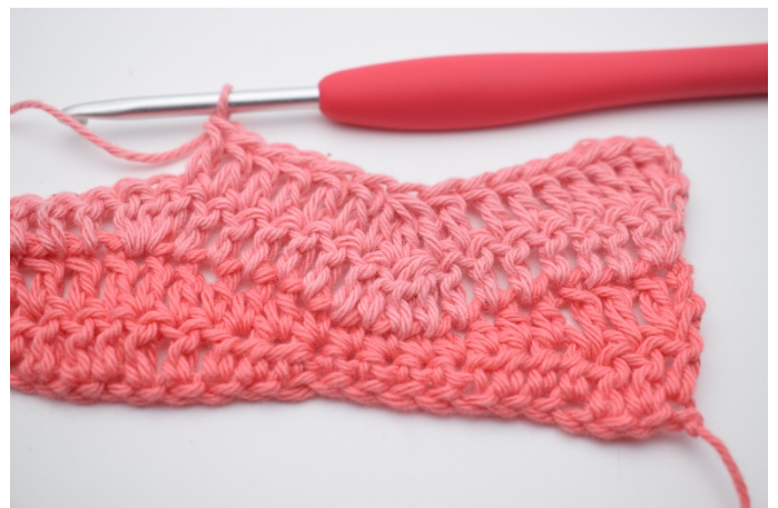
12. Work 1 dc in the next 6 sts.