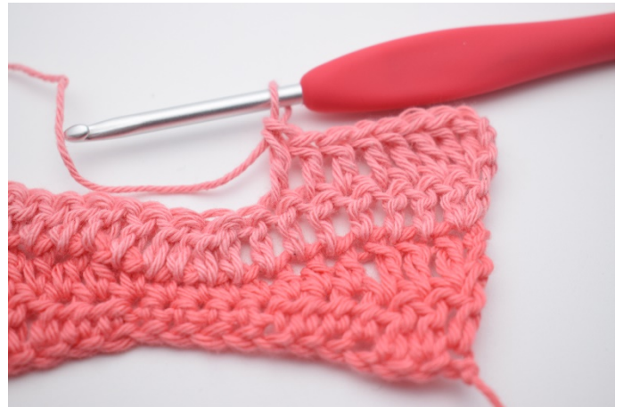
10. Work 1 dc in the next 6 sts.