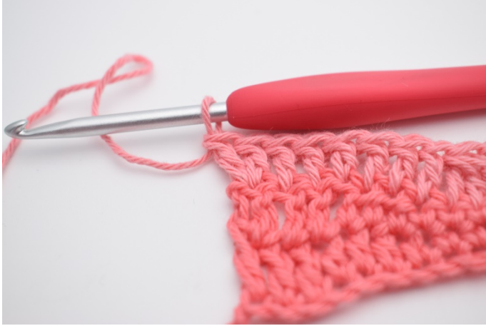
7. but finish with just 2 dc in the last st.