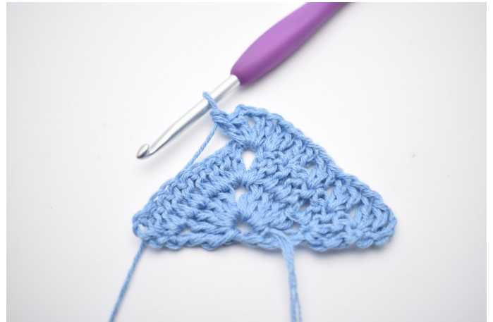
4. Work 2 dc, ch 2, 2 dc around ch-space.