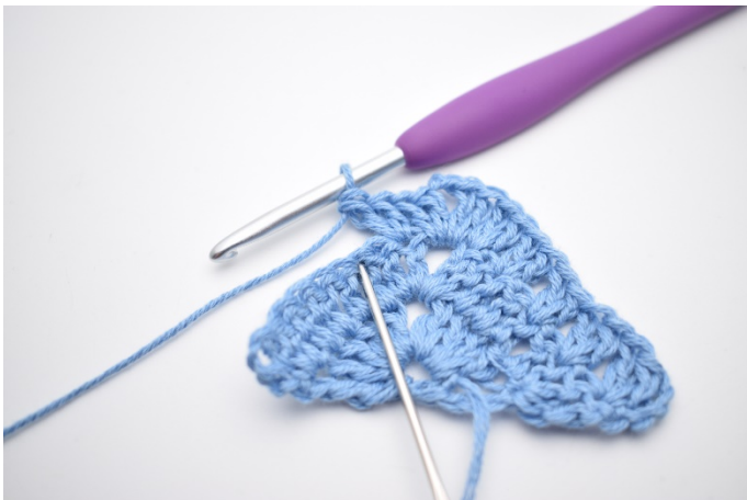
5. Work "2 dc, skip 1 st".