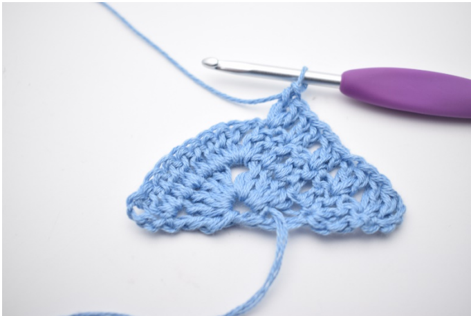
3. Repeat from "to" 4 times.