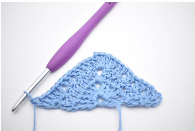
7. Work 2 dc and tr in last st.