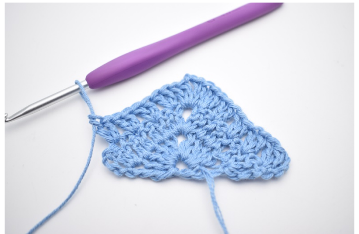
6. Repeat from "to" 4 times.