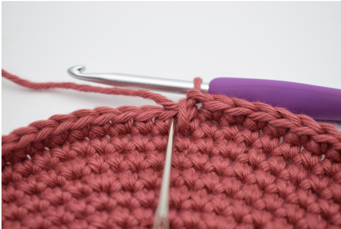
3. Work 1 regular sc in the next st.