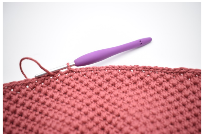
2. Work sl sts in the next 18 sts.