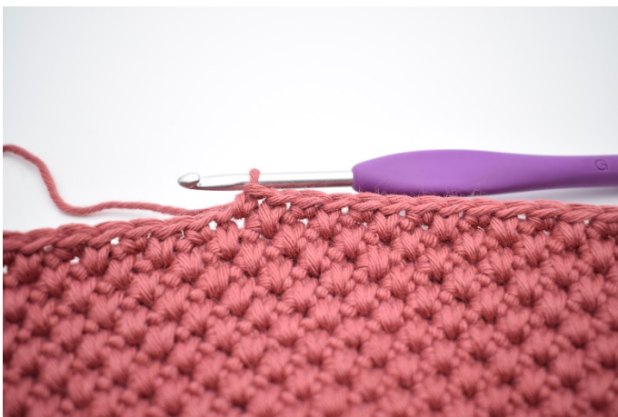
1. Work alternately 1 lsc and 1 sc in the next 16 sts.