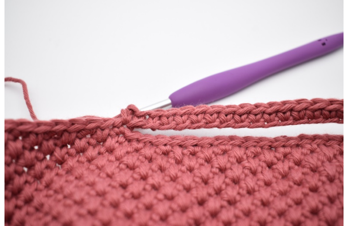
2. Work 1 sc in each ch.