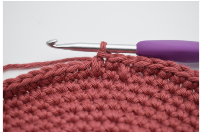
6. Like this.