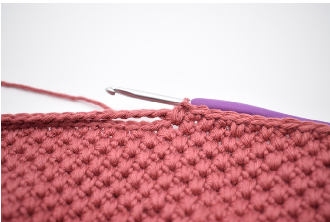
3. Work alternately lsc and sc in the next 33 sts (work 1 lsc in the last st).