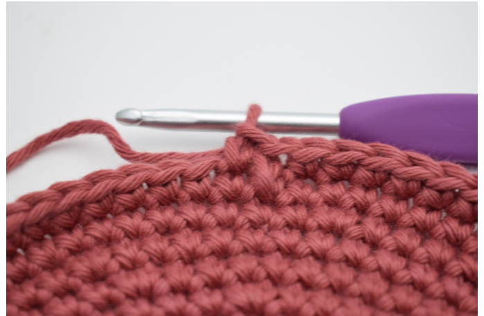
4. Like this.