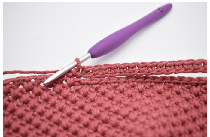
4. Work 1 sc in each ch.