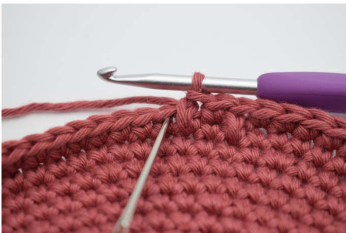
7. Work 1 regular sc in the next st.