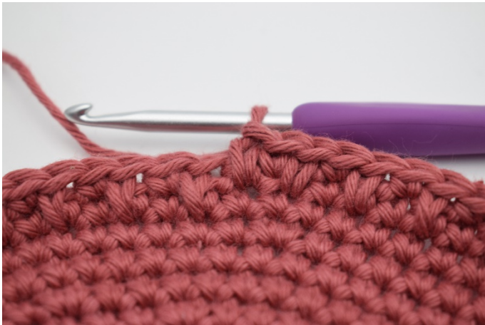
9. Repeat around and finish with 1 lsc.