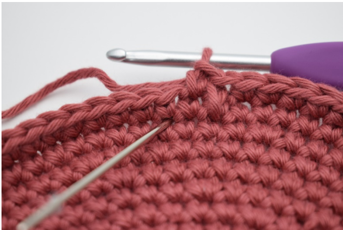
5. Next st is another lsc. It is worked like a regular sc, but in the stitch below (here the needle marks where to work your lsc).