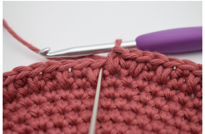
10. When working the next round, work opposite, so you start the round with 1 sc followed by 1 lsc. I.e., you work sc in lsc from previous round, and lsc in sc from previous round. Repeat the 2 rounds like this as described in the pattern.