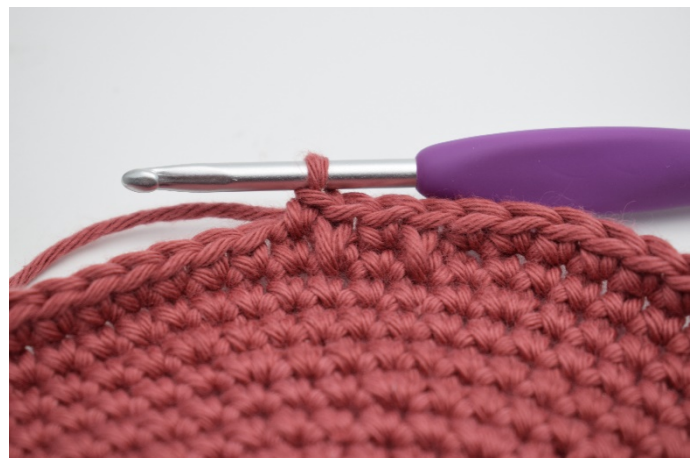
8. Like this.