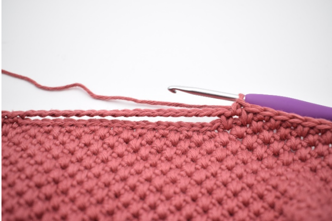
1. Work alternately lsc and sc up to the 18 ch.

3. Now work alternately lsc and sc in the next 16 sts. Work 1 sc in the 18 ch. Work alternately lsc and sc in the next 33 sts (work 1 lsc in the last st). Work 1 sc in the 18 ch. Work alternately sc and lsc in the last 16 sts.