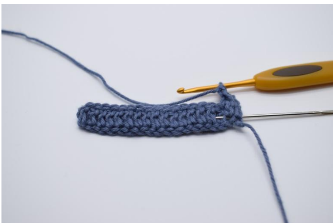
5. Now we'll make a bpdc around the post of the next dc of the previous row. The needle shows how to insert the hook at the back of the post.