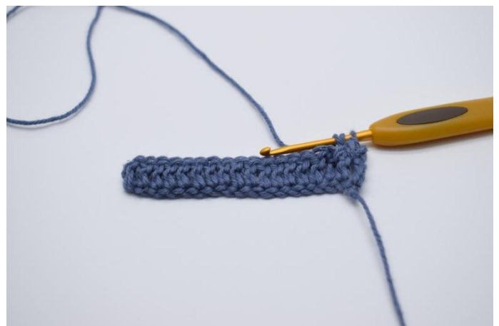
6. Yarn over and insert the hook at the back of the post, yarn over and pull through like a normal dc.