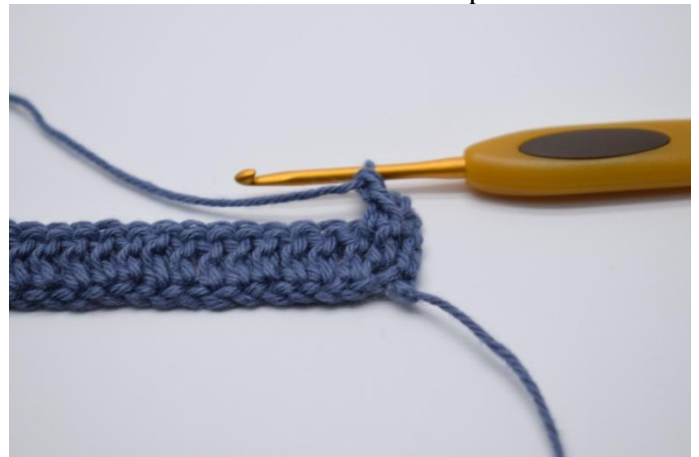
4. Yarn over and finish your dc as normal. You've now made 1 fpdc.