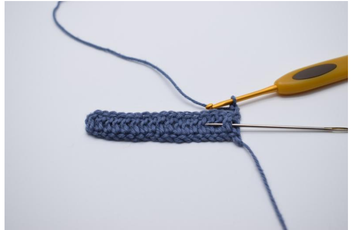
2. The 1st fpdc is made around the post of the 2nd dc of the previous row. The needle shows how to insert the hook at the front of the post.