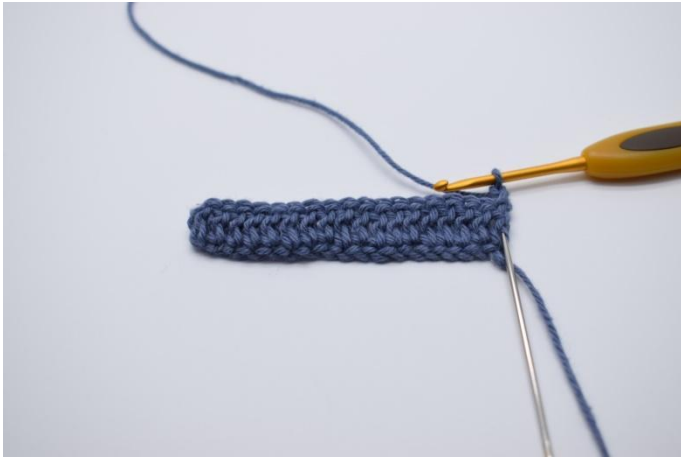
1. The 1st dc is replaced by the 2 ch you turn with.