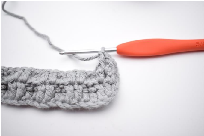
5. You've now worked 2 fpdc.