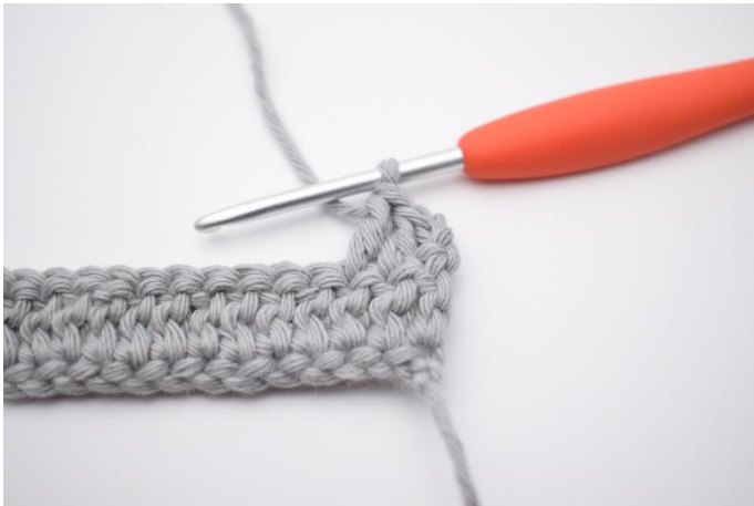
3. Like this.