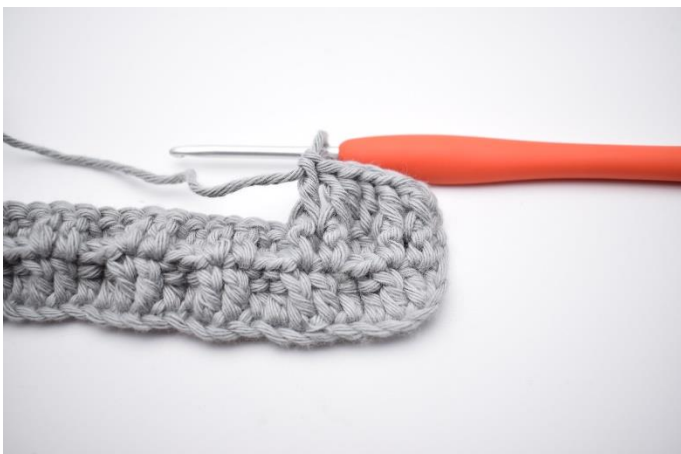
7. Work 2 fpdc.