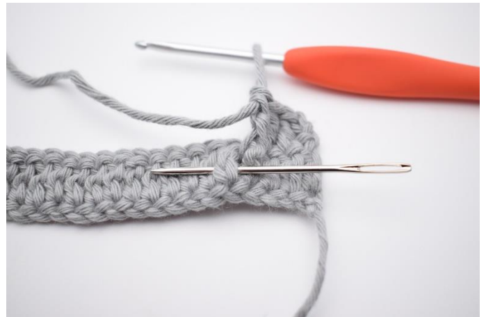
6. Work 1 fpdc around the next st. The needle marks how your hook goes around the dc post from the front.