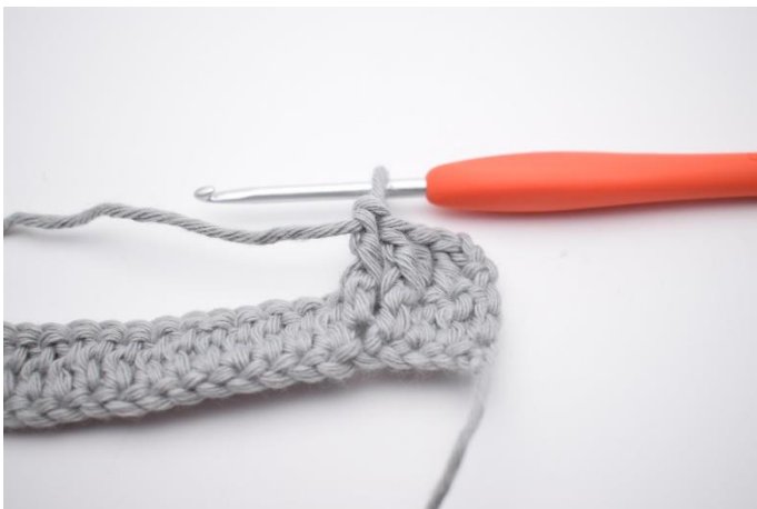
7. You've now worked 2 fpdcs.