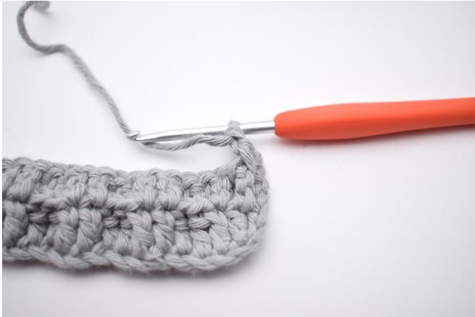
3. You've now worked 1 fpdc.