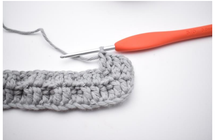
6. Work 1 regular dc in the next 2 sts.