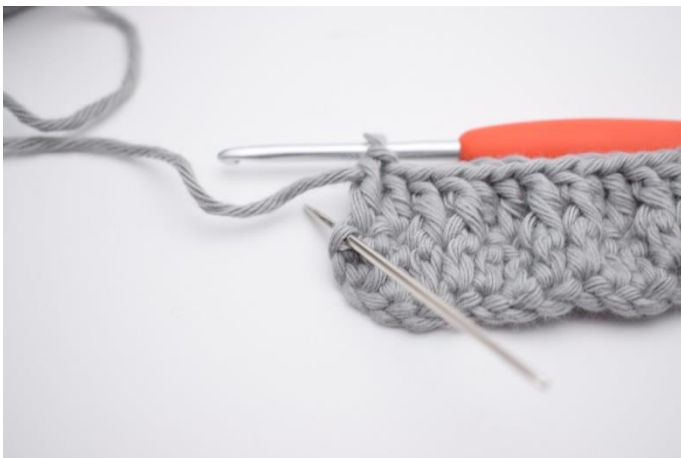
11. Finish the row with 1 dc in the last st.