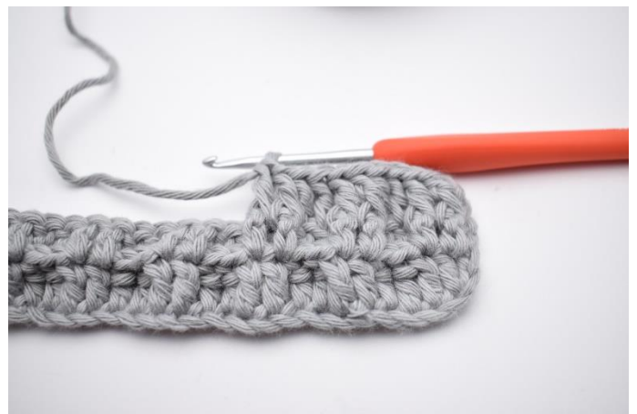
8. Work "2 dc, 2 fpdc".