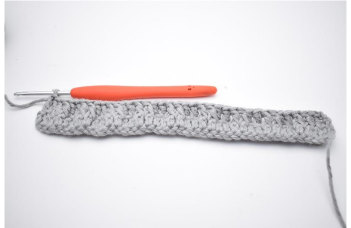
10. Repeat "to" across.