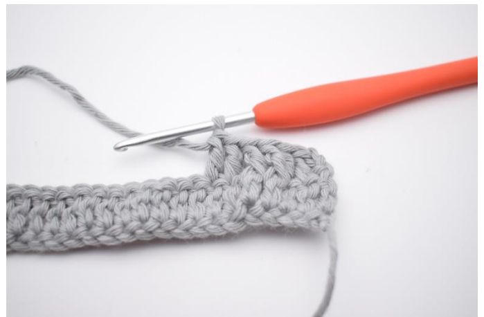
8. Work 1 regular dc in the next 2 sts.