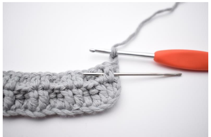
2. Work 1 fpdc around the next 2 sts. The needle marks how your hook goes around the dc post from the front.