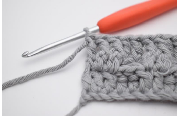
10. Finish with 1 dc in the last st.