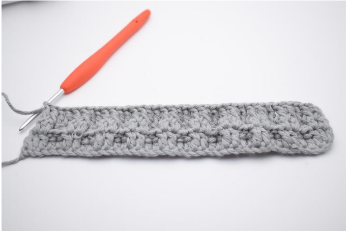
9. Repeat "to" across.