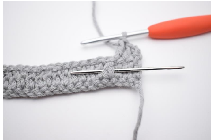
4. Now work 1 fpdc around the next st. The needle marks how your hook goes around the dc post from the front.