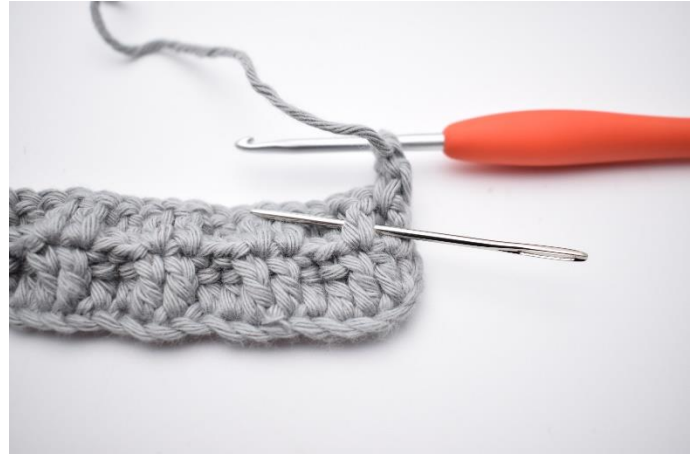
4. Work 1 more fpdc. The needle marks how your hook goes around the dc post from the front.