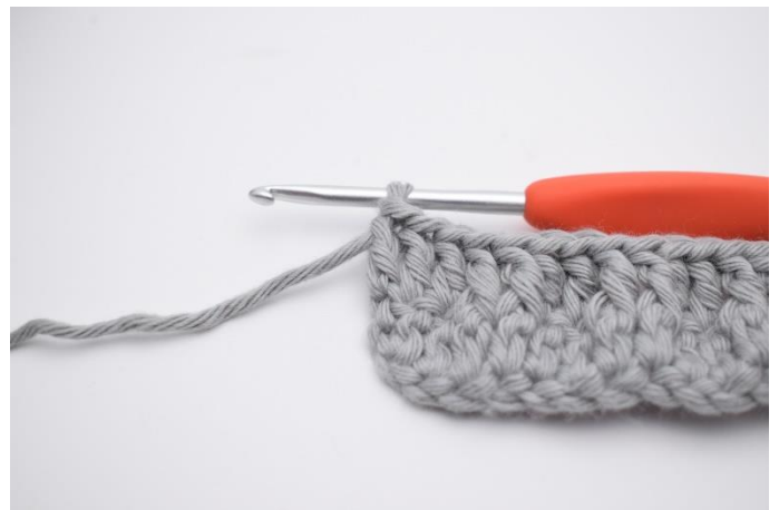
12. Like this.