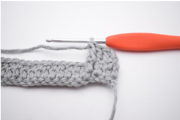
5. You've now worked 1 fpdc.