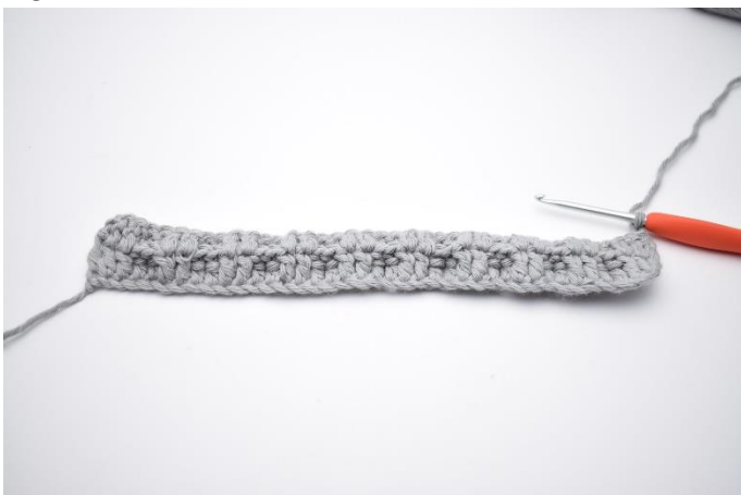
1. Turn the work with 2 ch.