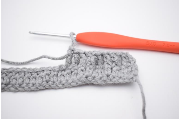
9. Work "2 fpdc, 2 dc".