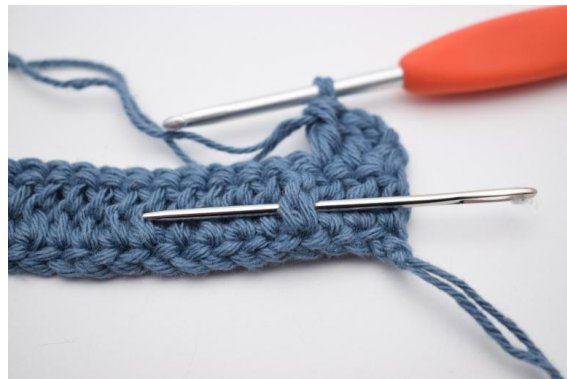
4. Now work 1 fpdc around the next st. The needle is indicating where to insert the hook.