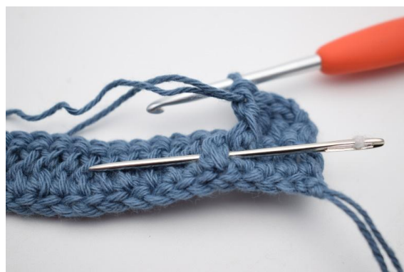
6. Work 1 fpdc around the next st. The needle is indicating where to insert the hook.