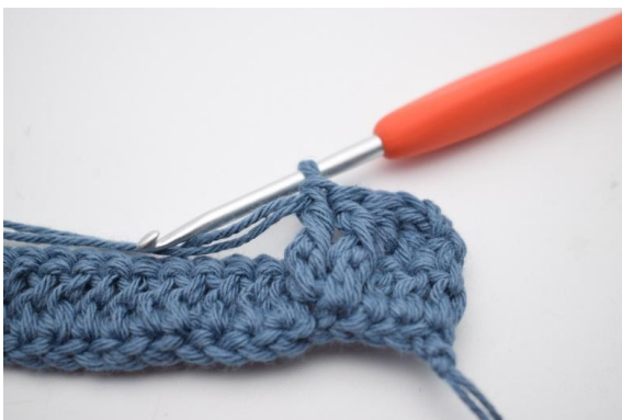
7. Now there are 2 fpdc.