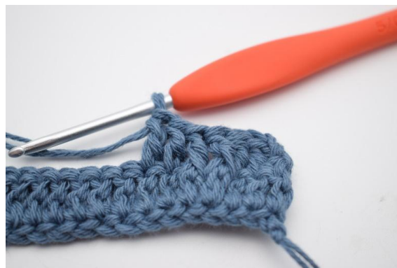
8. Now there are 2 fpdc.