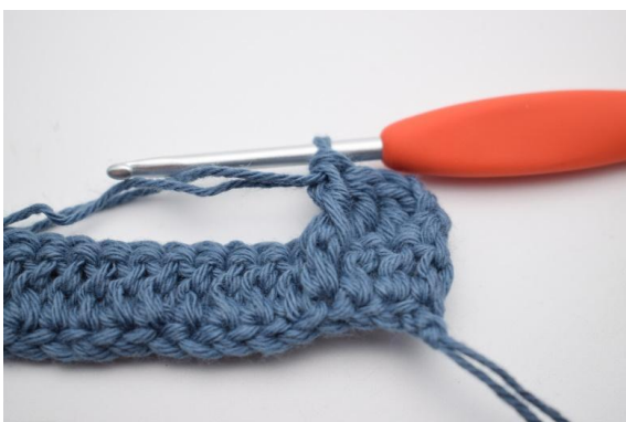
5. There is now 1 fpdc.