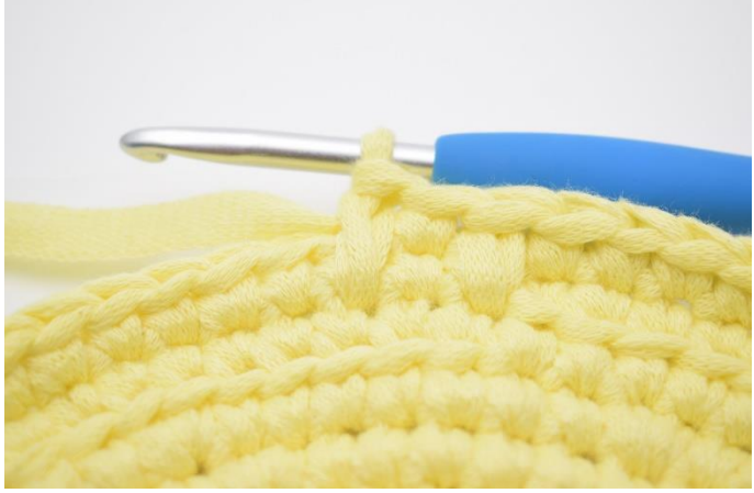
6. Like this.