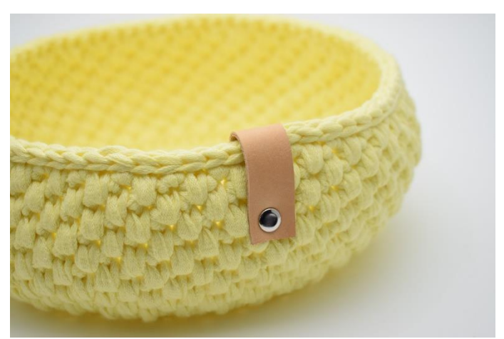
Place the leather strap over the edge and attach with a rivet.