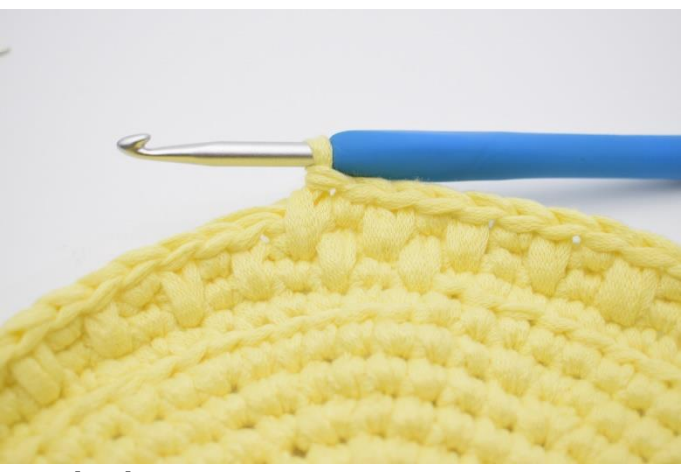
6. Like this.