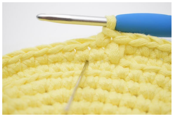
5. Work 1 long-sc. The needle indicates where to insert the hook.