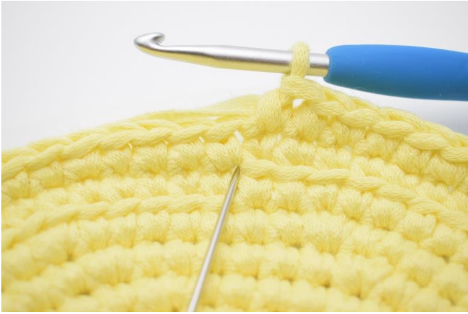
2. Work 1 long-sc. This means working a regular sc but into the row below where you would normally work. The needle indicates where to insert the hook.