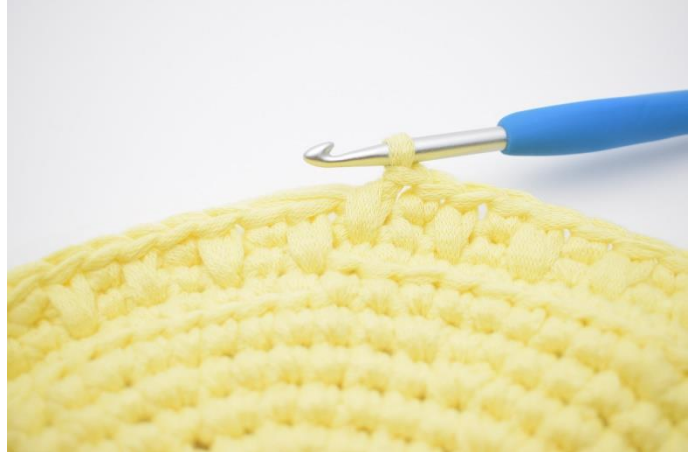
8. End with 1 long-sc. This was the first rnd.