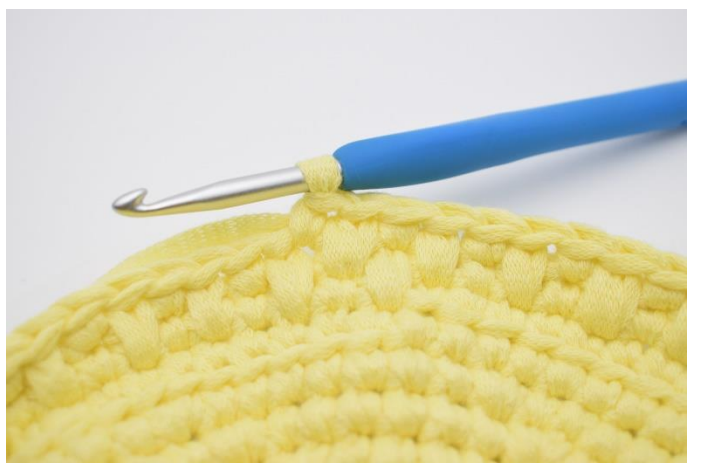
4. Now work 1 sc in the next st.