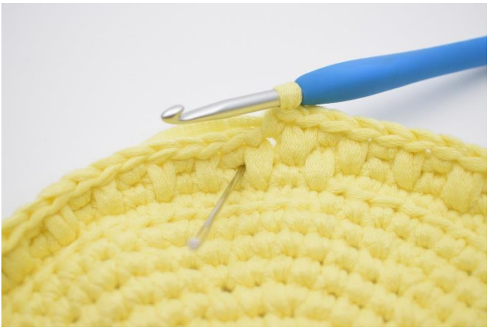
5. Work 1 long-sc. This is again worked around the regular sc from the previous rnd. The needle indicates where to insert the hook for the long-sc.