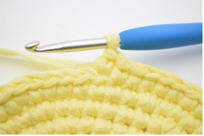
3. Like this.