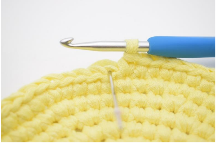
2. Work 1 rnd of sc in the BL. The needle indicates where to insert the hook.