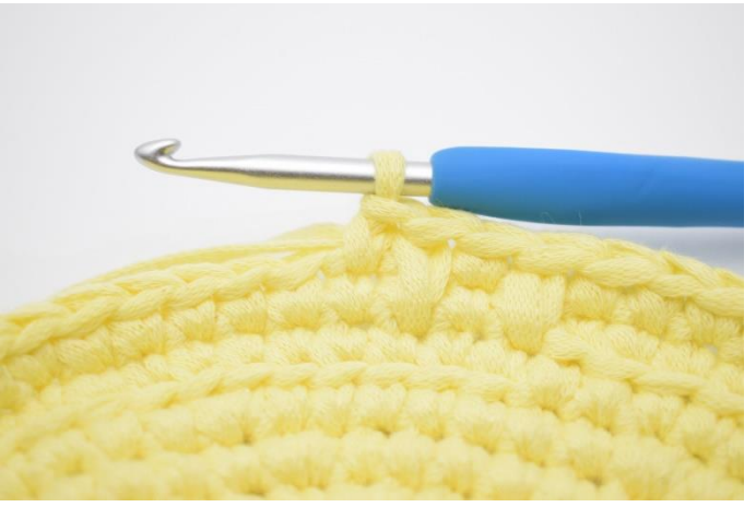
7. Work 1 regular sc in the next st. Work "1 long-sc, 1 sc" to the end of the rnd.