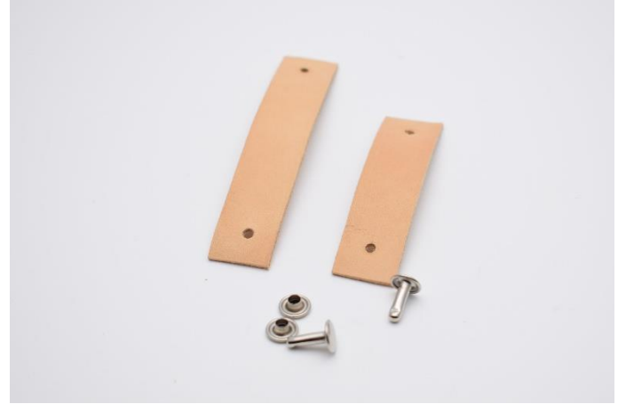
Cut the leather to size (4" and 3") Use the leather working punch tool to make a hole in each end.