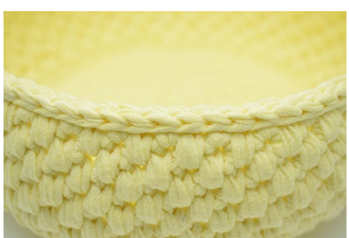
8. End with 1 rnd of sl st. Cut the yarn and weave in the ends.