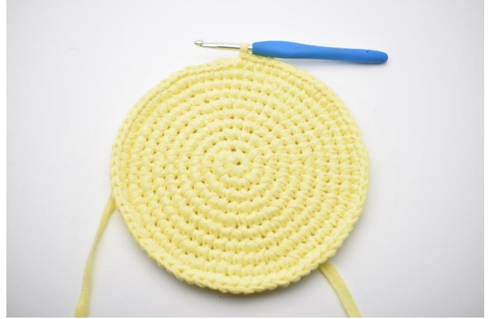
1. This is what the base looks like when completed.