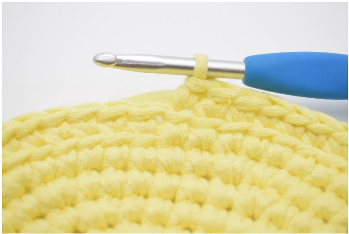
4. Repeat 1 sc in the BL of each st to the end of the rnd.