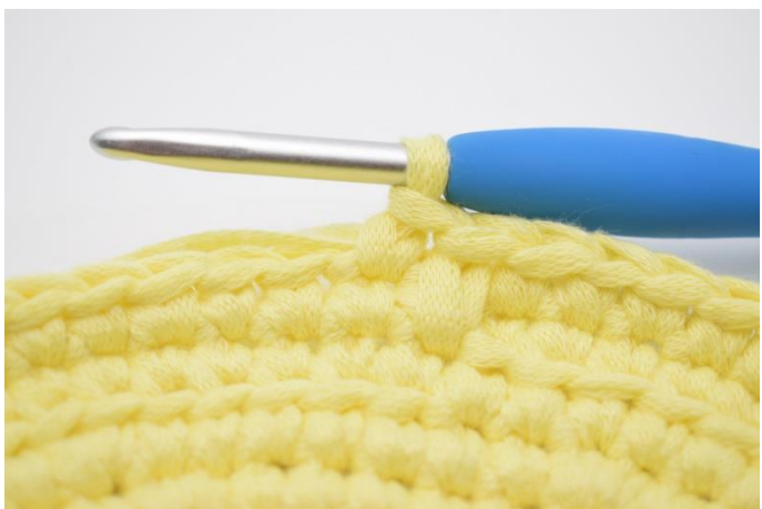
4. Work 1 regular sc in the next st as you normally would.