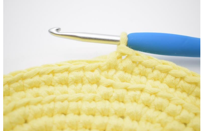
1. Now you will begin the pattern with alternating sc and long-sc as follows.