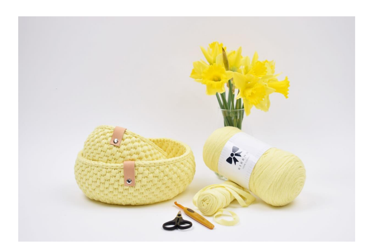
Enjoy! ① Best Wishes, Hobbii