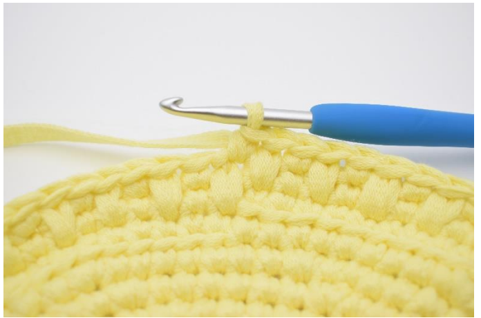
1. On the next rnd work "1 sc, 1 long-sc". Work 1 sc in the first st.