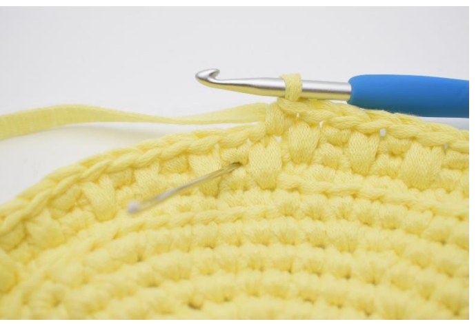
2. Now you are ready to work 1 long-sc. This is worked around the regular sc from the previous rnd. The needle indicates where to insert the hook for the long-sc.