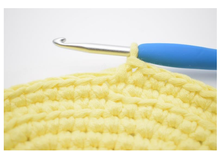
5. Work 1 rnd of sc.