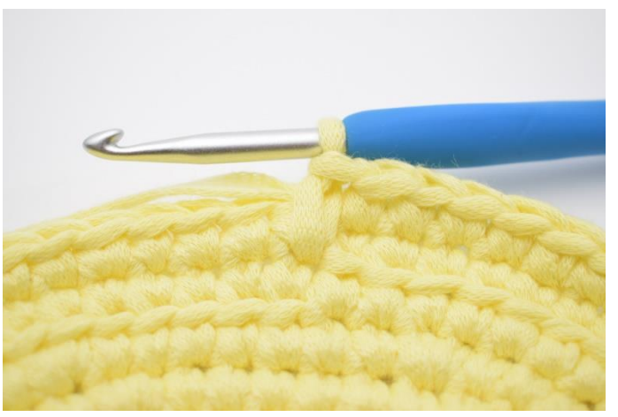
3. Like this. You now have 1 long-sc.