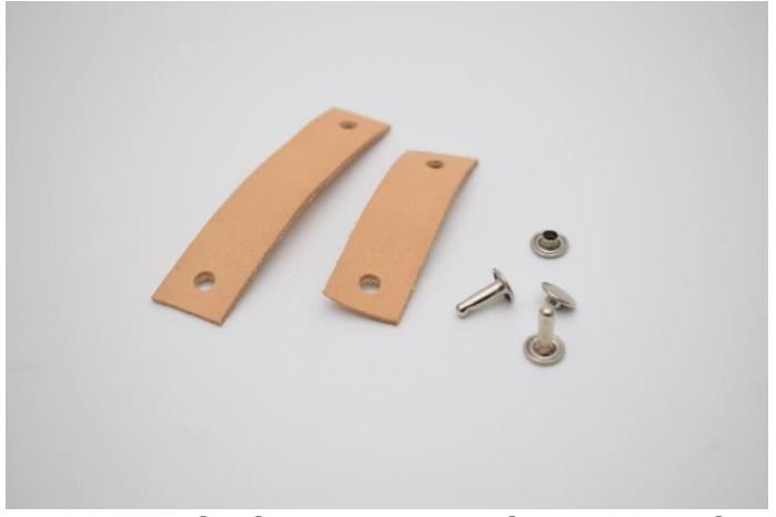
14. Cut your leather strap so you have 1 piece that is 3" and another that is 2 ½". Punch a hole in each end for the rivets.