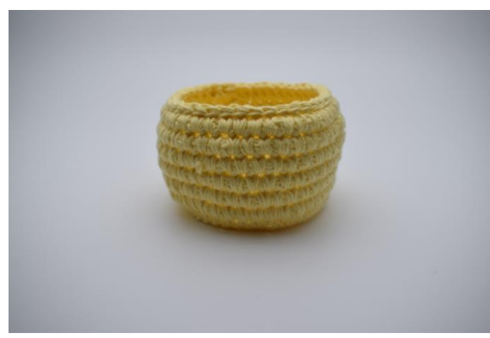
13. End with 1 rnd of sl sts.