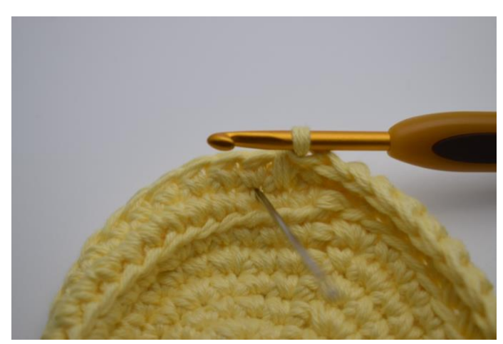
7. Repeat for the next st. The needle indicates where to insert the hook