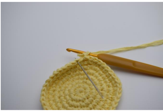
2. Ch 1. Work 1 rnd of sc in the BL. The needle indicates where to insert the hook.