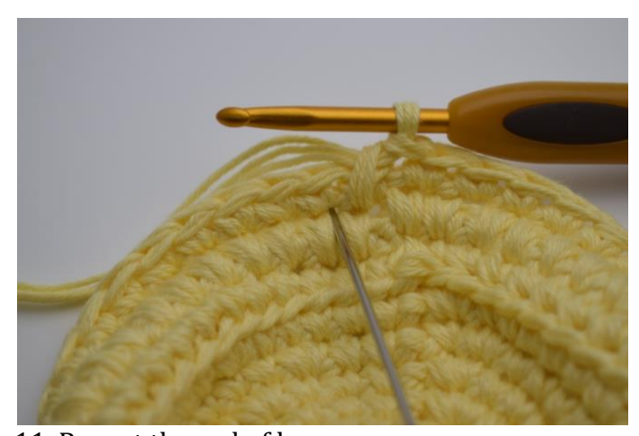
11. Repeat the rnd of long-sc.