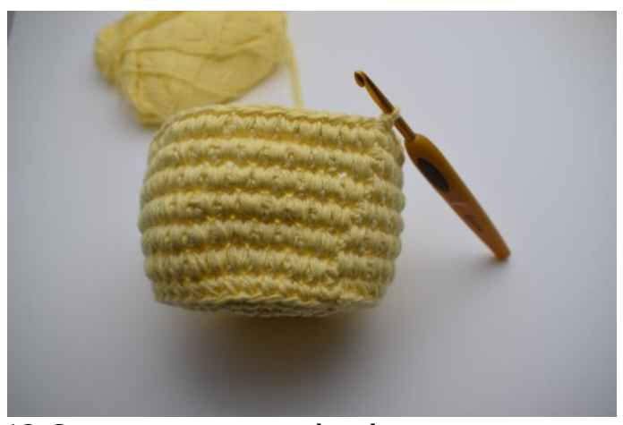
12. Continue as instructed in the pattern.