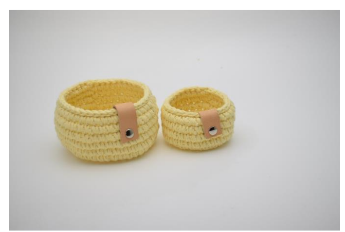
15. Attach to the baskets as shown in the picture

If you have questions about the pattern, please contact: tine@hobbii.dk