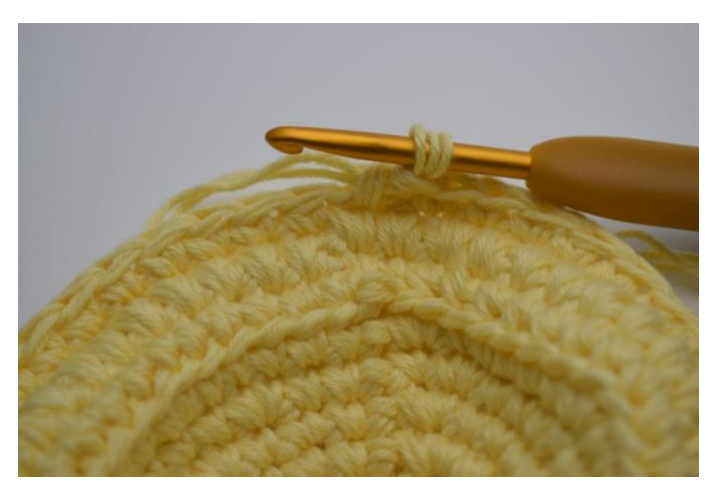
10. On the next rnd work sc as you normally would.