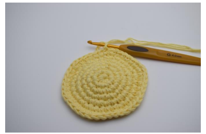
1. This is what the base looks like when completed.