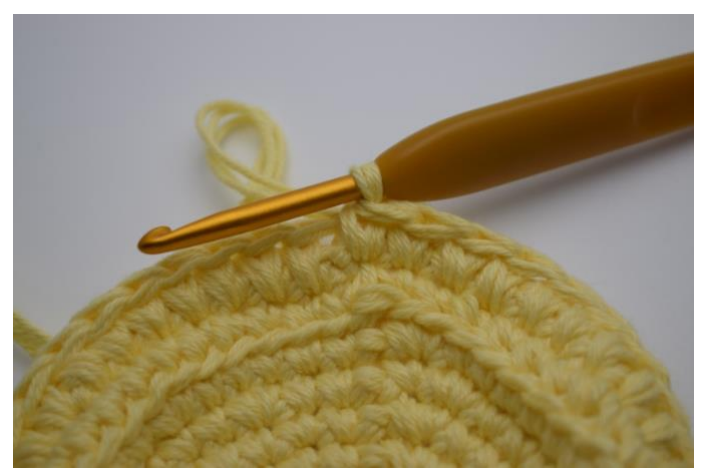
9. Repeat to the end of the rnd.