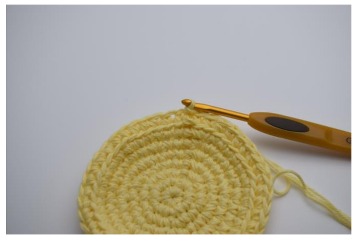
3. End with a sl st.