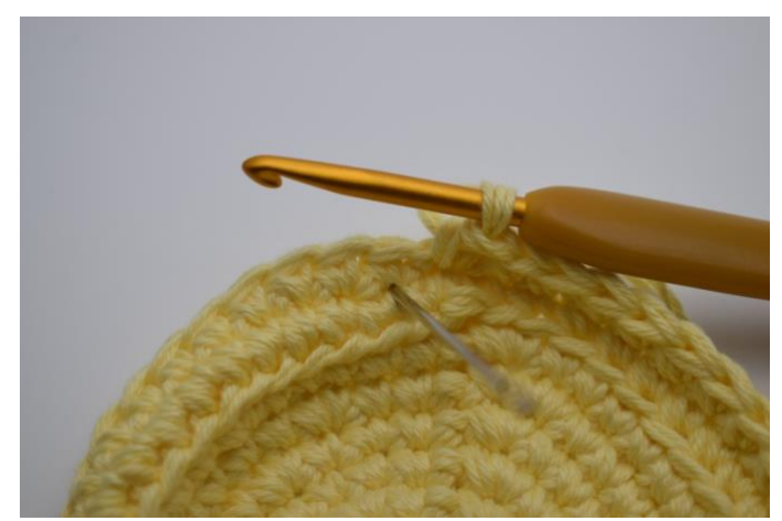
5. Now you will work 1 rnd of long-sc. This is like working a regular sc but into the row below where you would normally work. The needle indicates where to insert the hook.