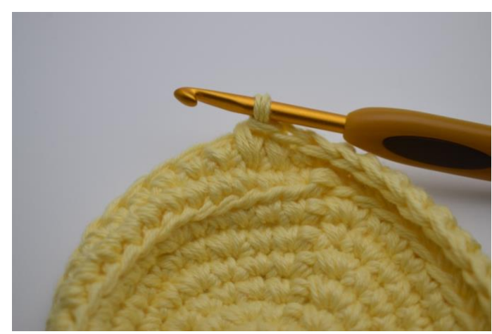
8. Like this. You now have 2 long-sc sts.