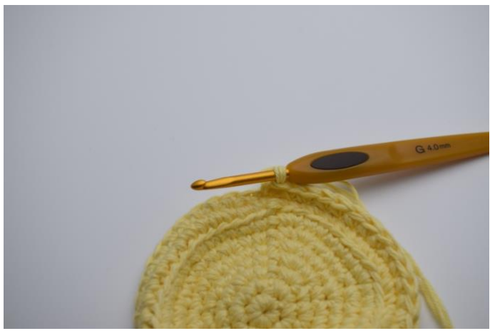
4. Now begin working in a spiral. Work 1 rnd of sc.