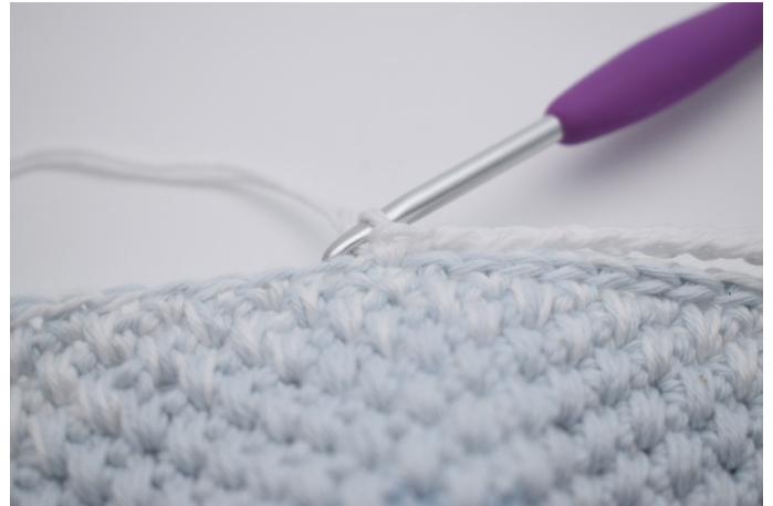
6. and skip the 18 sl sts.