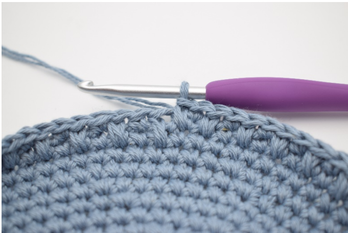
9. Repeat around and finish with 1 lsc.