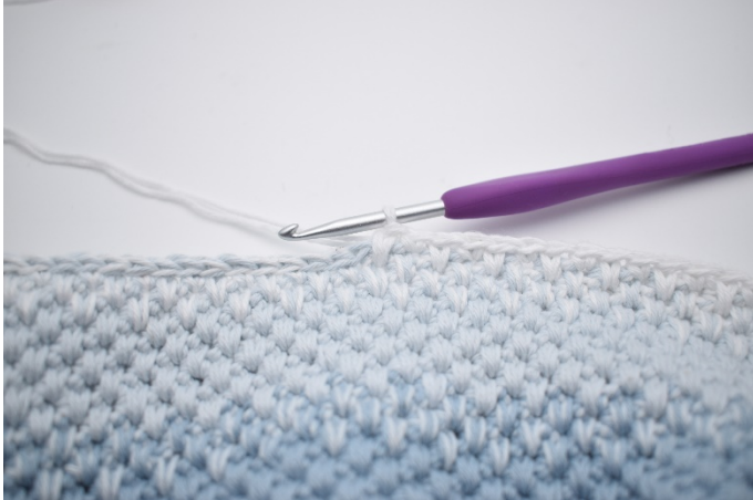
1. Work alternately 1 sc and 1 lsc in the next 16 sts.

2. Now switch color so you only work with color 4. Work alternately 1 sc and 1 lsc in the next 16 sts. Make 18 ch and skip the 18 sl sts. Now work alternately 1 sc and 1 lsc in the next 33 sts (work 1 sc in last st). Make 18 ch and skip the 18 sl sts. Work alternately lsc and sc in the last 16 sts.