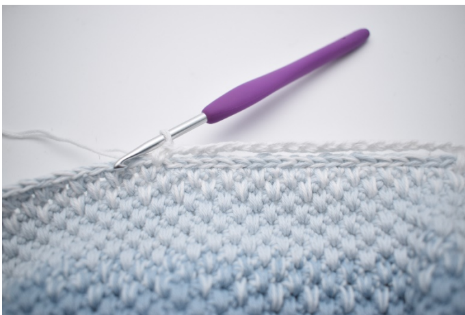
3. Skip the 18 sl sts.