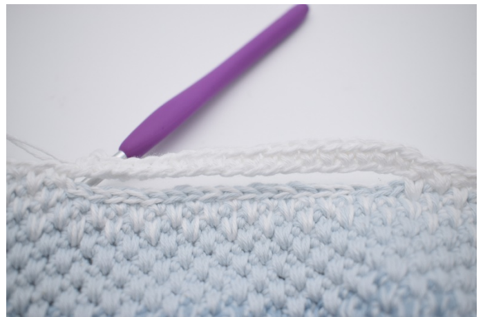
2. Work 1 sc in each ch.