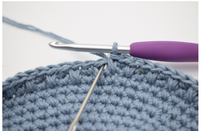
10. When making the next round, work opposite, so you start the round with 1 sc, followed by 1 lsc. Meaning that you work sc in lsc from previous round and lsc in sc from previous round. Repeat the 2 rounds like this as described in the pattern.