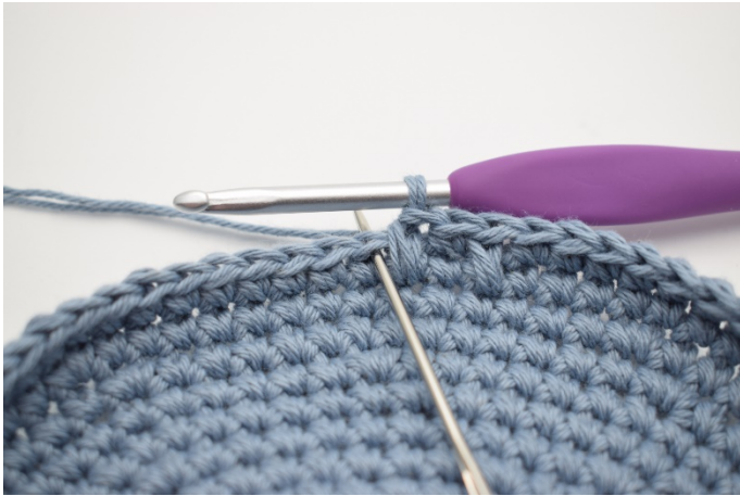
7. Work 1 sc as normally in the next st.