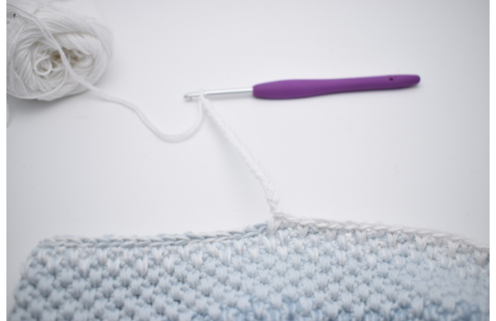
2. Make 18 ch.