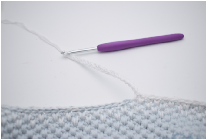
5. Make 18 ch