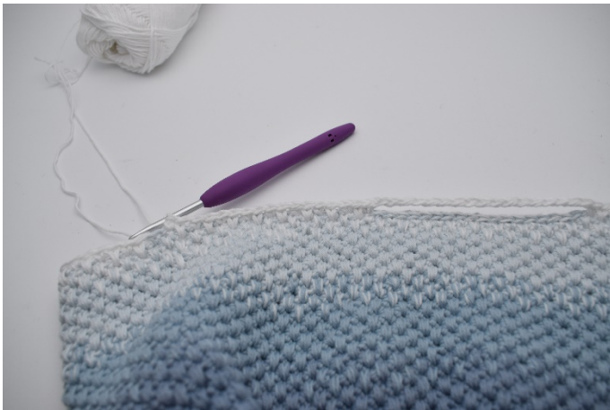
7. Work alternately lsc and sc in the last 16 sts.

3. Now work alternately lsc and sc in the next 16 sts. Work 1 sc in the 18 ch. Work alternately lsc and sc in the next 33 sts (work 1 lsc in last st). Work 1 sc in the 18 ch. Work alternately sc and lsc in the last 16 sts.