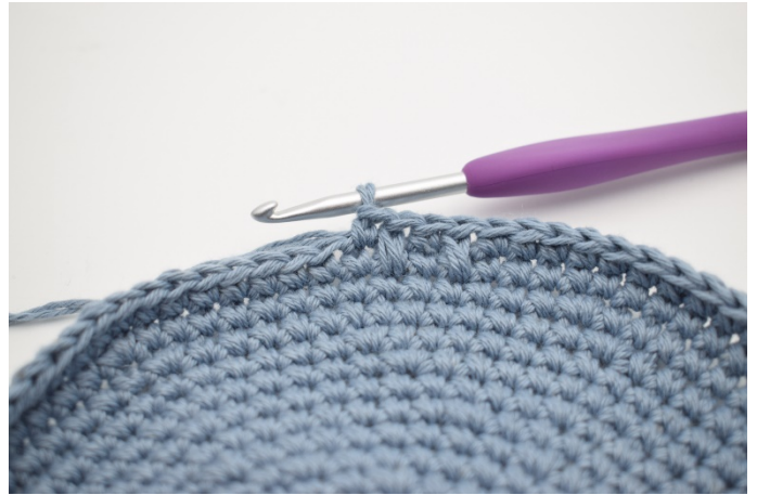
8. Like this. This is repeated around.