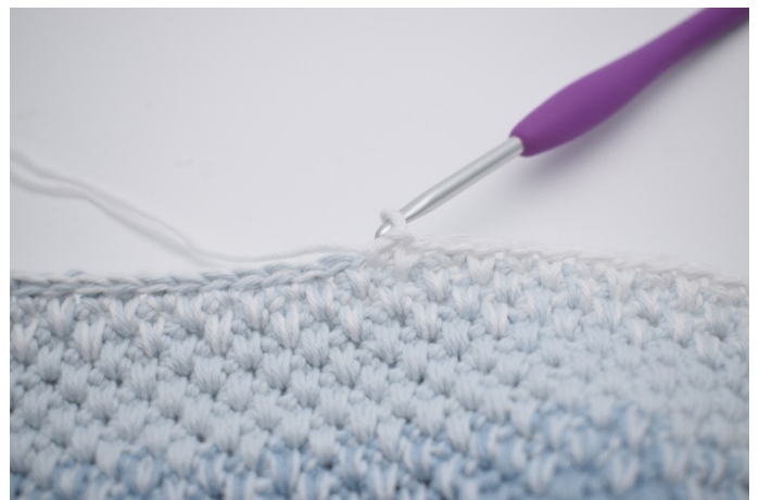
4. Now work alternately 1 sc and 1 lsc in the next 33 sts (work 1 sc in last st).