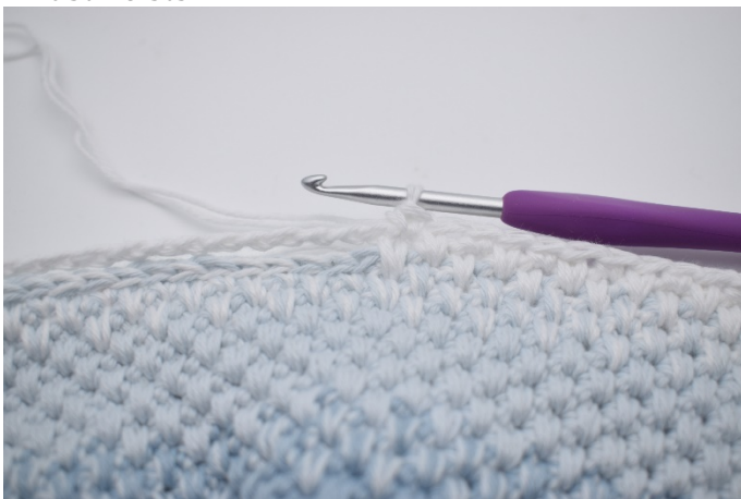
1. Work alternately lsc and sc to the 18 ch.

3. Now work alternately lsc and sc in the next 16 sts. Work 1 sc in the 18 ch. Work alternately lsc and sc in the next 33 sts (work 1 lsc in last st). Work 1 sc in the 18 ch. Work alternately sc and lsc in the last 16 sts.