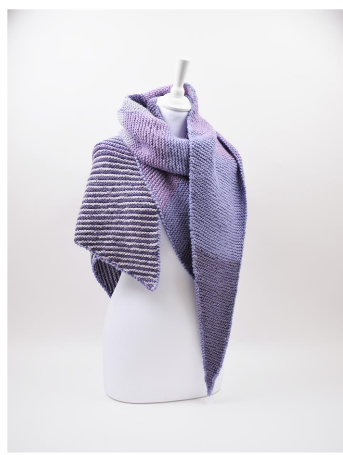
Enjoy ☺ Love from Hobbii.com