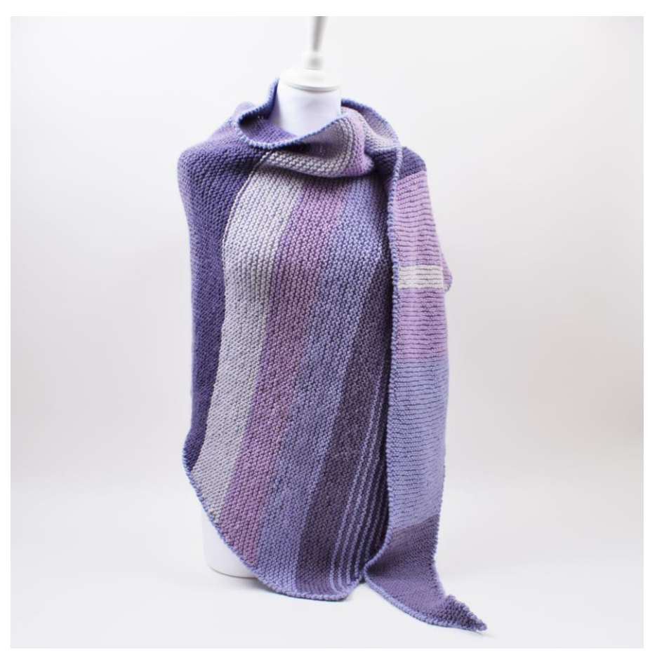
Asymmetric shawl with stripes