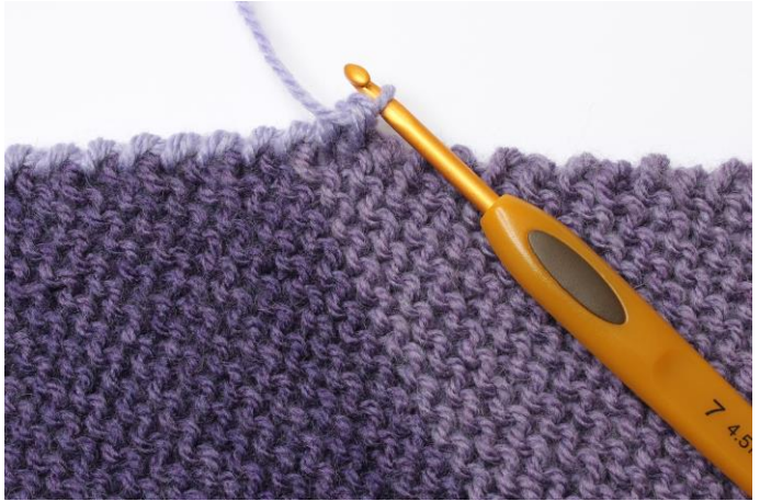
4. one crab stitch completed. Repeat from photo 1.