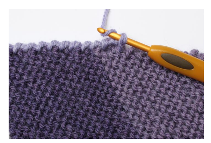
3. yo and pull yarn through both loops on hook,