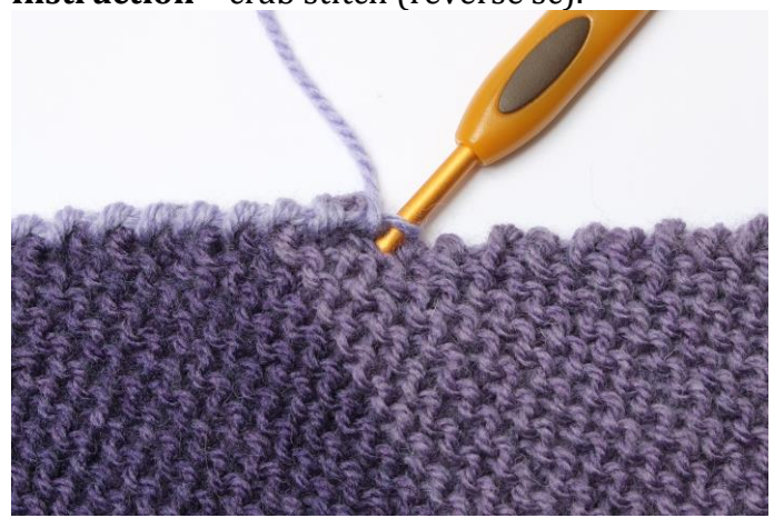
1. Insert hook in edge between 2 ridges,