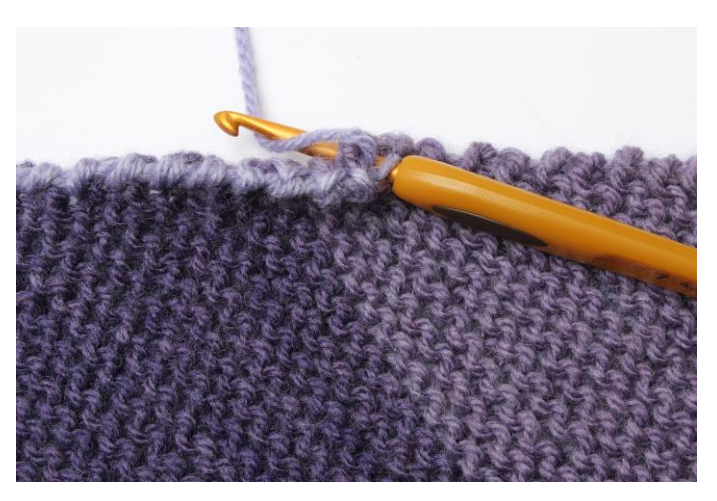
2. yo and pull yarn through stitch = 2 loops on hook