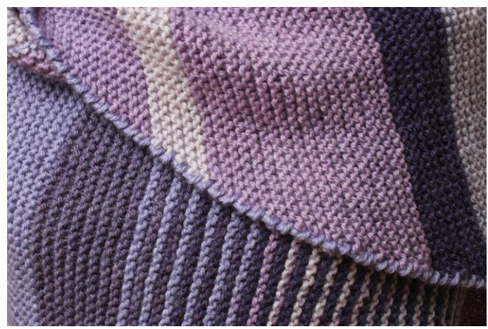
Instruction – crab stitch (reverse sc).