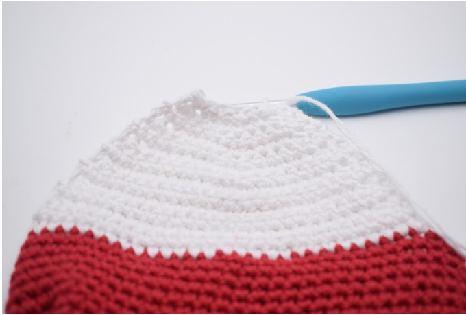
The heel now looks like this.