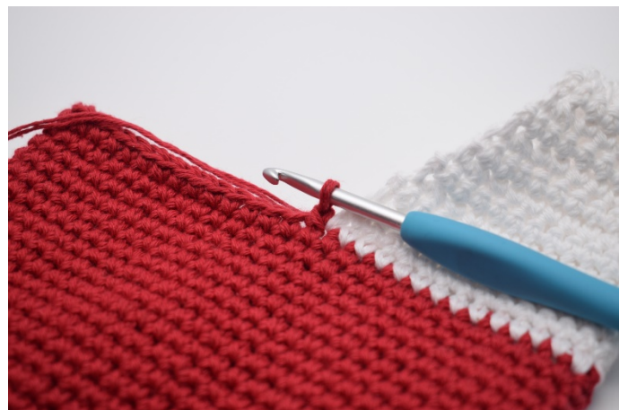
Attach the red yarn.