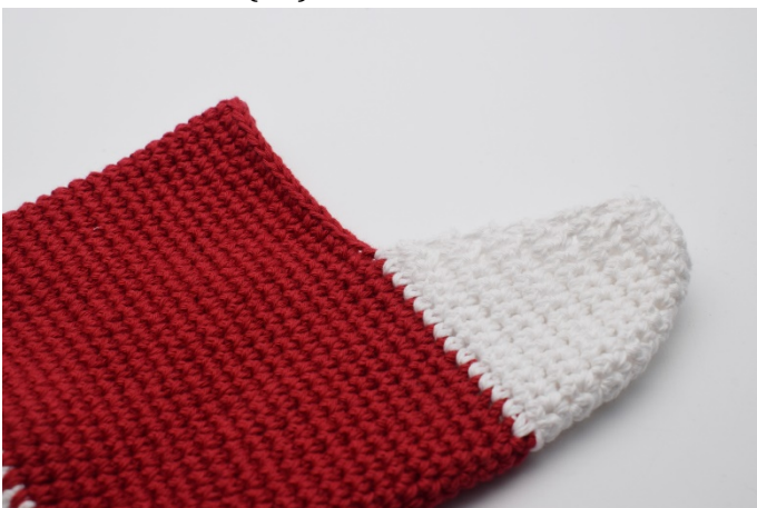
Turn the sock.