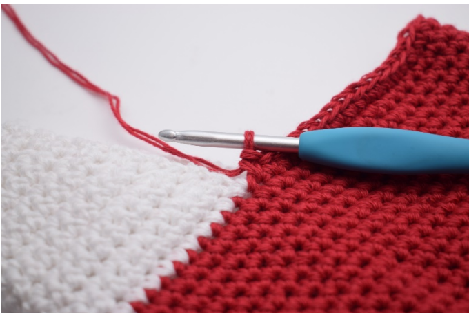
Work 1 sc in 32 st to where the heel starts.