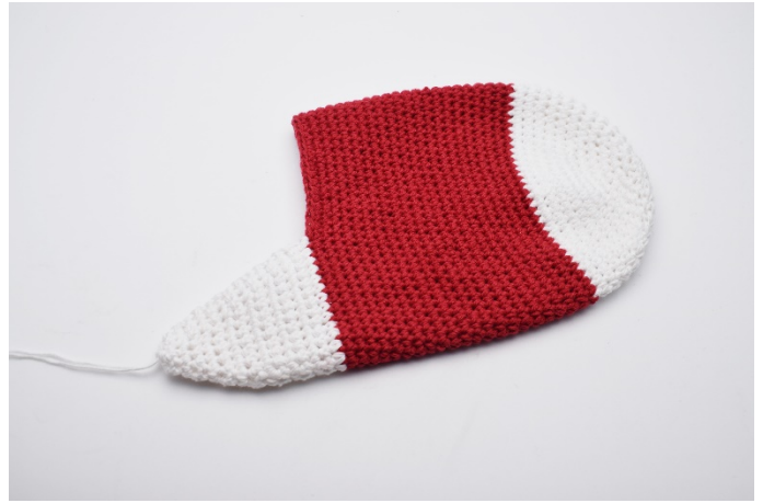
Sew up the end on the wrong side. Your heel is now done.