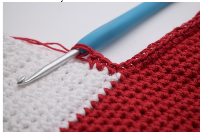
Now work 14 sc along one side of the heel.