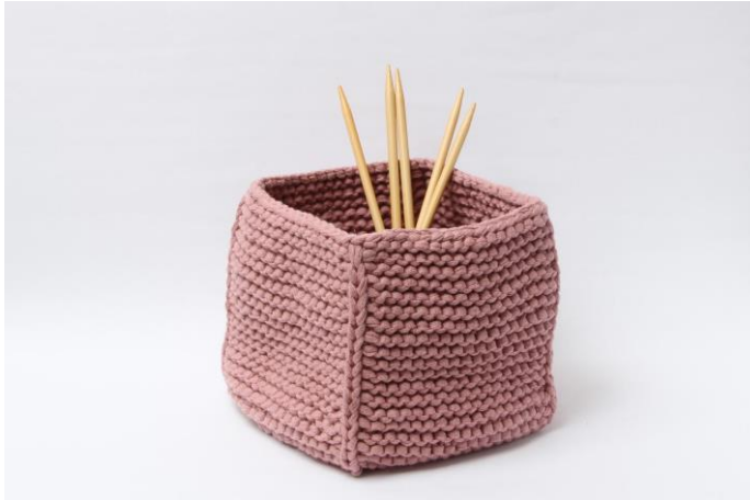
Basket with no fold.