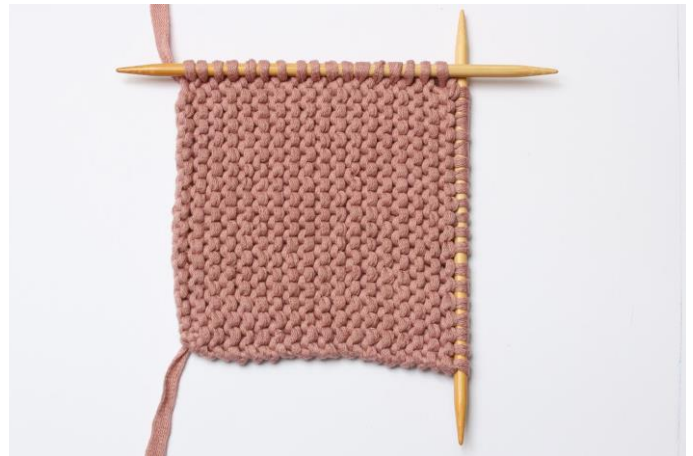
17 stitches on the 2nd needle.