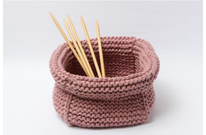
Basket with a folded edge.