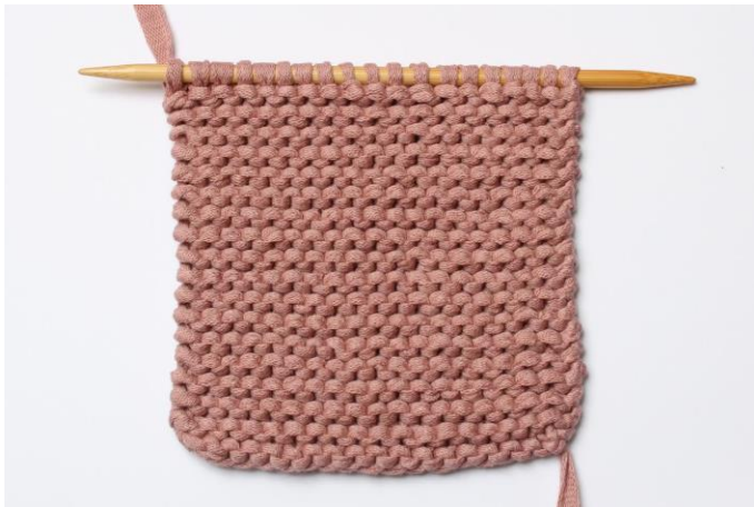
19 stitches on the 1st needle.