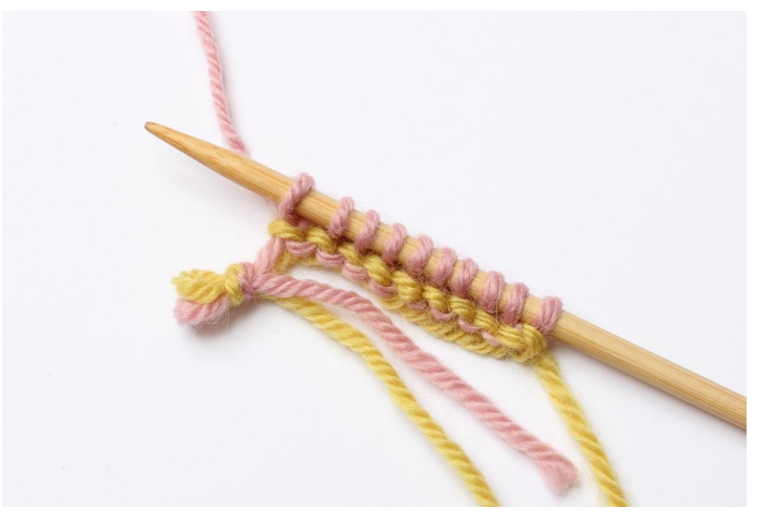
2. Hold color A by your thumb and color B by your index finger, cast on sts, and the sts will appear in color B.