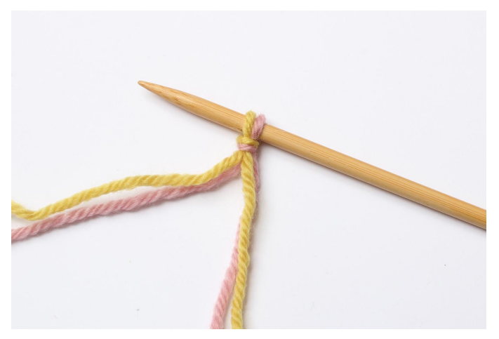
1. Tie a knot using both colors and place it on the needle (the knot is removed later (it does not count as a stitch)