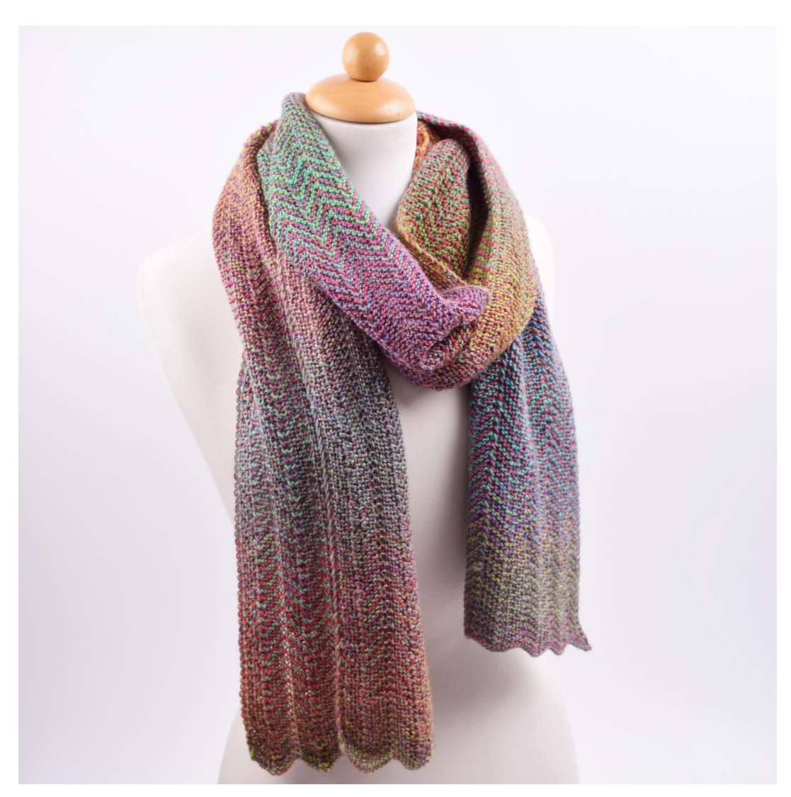
Scarf in zigzag pattern