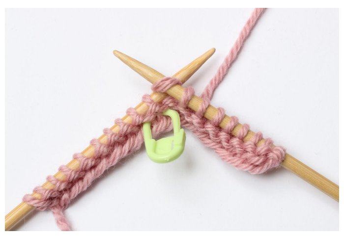
2. Insert the needle knitwise into the s.