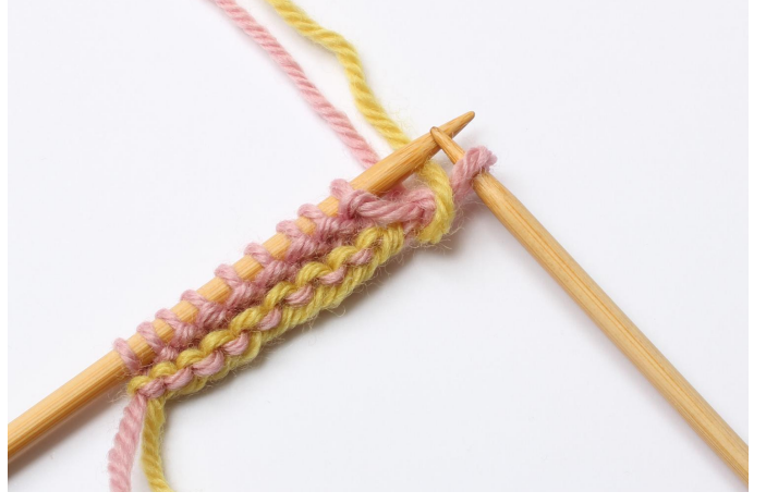
2. Move the s on to the right needle, place the yarn between the needle tips and behind the work