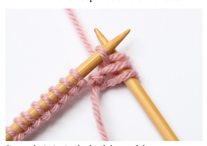
3. knit 1 s in the back loop of the s.