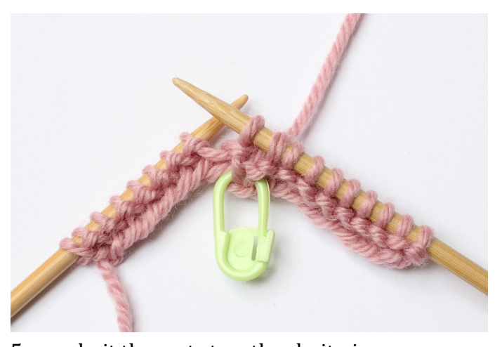
5. knit these sts together knitwise