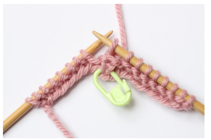
6. Pull or lift the slipped s over the knitted sts.