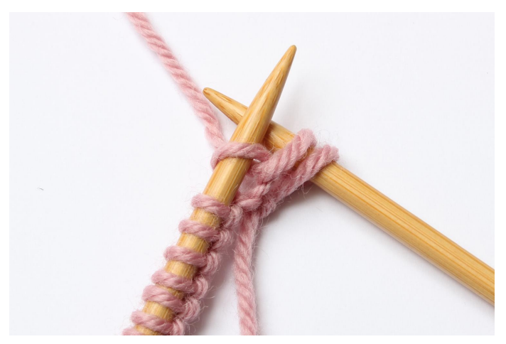
1. knit 1 and keep the s on the left needle