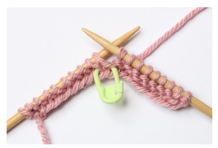
3. Move it on to the right needle