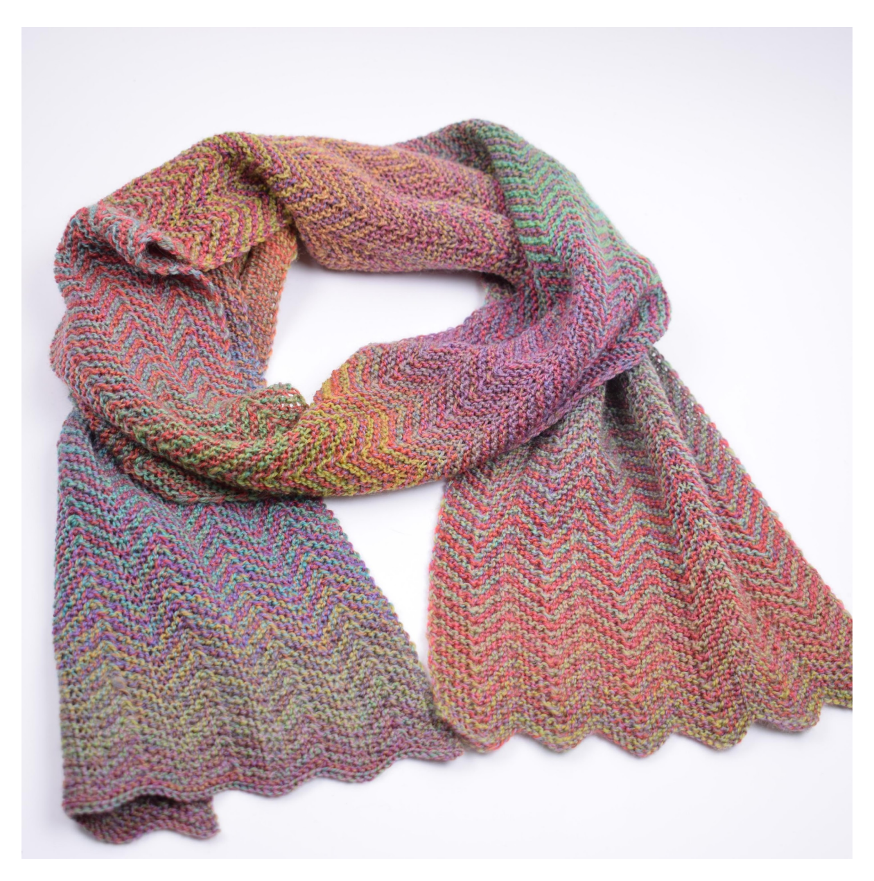
Happy \ knitting \ \odot