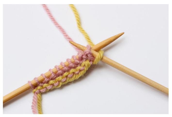
1. Place the yarn over the right needle, insert the needle into the s, from right to left.