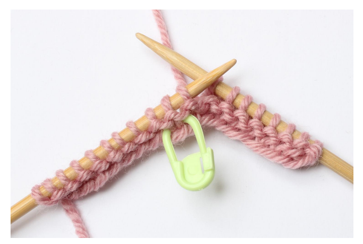
1. knit to 1 s before marker.