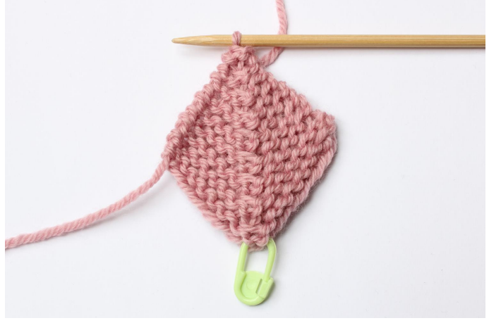
Next row (RS): sl 1, k2tog, pass the sl st over = 1 st remaining.