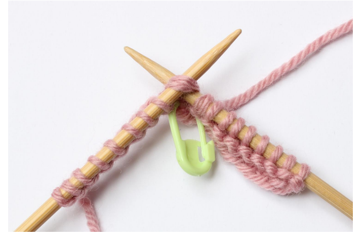
4. Insert needle into the next 2 stitches at the same time, from left to right (as if to knit)