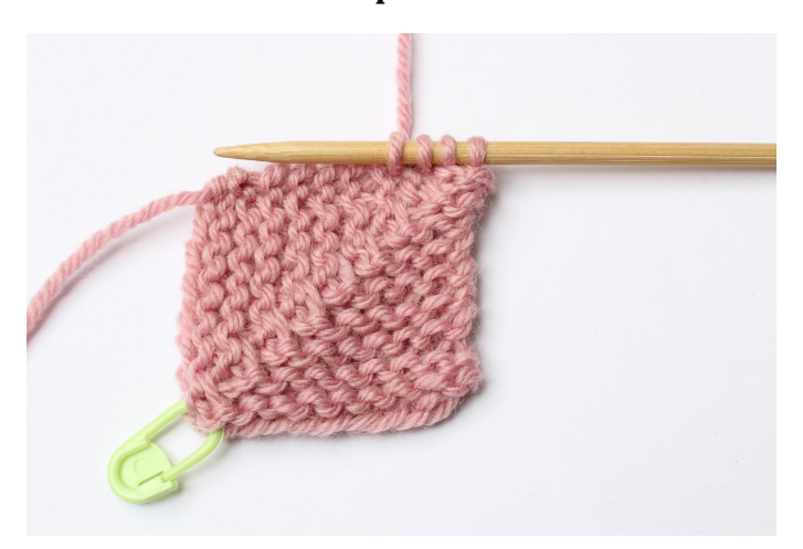
1. Insert needle through the piece between 2 ridges, pull yarn through to create a stitch