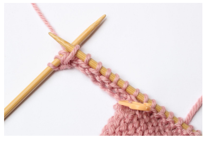
2. k2tog, k1.