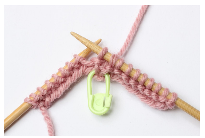
5. Knit these 2 stitches together (k2tog)