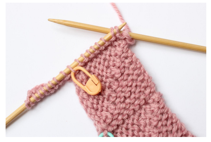
1. sl 1, k2tog tbl, k to 1 st before marker, sl k2tog psso, k until there are 3 sts remaining,