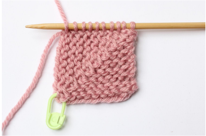
2. Repeat until you have picked up all the stitches.