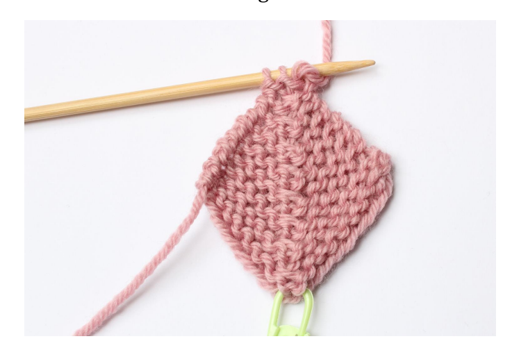
1. Work pattern until there are 3 sts remaining