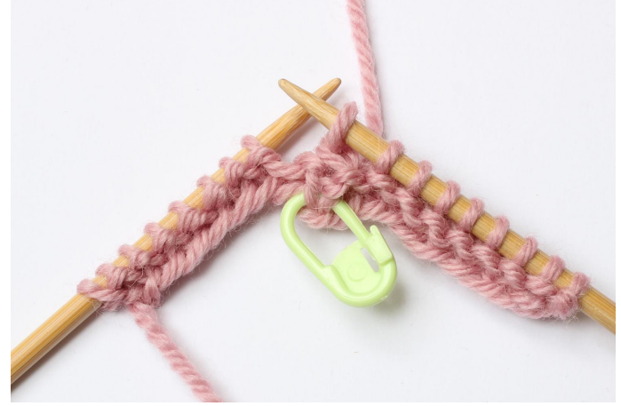
6. Pass the slipped stitch over the new stitch (psso)