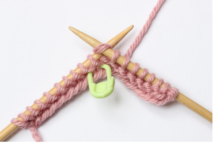
2. Insert right needle as if to knit