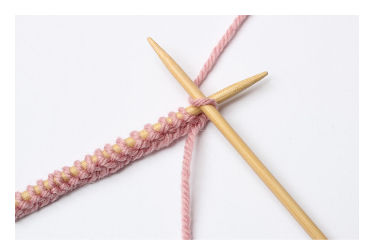
slip 1 stitch as if to knit, insert right needle into stitch from left to right: holding yarn in back