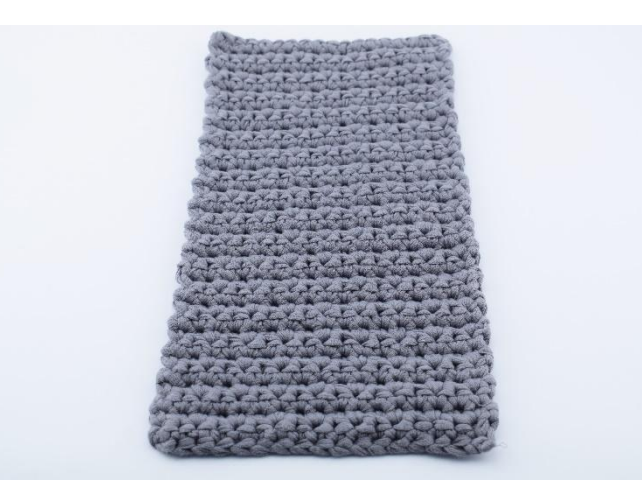
14. Repeat rows 2-3 a total of 17 times.