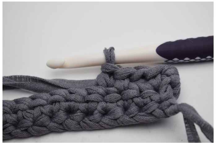
8. Like this.