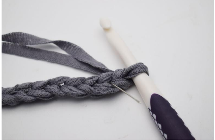
2. In the 2nd ch from the hook (Marked here by the needle), sc 1.