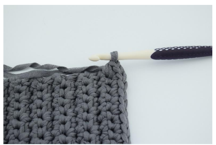
12. Again, sc 3 into the same stitch.

11. Continue round until the top left corner.