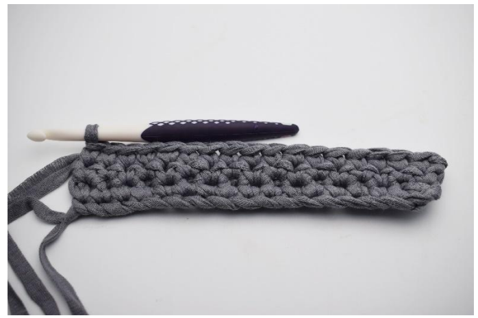
13. Sc the rest of the row.