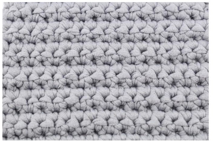
This is the back of your work where you sc normally.