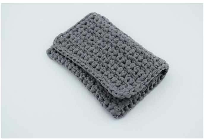
16. Your bag is now ready to have the strap, button and magnet attached.