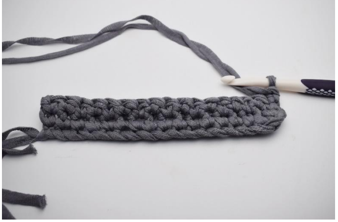
12.\,Ch\,1 and turn .

11. Repeat alternately until the end of the row.