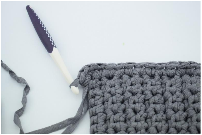
10. To make a nice rounded corner, sc 3 into the same stitch.

9. Continue with sc until the top right corner.