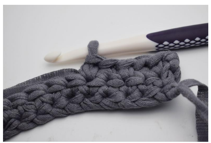
10. Like this.