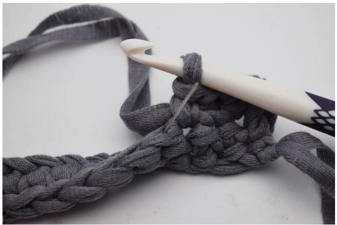
Crochet next sc through the back loop. (Back loop marked here by the needle)