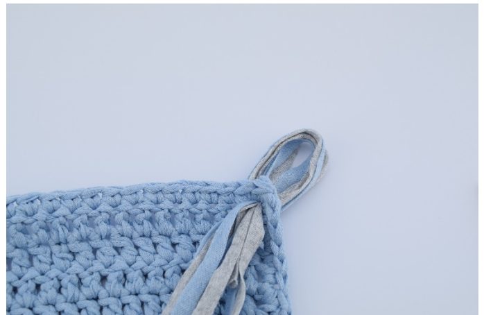
Fold them in the middle and pull through the corner of the rug to form a loop.