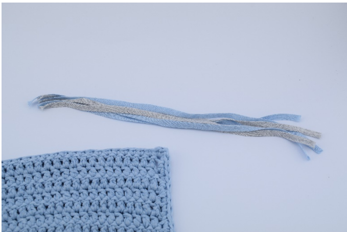
Cut 6 pieces of yarn approx. 12 in long.

The tassels for the "ears" are made as follows: