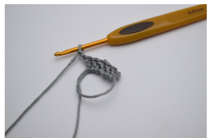
Work 3 dc into the ring and work 2 ch.