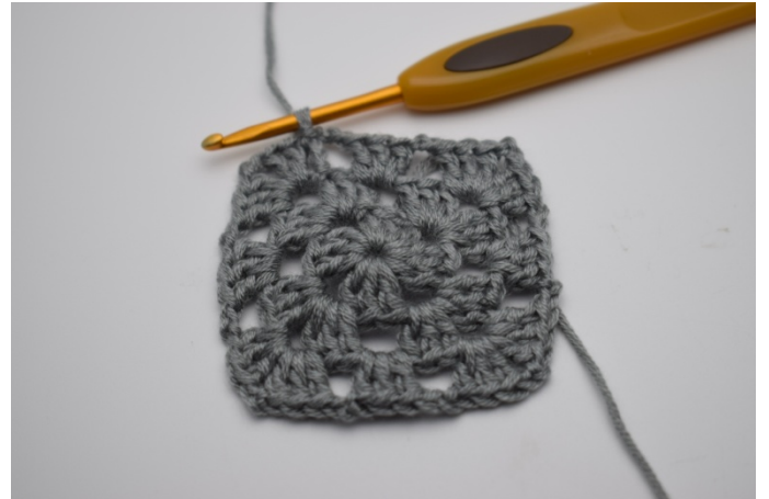
Repeat around and finish with 1 sl st.