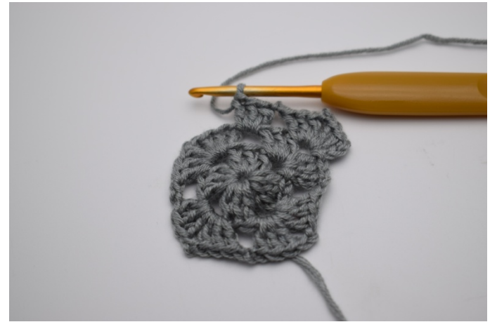
Work 3 dc followed by 1 ch in each ch gap on the sides.