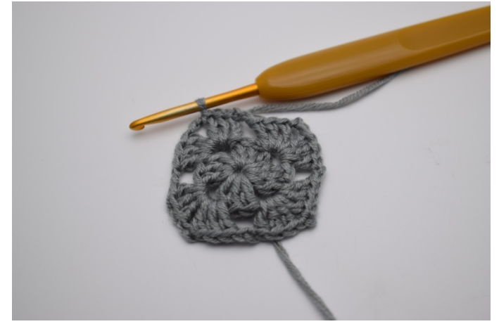
Now work ch to the first ch gap

3. Now work ch to the first ch gap. Make 3 ch (replaces 1st dc). Work 2 dc, 2 ch and 3 dc into the ch gap followed by 1 ch. Work 3 dc followed by 1 ch in each ch gap on the sides. In every corner ch gap work "3 dc, 2 ch, 3 dc, 1 ch". Repeat around and finish with 1 sl st.