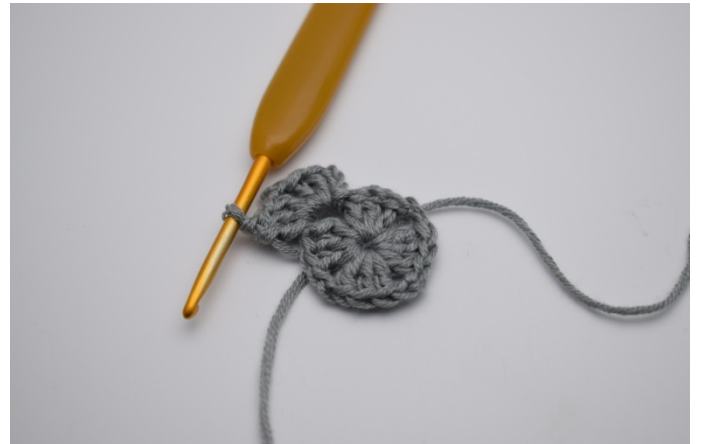
2 ch and 3 dc into the ch gap followed by 1 ch.