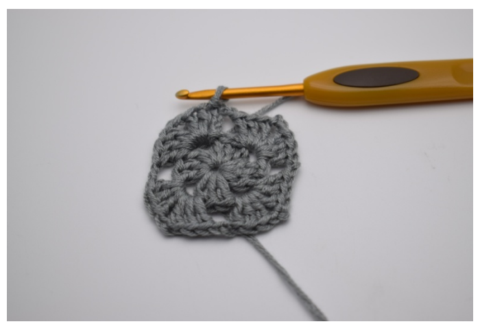
Repeat "to" in the next 2 ch gaps. Finish with 1 sl st.