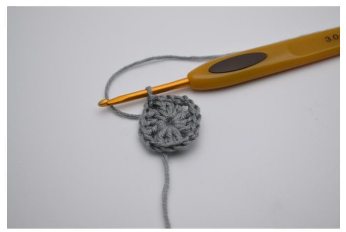
Now work sl st to the first ch gap.

2. Now work sl st to the first ch gap. Make 3 ch (replaces 1st dc). Work 2 dc, 2 ch and 3 dc into the ch gap followed by 1 ch. Work "3 dc, 2 ch, 3 dc, 1 ch" in the next ch gap. Repeat "to" in the next 2 ch gaps. Finish with 1 sl st.