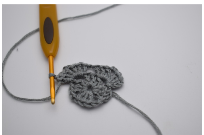
Work "3 dc, 2 ch, 3 dc, 1 ch" in the next ch gap.