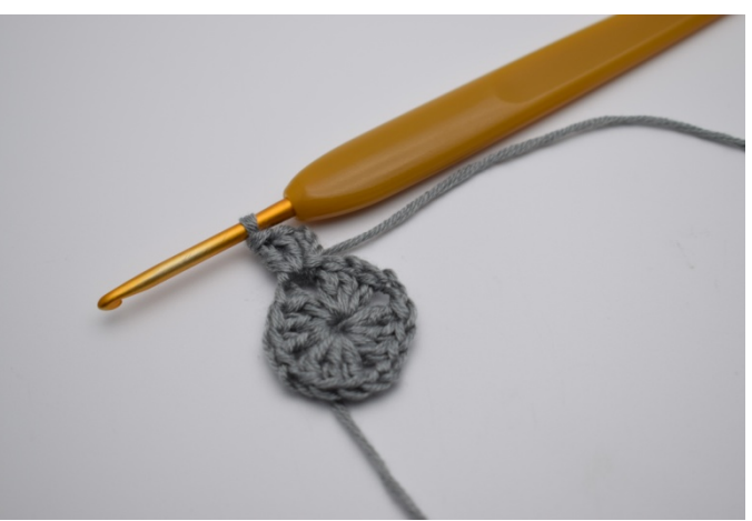
Make 3 ch (replaces 1st dc). Work 2 dc