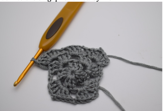
In every corner ch gap work "3 dc, 2 ch, 3 dc, 1 ch".