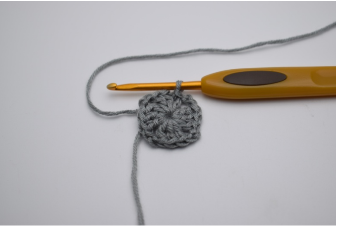
Work "3 dc into the ring and make 2 ch". Repeat another 2 times and finish with 1 sl st. Tighten the ring.