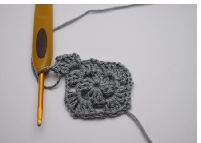
Make 3 ch (replaces 1st dc). Work 2 dc, 2 ch and 3 dc into the ch gap followed by 1 ch.