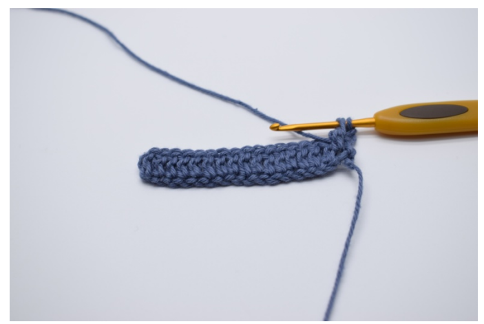
3. Yarn around the hook and take the hook around the post from the front, yarn around the hook and draw back like a regular dc.