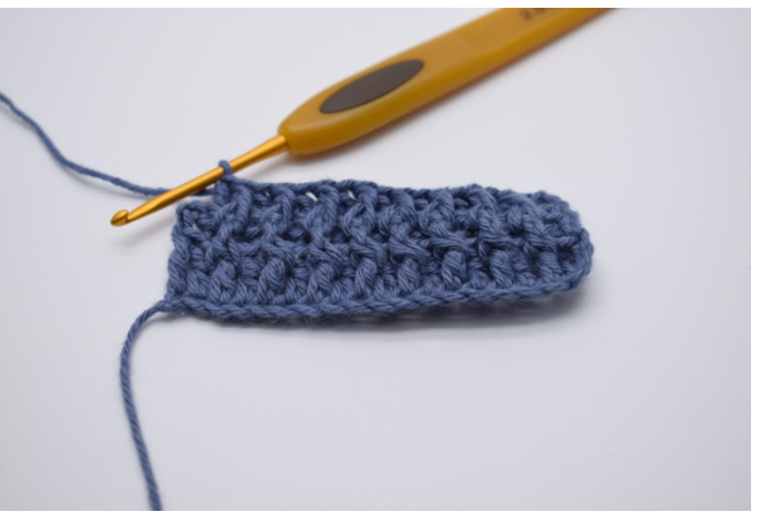
12. Repeat alternately bpdc and fpdc across. Work 1 regular dc in the turn st. Repeat the rows like this until you have the desired size.