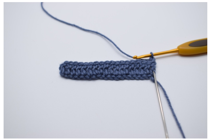
1. The first dc is replaced by the 2 ch you use to turn your work.