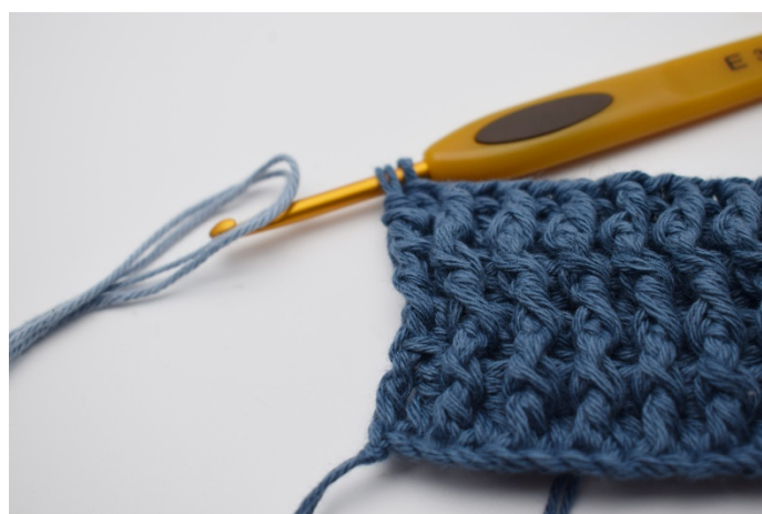
1. Color changes are made in the last pull through.