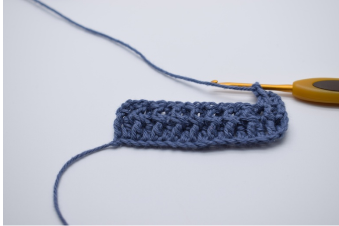
11. Work 1 fpdc around the next post.