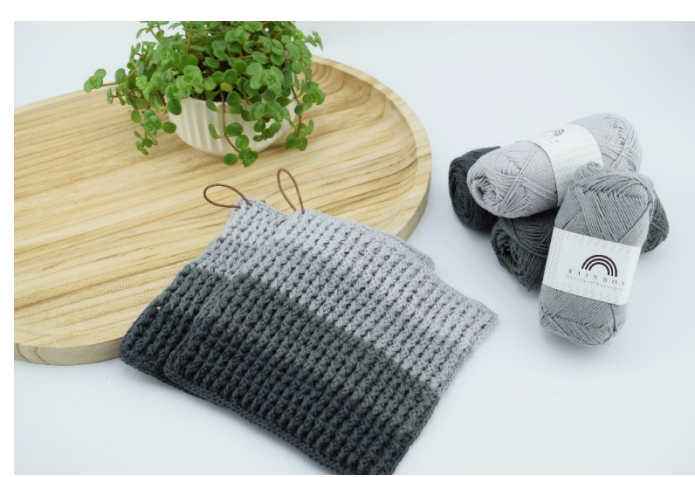
Here the following 4 colors have been used: Anthracite Grey 010, Dark Grey 011, Silver Grey 014 and Light Grey 016.

Mix the many wonderful colors of Rainbow Cotton 8/4 and design your very own Single rib potholders.