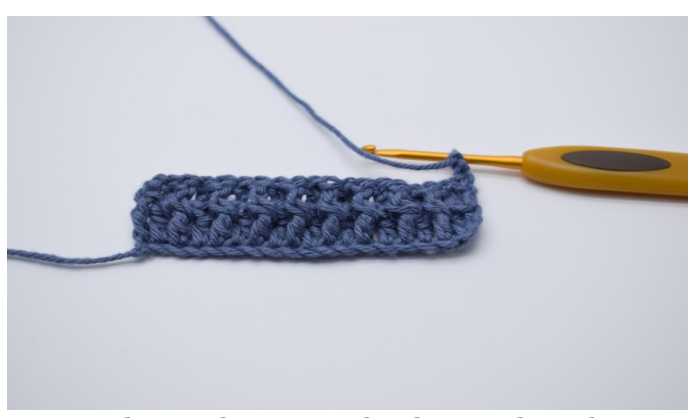
9. Turn the work using 2 ch. They replace the first normal dc.