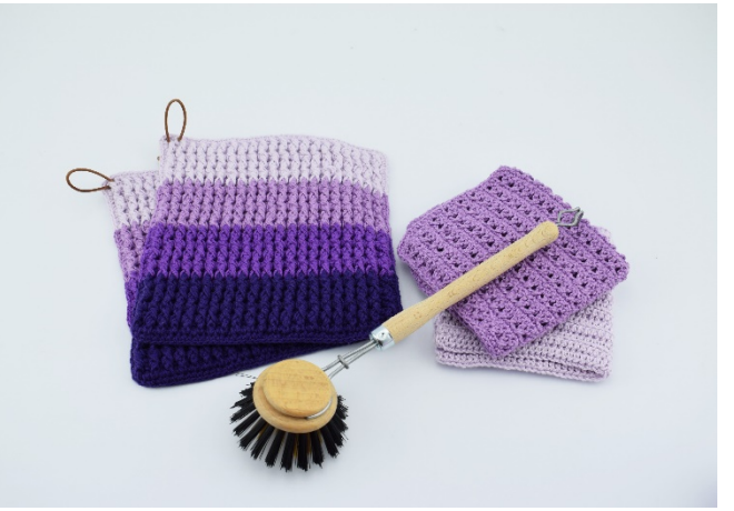
Here the following 4 colors have been used: Dark Purple 037, Purple 039, Light Purple 040 and Pastel Purple 41.

You can also make them in 2 colors as in the picture below. Here's used Mint 024 and Pastel Mint 025.