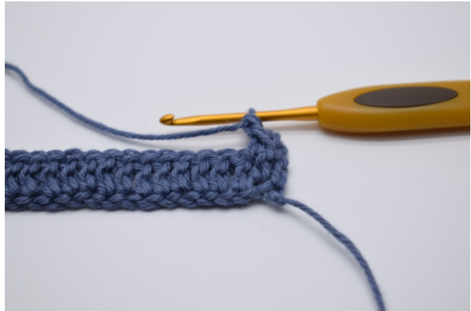
4. Yarn around the hook and finish your dc as normal. You've now made 1 fpdc.