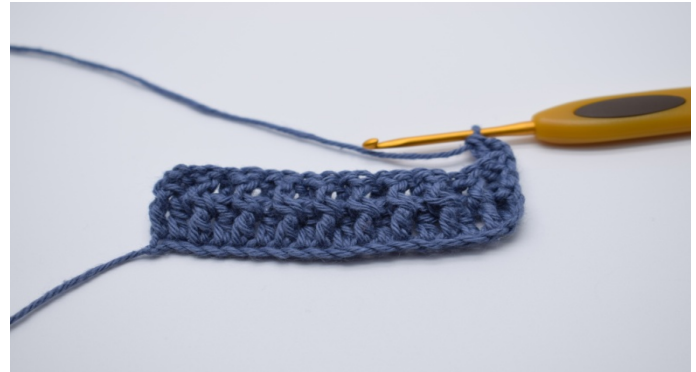
10.Now work 1 bpdc around the post from previous row.