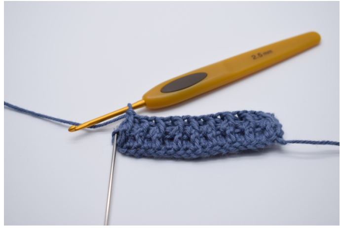
8. Now repeat alternately fpdc and bpdc across. Work 1 regular dc in the turn sts.

7. Yarn around the hook and finish your dc as normal. You've now made 1 bpdc.